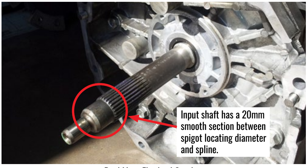
Dual Mass Flywheel Gearbox

This clutch kit is only to suit the transmission from the original single mass flywheel applications. If your input shaft has a 20mm smooth section before the spline (bottom image) DO NOT INSTALL THIS CLUTCH KIT and contact your Xtreme Performance Clutch Distributor for the correct single mass conversion kit.