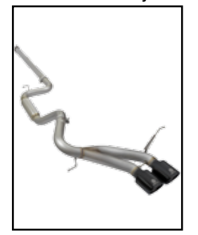
P/N: 49-33083-B (Blk Tips) 49-33083-P (Pol Tips)