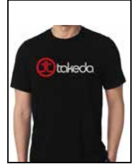
P/N: 40-30332 (M) 40-30333 (L) 40-30334 (XL)

To purchase any of the items above, view airflow charts, dyno graphs, photos, and video; please go to aFepower.com.