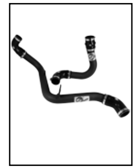
P/N: 46-20184-B (Black) 46-20184-R (Red)