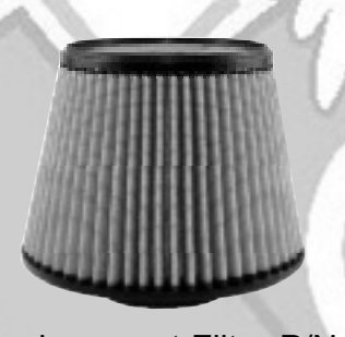
Replacement Filter P/N: TF-9008D