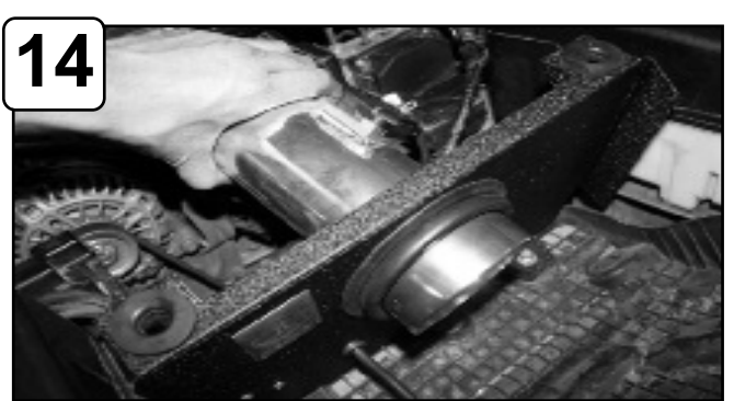
Install tube through back of housing and position.