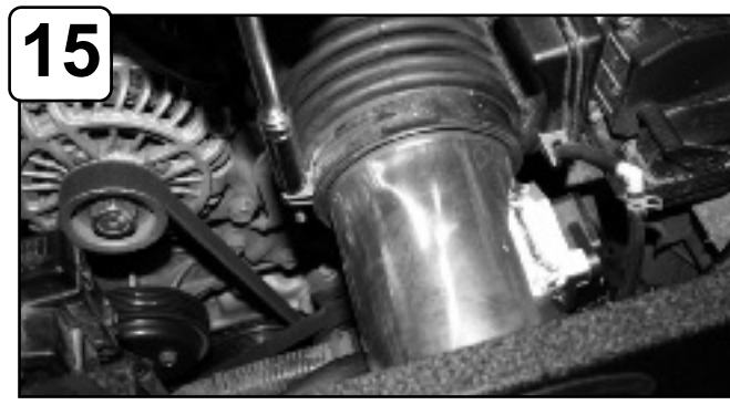
Tighten clamp using 10mm socket or wrench. Re-connect MAF sensor harness.