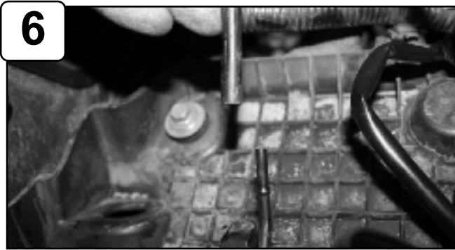
Pull back vacuum line.