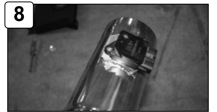
With provided M4 screws, install MAF sensor to new intake tube.