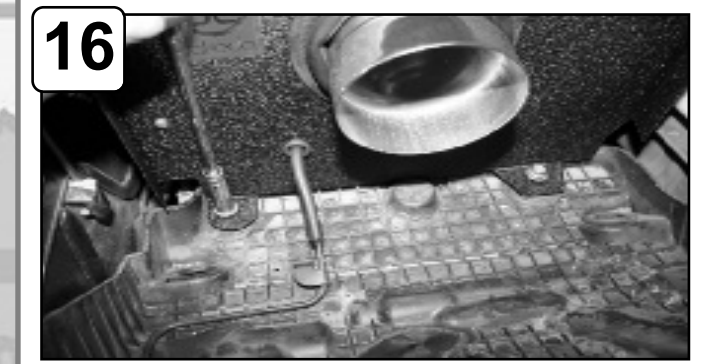
Tighten screws using 10mm socket or wrench.