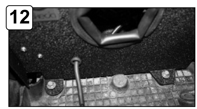
Re-install screws from step 9 to secure housing. Do not tighten.