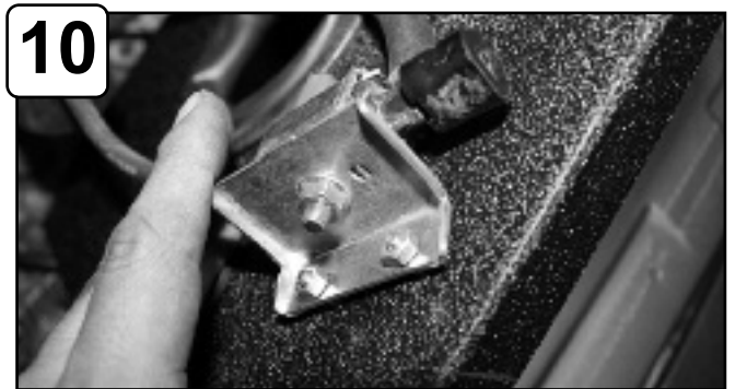
Attach VSV sensor to back of housing and secure using provided M4 screws and nuts.