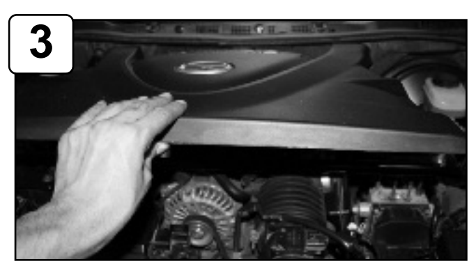
Remove engine cover.