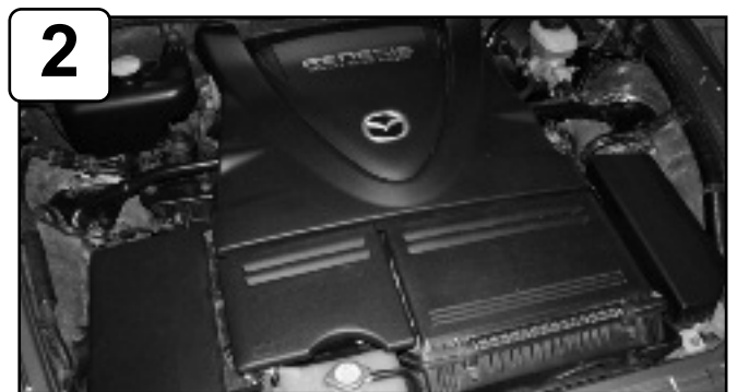
Complete Stock intake. Please disconnect battery terminals before installation.