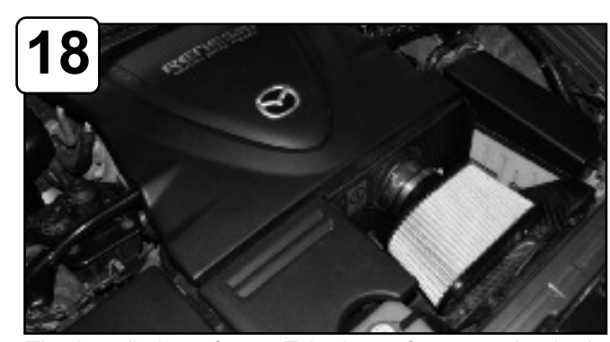
The installation of your Takeda performance intake is now complete. Please check all components and retighten if necessary. Thank you for choosing Takeda!

Note: Filter Cleaning: When cleaning your Pro Dry 5 ™ filter, be sure to use only "Restore Kit" (Takeda P/N: TP-7015C Pro Dry 5 ™ cleaner only.)