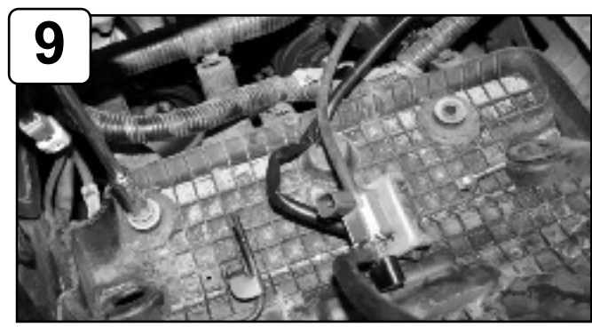
Loosen the 2 OE screws holding in air box bracket. Save for later install.