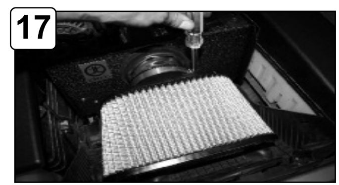
Install filter and tighten using 5/16" nut driver. Re-install engine cover. Re-connect battery terminals.