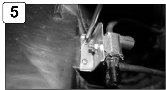
Loosen VSV sensor using phillips screwdriver on back of air box. Carefully remove. Remove air box out of vehicle.