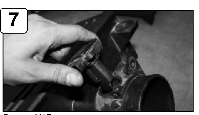
Remove MAF sensor.

Note: Read instructions before installation and have tools ready.