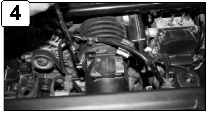
With 10mm socket or wrench loosen clamp holding in air box.