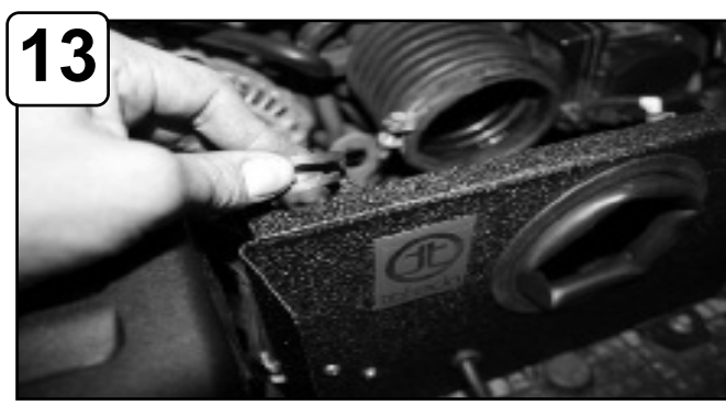
Remove OE grommets from air box and install to hole cut outs on top of housing.