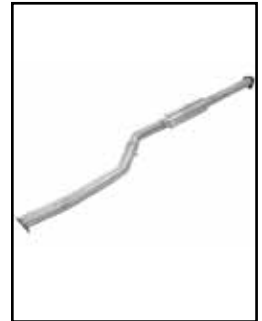
Coupe Mid-Pipe Exhaust

P/N: 49-36609 (Pol. Tips) 49-36609-B (Blk. Tips) 49-36609-L (Blue Tips)