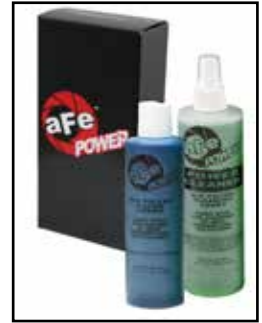
Pro 5R Restore Kit