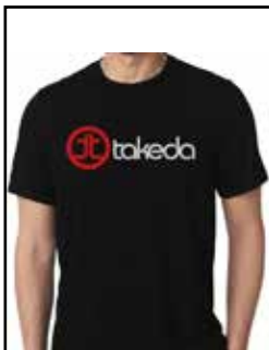
Takeda Mens T-Shirt

P/N: 40-30332 (M) 40-30333 (L) 40-30334 (XL)