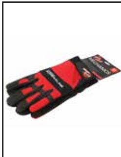
aFe Mechanics Gloves

P/N: 40-10148 (M) 40-10149 (L) 40-10194 (XL)