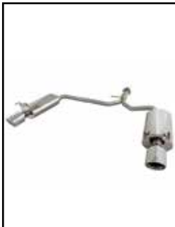
Coupe Axle-Back Exhaust

P/N: 49-36607 (Pol. Tips) 49-36607-B (Blk. Tips) 49-36607-L (Blue Tips)