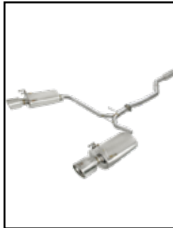
Coupe Exhaust System

P/N: 49-36609 (Pol. Tips) 49-36609-B (Blk. Tips) 49-36609-L (Blue Tips)