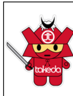
Takeda Mascot Decal

P/N: 40-30332 (M) 40-30333 (L) 40-30334 (XL)