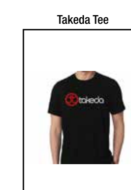
P/N: 40-30332 (M) 40-30333 (L) 40-30334 (XL)