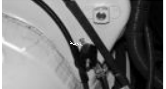
Screw vibra-mount firmly into the grounding wire pre-tapped hole until it bottoms out. Make sure the vibra-mount snug and tight over the grounding wires before moving on.