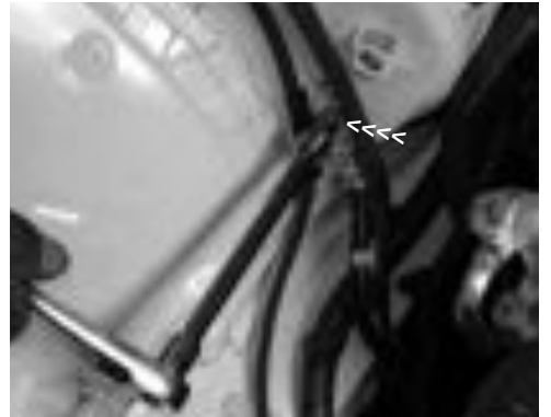
Use a 10mm socket and ratchet to remove the screw that secures the grounding wire to the fender well.