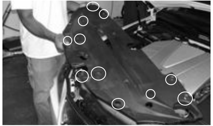
Depress center stem on the plastic clip, remove all 11 clips from the top shroud. Once all clips have been removed continue to remove the plastic front shroud.