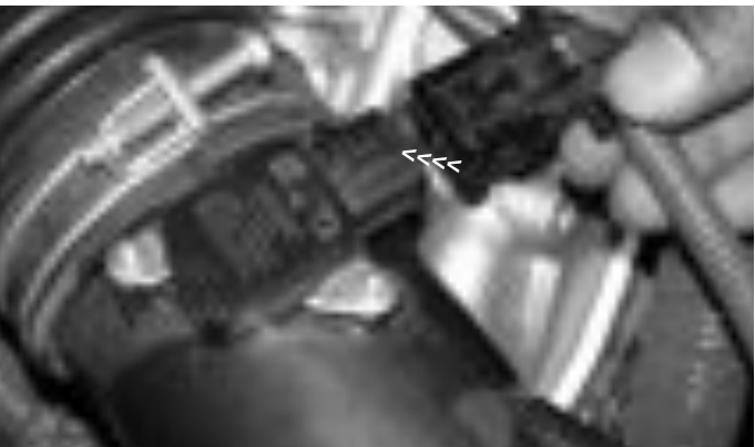
Disconnect the electrical sensor connector from the MAFS.