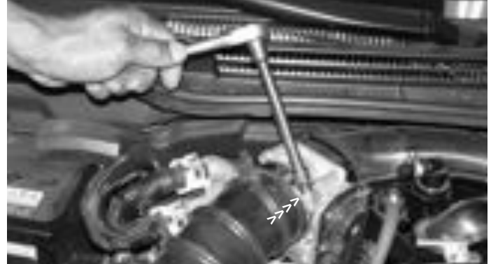
Loosen the only remaining metal clamp which secures the air duct to the throttle body as shown above.