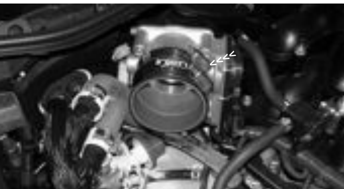
Press the 3 straight hose over the throttle body and use two power clamps. Use two power-clamps and be sure to tighten the clamp directly over the throttle body end for now.