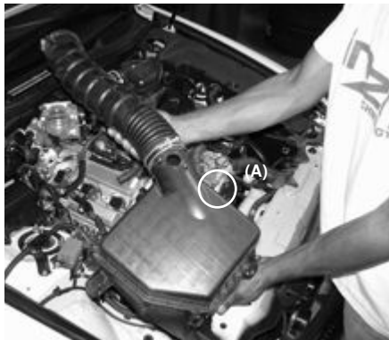
Lift and Pull the air box cleaner from the lower grommets. Before you pull the air box out, unclip sensor harness and remove from the side of the air box (A).