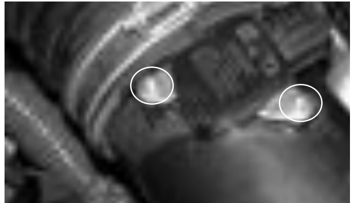
Loosen and remove the two sheet screws that fasten the MAFS to the sensor housing.