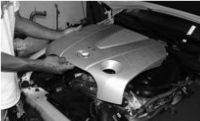
Pull the engine cover from the intake manifold by firmly pulling in a upward motion.