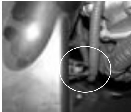
Here is a close up of the sensor harness removed from the air box clip.