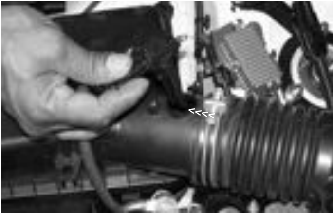
Remove the MAFS from the sensor housing as shown above. Set the MAFS to one side to be installed later in the instructions.