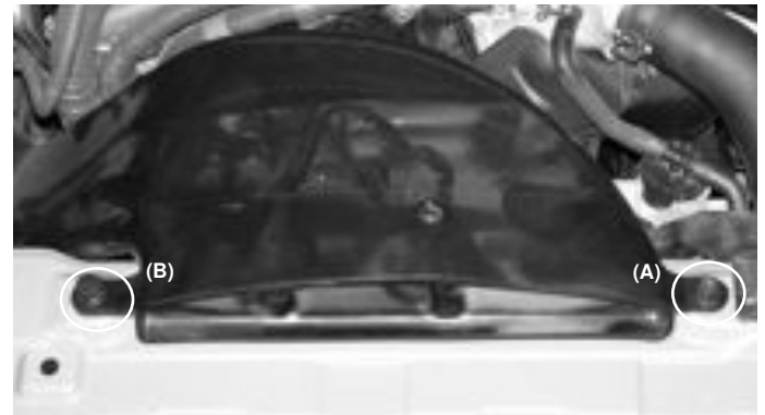
Loosen and remove one bolt (A) depress and pull the last remaining plastic clip (B) now holding the air scoop in place.