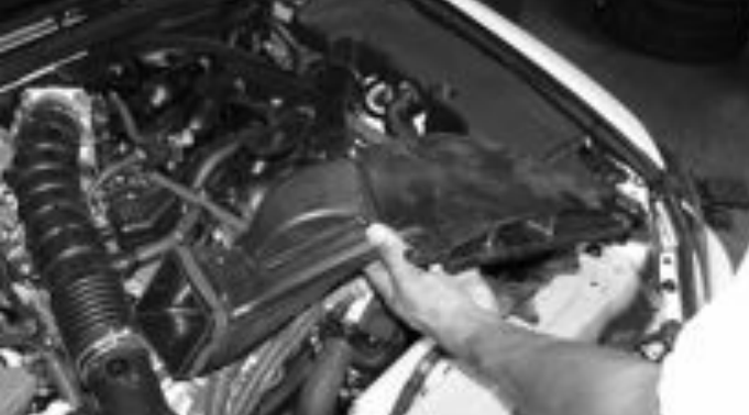
The front air scoop is now removed from its current location for now.