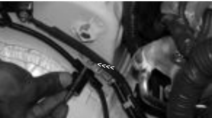
Once the screw has been removed, continue to place the vibra-mount into the pre-tapped hole as shown above.