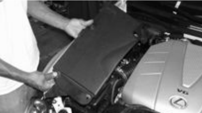
Now, continue to remove the side accessory cover which lays over the air intake box cleaner.