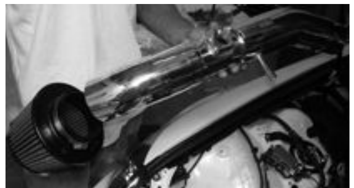
Slip the three inch filter over the end of the intake until it butts up against the filter stops. Once the filter has been firmly placed, continue to tighten the filter neck clamp.