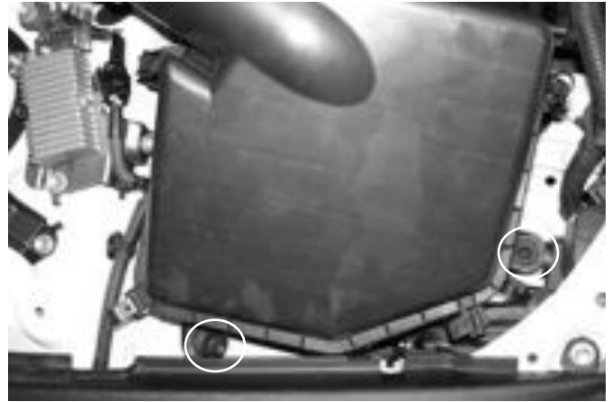
Loosen and remove the two bolts that secure the air box cleaner over the grommets.