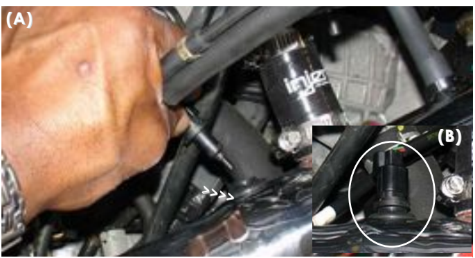
Press the air temperature sensor in to the 1525 sensor grommet (A). Insert the air temperature sensor into the grommet until it bottoms out (B).