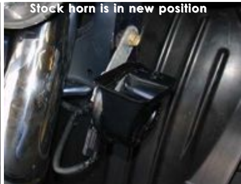
The screw is tightened into the bumper frame and the horn is now relocated.