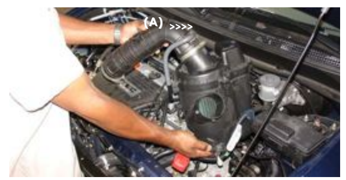
Loosen clamps and bolts in order to remove the air intake duct and air intake box from the engine compartment. Prior to pulling the air box out, remove the 8mm breather hose (A).