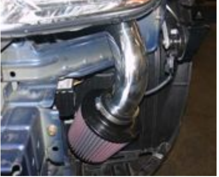
Locate the secondary intake and insert it into the bumper area via the engine compartment between the battery and front cross member