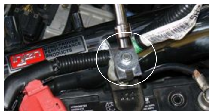
Place the m6 flange nut and fender washer over the intake bracket and vibramount stud. Take the m8 socket and Ratchet and semi-tighten the flange nut for