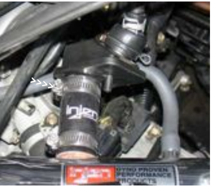
Once the CCV box has been correctly installed continue to tighten the mini-clamp.