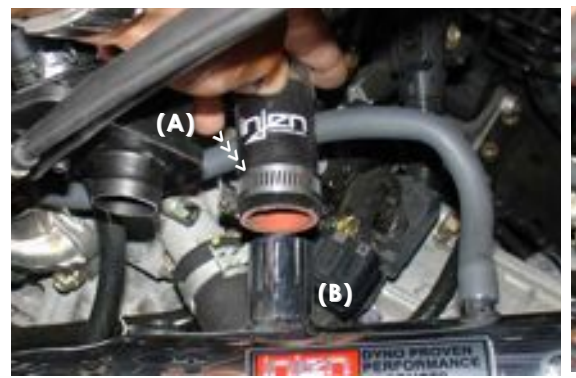
Take the 1 1/8" ID CCV hose, place two mini-clamps on each end of the CCV hose as shown above (A). Press the CCV hose over the large intake port as shown above.