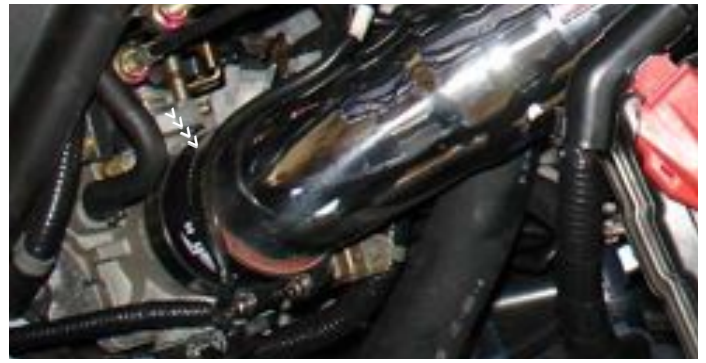
Press the intake throttle body side into the 2 3/4" hose. Align the intake bracket to the vibra-mount stud. Once the bracket has been aligned continue to semi-tighten the Power-band on the intake.