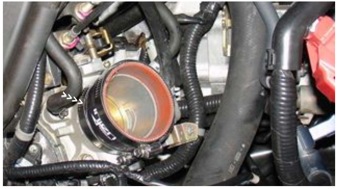
Press the 2 3/4" straight hose over the throttle body, place two Power-bands over the hose and tighten the hose on the throttle body side.