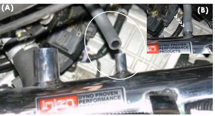
Insert the stock 8mm hose over the 3/8" intake port (A). Press the breather line just enough to hold itself in place (B).