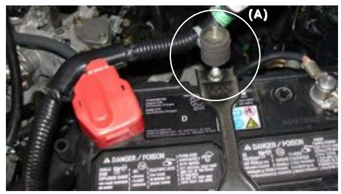
Screw the female vibra-mount over the battery post (A), \, Usually, \, 8 complete turns will be enough to level the intake bracket.