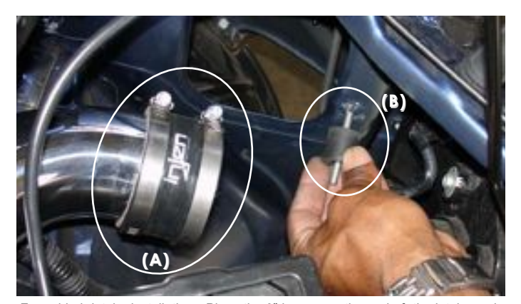
For cold air intake installation- Place the 3" hose over the end of the intake and use two Power-bands, tighten the clamp on the intake side for now (A). Take the male/female m6 vibra-mount and screw it into the fender wall pre-tapped hole as shown above (B).