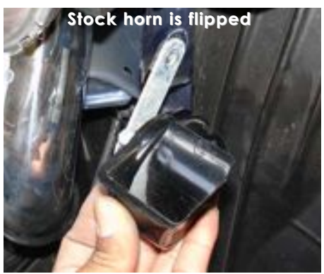
Turn the horn around so that it faces outward. Position the horn in place and screw the bolt back into the bumper frame.