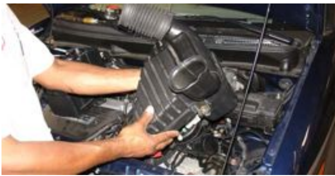
Note: For this installation, it will be required to remove the front bumper. Once the bumper has been removed continue to remove the stock air intake resonator from the bumper area.