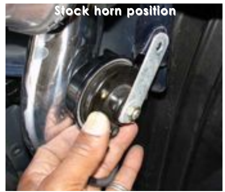
The stock horn is removed from its stock location and is turned around to keep intake from rattling.