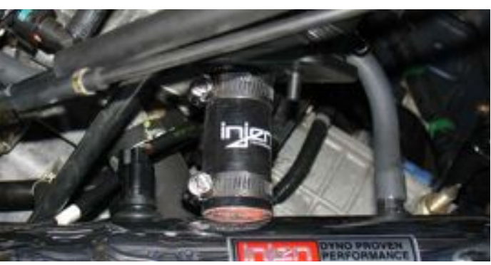
Here, the air temperature sensor, CCV hose, CCV box, and breather lines have been installed and completed.