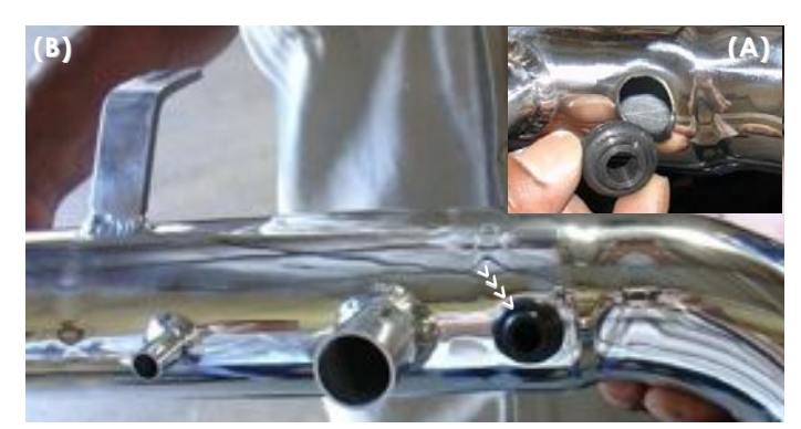
Take the 1525 sensor grommet at place it into the 3/4" pre-drilled hole (A). The sensor grommet groove will fit snug around the 3/4" holes edge (B).