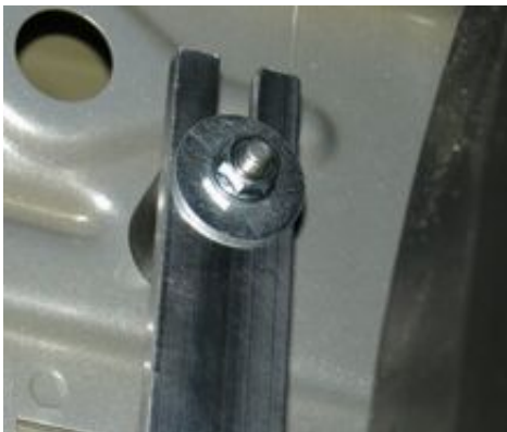
Once the intake bracket has been lined up to the vibra-mount stud, use the fender washer and flange nut to secure the intake to the vibra-mount.