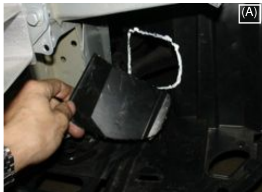
A small 4" cut away section is cut out of the plastic splash guard as shown above. The cut away is in a form of a "C", three sides are cut out (A). Clearance has been made and the secondary intake is now ready to be installed (B).