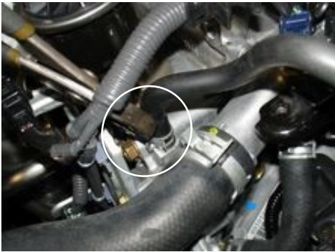
Using pliers, remove the tension clamp located on the upper coolant outlet hose running to the throttle body.