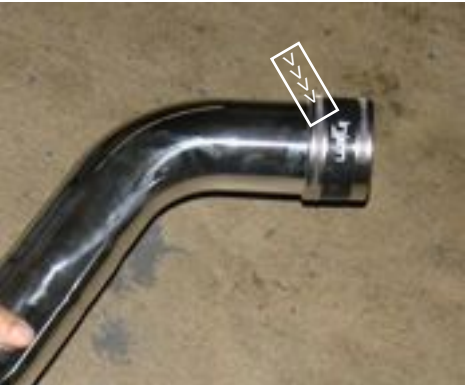
Take the remaining three inch straight hose and press it over the secondary intake. Use two clamps and tighten the clamp located on the intake side.