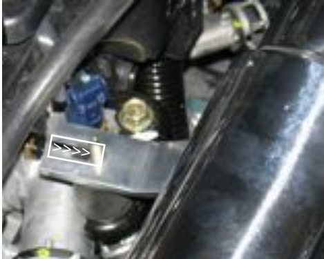
As the top end of the intake is inserted into the throttle body hose carefully align the intake bracket to the vibra-mount stud as shown above.