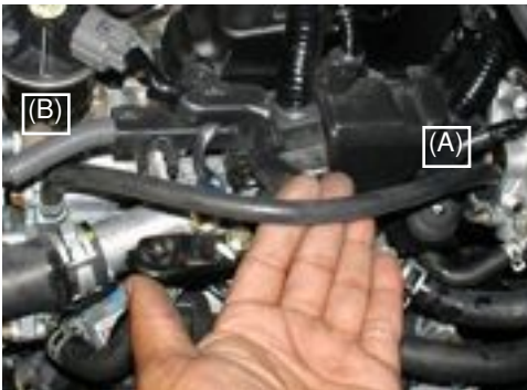
The 15"-6mm vacuum hose is now connected from the throttle body (A) to the upper coolant outlet port (B).