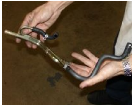
The PCV hard pipe is now removed from the stock coolant and breather lines.