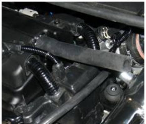
Press the 6"-17mm breather hose over the crank case port as shown above.