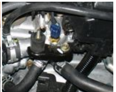
Screw the vibra-mount firmly into the brace until it sits flush on the brace.