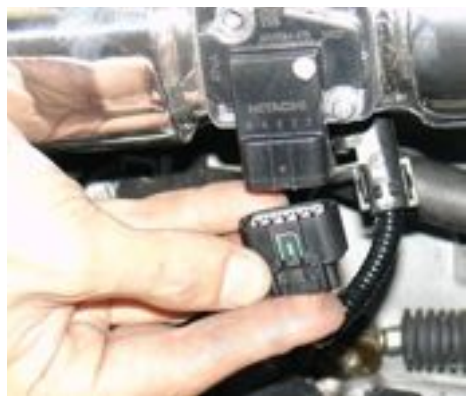
The harness clip is press over the air mass sensor until it you here a click that secures the harness.