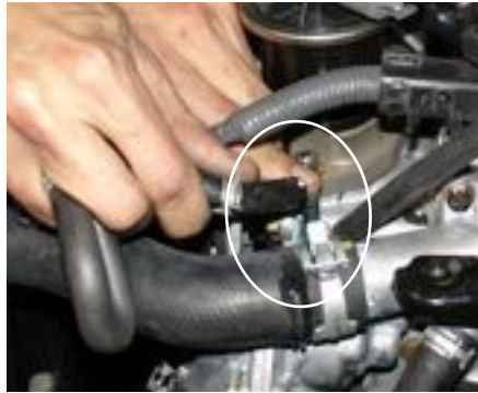
Remove the stock upper coolant outlet hose pressed over the port as shown above. Place finger over the port to prevent coolant from spraying out.