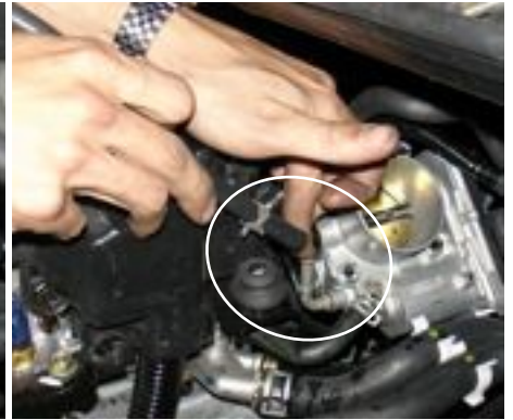
Take the Injen 15"-6mm braided vacuum hose and press it over port. Use the tension clamp to reconnect and secure the hose in place.