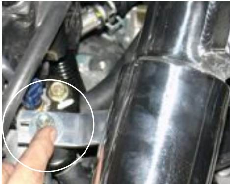
Use the fender washer and flange nut to secure the intake to the vibra-mount stud.