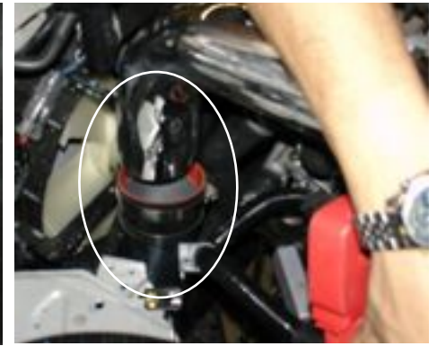
As the secondary intake is raised into the engine compartment, press the 3 inch hose over the end of the primary intake.