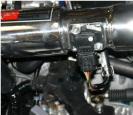
Close up of the air mass sensor connected to the machined adapter and the harness has been secured to the sensor.