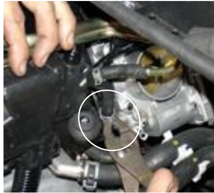
With pliers, remove the tension clamp connecting the coolant line running to the throttle body. Now remove the hose from the port.