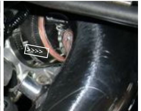
The top end of the intake is firmly pressed into the 2 1/2" hose while the clamp is semi-tightened.