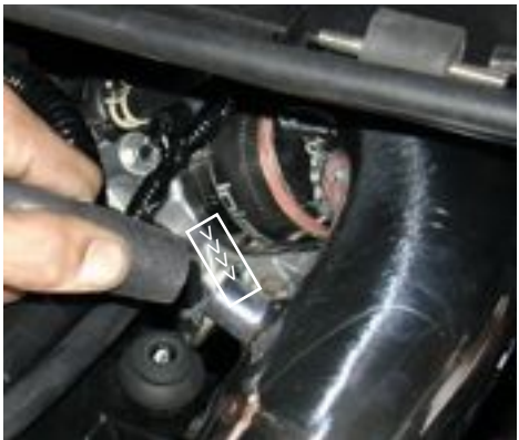
Press the other end of the 6" vacuum line over the intake port as shown above.