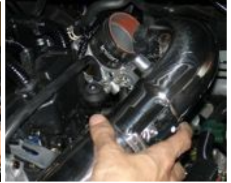
Gently, insert the top end of the intake into the 2 1/2" straight hose located on the throttle body.