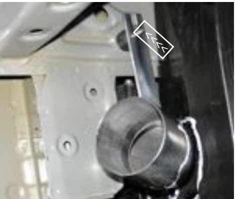
As the secondary intake is butted up to the primary intake, the intake bracket is also lined up to the vibra-mount stud.