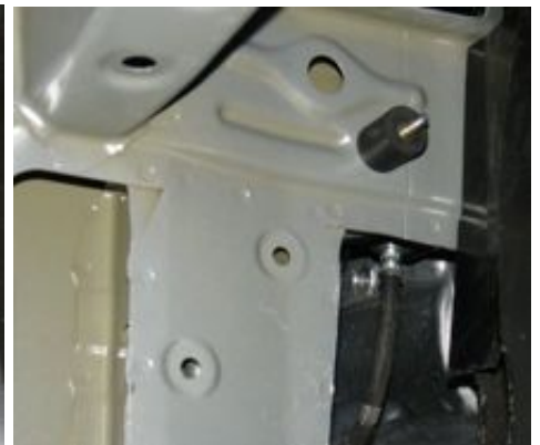
The vibra-mount is firmly sitting flush on the frame as shown above.