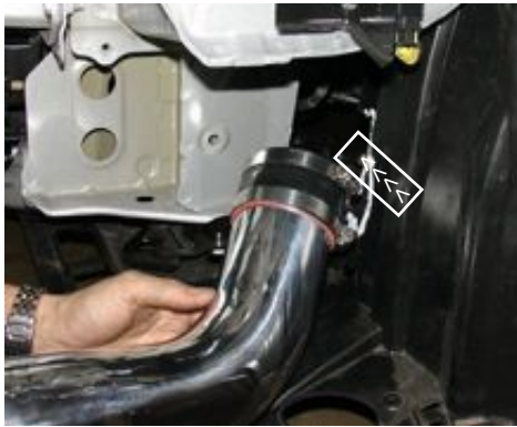
Insert the end with the 3 inch straight hose into the pre-cut hole and gently push it into the engine compartment until it connects with the primary intake.