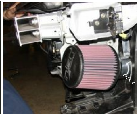
Press the filter over the end of the secondary intake and tighten the clamp on the filter neck. You have now completed the installation of this intake system.