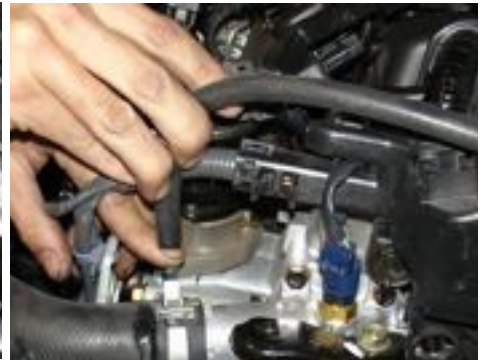
Now press the other end of the 15"-6mm hose coming from the throttle body, over the port located on the upper coolant outlet. The finger over the port is used to stop coolant from splashing out.