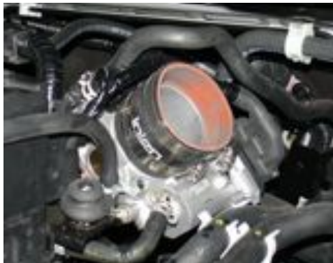
Press the 2 1/2" straight hose over the throttle body and tighten the clamp on the throttle body end.