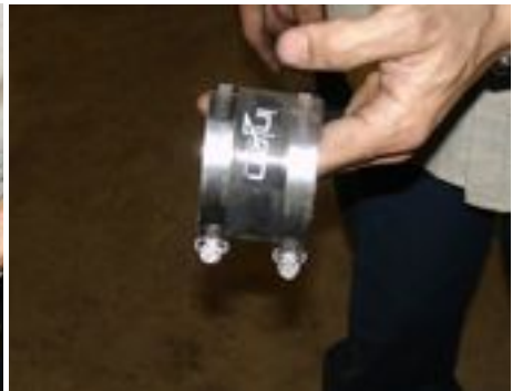
Place two clamps on the 2 1/2" straight hose as shown above.