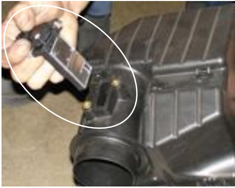
Unscrew the two screws that hold the mass air flow sensor to the housing unit.