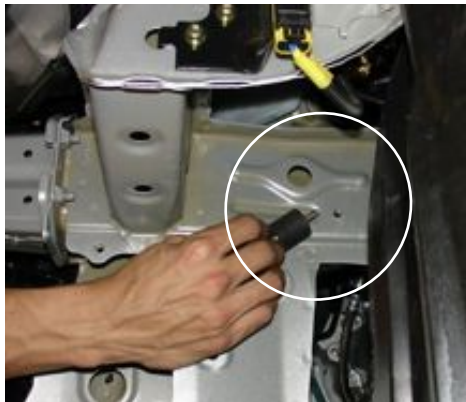
The secondary vibra-mount is aligned and screwed into the pre-tapped hole located on the side frame.