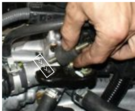
Take the vibra-mount and line it up to the air box brace mounted on the upper coolant outlet housing.