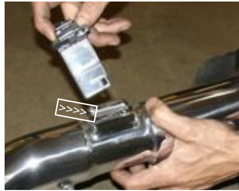
Checking the direction of the air flow sensor, insert sensor into the machined air flow adapter as shown above. Use stock screws to secure the sensor to the machined adapter.