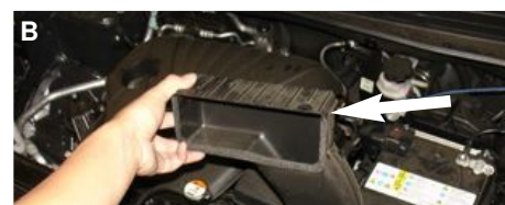
Figure A: Use a phillips screw driver and remove the two plastic retaining screws on the front vent duct. Figure B: This air duct will be removed.