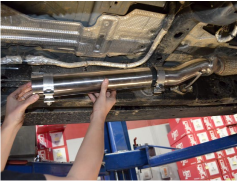
5. FOUR DOOR MODELS ONLY: Attach the mid pipe extension to the front pipe. Secure using the provided 76mm clamps.