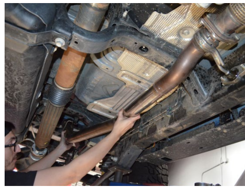
3. Remove the OEM mid pipe.