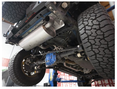
9. Ensure all bolts and clamps are properly secured.

CONGRATULATIONS! You have just completed the installation of this exhaust system. Periodically, check the alignment of the exhaust, normal wear and tear can cause nuts and bolts to come loose. Note: Check clearance and adjust if needed! Failure to check the alignment and adjust the exhaust can cause damage that will void the warranty. Injen Technology is not responsible for any damages caused by/from improper installation.