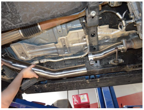
6. Connect the mid pipe to the front pipe. Secure using the provided 76mm clamps.