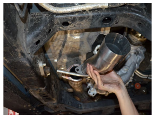
4. Connect the front pipe to the OEM flex pipe, then insert the hanger to the rubber insulator. Secure using the OEM fasteners.