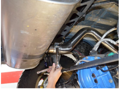
8. Connect the mid pipe to the OEM muffler and secure using the provided 66mm clamp.