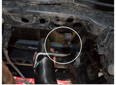
7. Insert the mid pipe hanger to the rubber insulator.