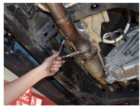
1. Remove the two nuts securing the mid 2. Detach the midpipe hanger from the pipe to the OEM flex pipe. Then detach the rubber insulator. front hanger from the rubber insulator.