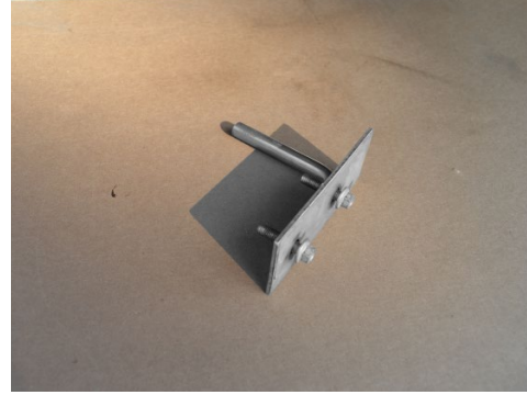
11. 2.3L MODELS ONLY: Install the two factory bolts to the injen hanger bracket. Leave 1/4" distance between the bolt head and the bracket plate.