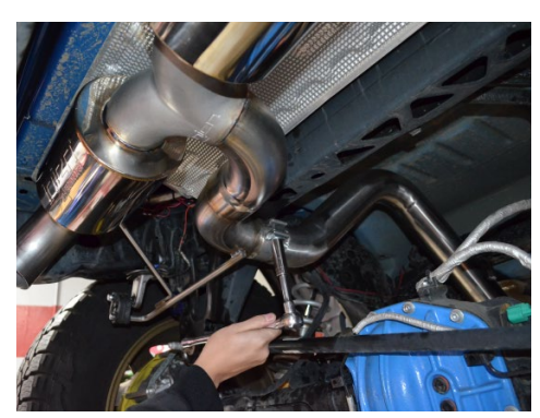
19. If necessary loosen all the clamps and adjust the fitment of the exhaust.