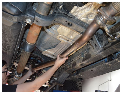
4. Remove the OEM mid pipe.