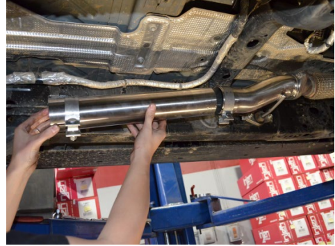
6. FOUR DOOR MODELS ONLY: Attach the mid pipe extension to the front pipe. Secure using the provided 76mm clamps.