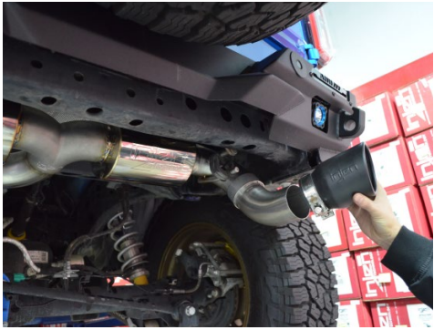
18. OPTIONAL: Attach exhaust tips to the tip extension.

CONGRATULATIONS! You have just completed the installation of this exhaust system. Periodically, check the alignment of the exhaust, normal wear and tear can cause nuts and bolts to come loose. Note: Check clearance and adjust if needed! Failure to check the alignment and adjust the exhaust can cause damage that will void the warranty. Injen Technology is not responsible for any damages caused by/from improper installation.