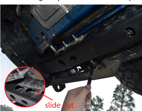
9. 2.3L MODELS ONLY: Remove the OEM hanger by loosening the two bolts and then sliding it out. The bolts can be accessed from the rear of the subframe.