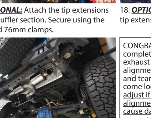
20. Ensure all bolts and clamps are properly secured.