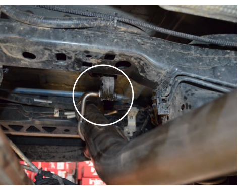
3. Detach the midpipe hanger from the rubber insulator.