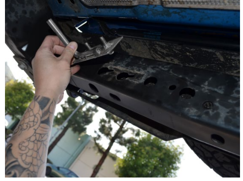
12. 2.3L MODELS ONLY: Slide the injen bracket into place. Then secure the two bolts.