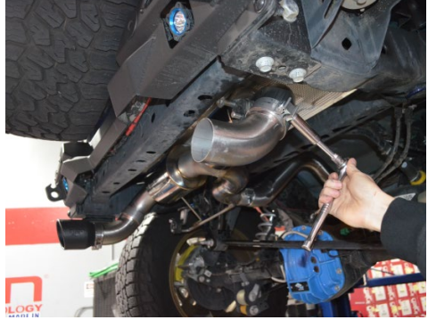
17. OPTIONAL: Attach the tip extensions to the muffler section. Secure using the provided 76mm clamps.