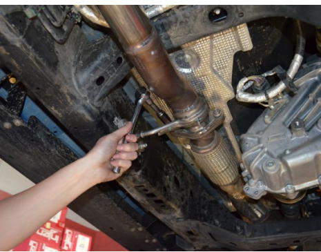
pipe to the flex pipe. Then detach the front hanger from the rubber insulator.