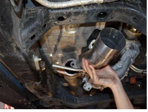
5. Connect the front pipe to the OEM flex pipe, then insert the hanger to the rubber insulator. Secure using the OEM nuts.