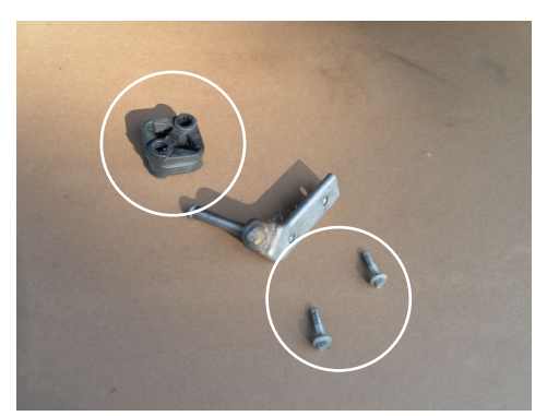
10. 2.3L MODELS ONLY: Remove the two bolts and rubber insulator from the exhaust bracket.