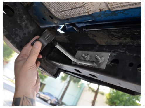
13. 2.3L MODELS ONLY: Insert the rubber 14. Connect the muffler section to the mid 15. Insert the driver side hanger into the insulator onto the exhaust hanger bracket. pipe. Secure with the provided 66mm