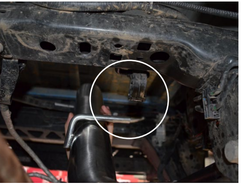
8. Insert the mid pipe hanger to the rubber insulator.