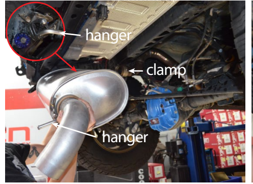
1. Remove the OEM muffler by loosening the 2. Remove the two nuts securing the mid mid pipe clamp and detaching the muffler from the rubber insulators