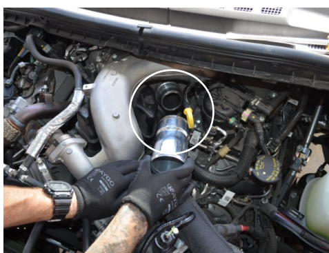
8. Install the secondary hot side intercooler pipe onto the turbo outlet. You secondary hot side intercooler pipe. should hear the retaining clip engage.