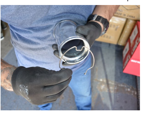
6. Install the OEM retaining clip onto the Injen secondary hot side intercooler pipe.