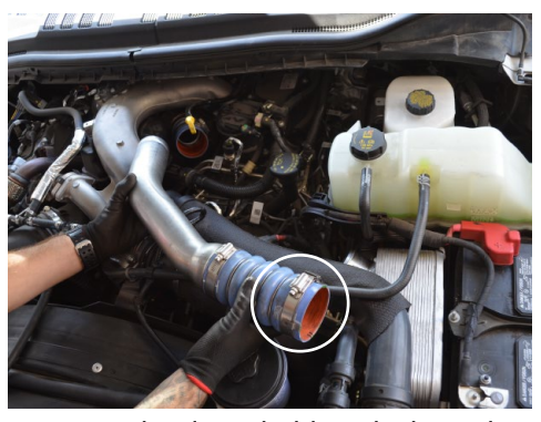
2. Loosen the clamp holding the hot side hot side intercooler pipe to the turbo inlet. intercooler pipe to the intercooler then remove the hot side charge pipe.