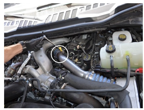
1. Loosen the clamp connecting the OEM