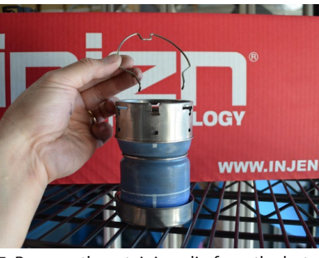
5. Remove the retaining clip from the hot side turbo outlet coupler.