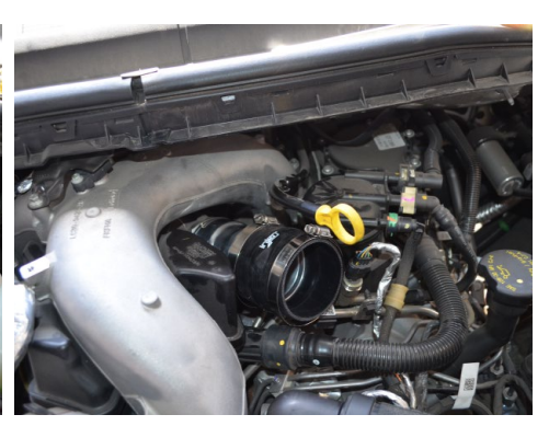
9. Install the 3.00" hump hose onto the Secure using the provided clamps.