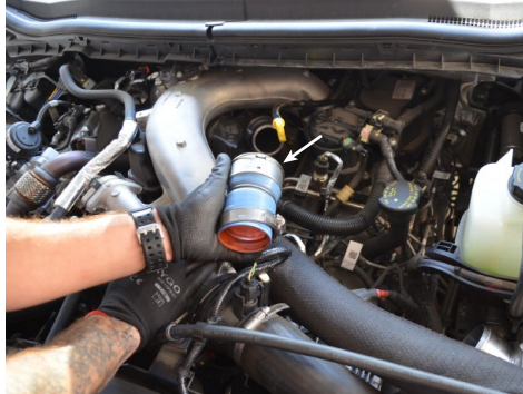
3. Disengage the retaining clip attached to the turbo outlet by prying up on the retaining clip then remove the hot side turbo outlet coupler.