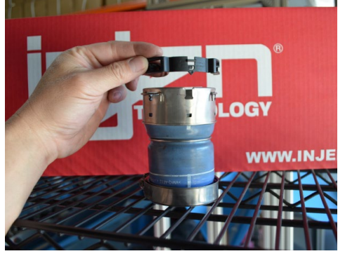
4. Remove the plastic retaining clip from the hot side turbo outlet coupler by carefully prying on both ends and then lifting up.