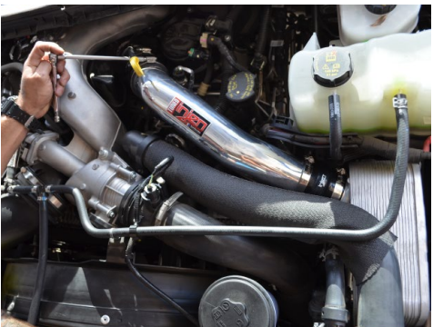
11. Install the Injen primary hot side intercooler pipe. Secure all clamps. Ensure the rtaining clip is properly engaged.

CONGRATULATIONS! You have just completed the installation of this intercooler piping system. Periodically, check the alignment of the intercooler piping, normal wear and tear can cause nuts and bolts to come loose. Note: Check clearance and adjust if needed! Failure to check the alignment and adjust the intercooler piping can cause damage that will void the warranty. Injen <u>Technology is not responsible for any</u> damages caused by/from improper installation.