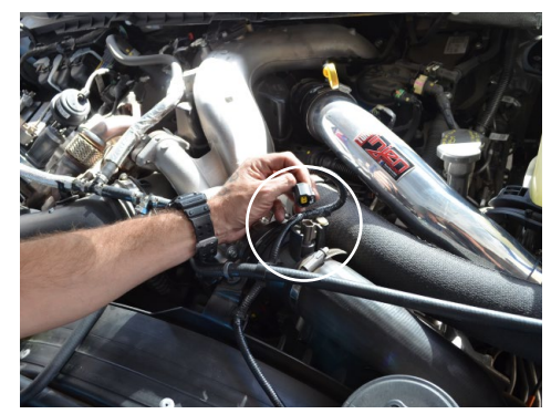
1. Disconnect the IAT sensor harness located on the OEM cold side intercooler pipe.