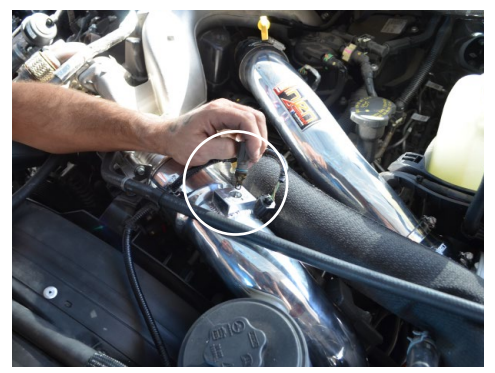
13. Install the IAT sensor onto the cold side 14. Reconnect the IAT sensor harness. intercooler pipe. Once fully seated, rotate the sensor to secure the tab in place.