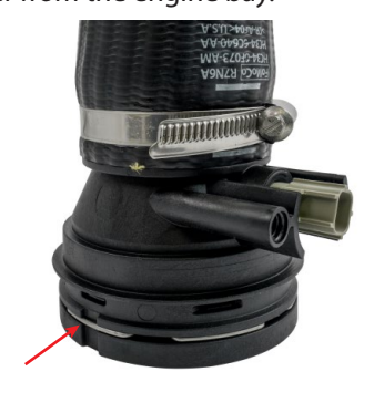
8. Remove the OEM retaing clip from the IAT sensor adapter.