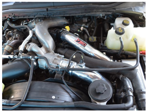
15. Ensure all bolts and clamps are properly secured. Ensure all retaining clips have properly engaged.

CONGRATULATIONS! You have just completed the installation of this intercooler piping system. Periodically, check the alignment of the intercooler piping, normal wear and tear can cause nuts and bolts to come loose. Note: Check clearance and adjust if needed! Failure to check the alignment and adjust the intercooler piping can cause damage that will void the warranty. Injen Technology is not responsible for any damages caused by/from improper installation.