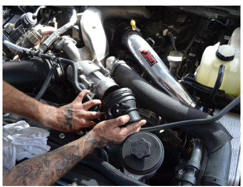
5. Disengage the retaining clip from the IAT sensor adapter then remove the adapter from the engine bay.