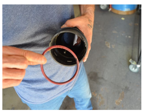
6. Remove the O-Ring from the IAT sensor adpater. Note the direction it was removed in.