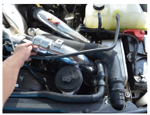
12. Once the intercooler pipe is in place. Secure the clampsthen secure the power steering reservoir to its factory location.