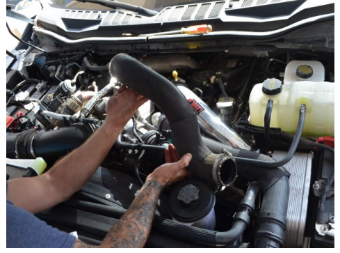
4. Remove the cold side intercooler pipe from the engine bay.