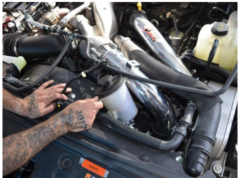
11. Remove the bolt securing the power steering reservoir then move the reservoir to give clearance for installing the intercooler pipe.