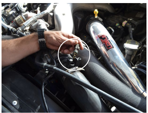
2. Lift the tab on the IAT sensor then twist 3. Loosen both clamps from the cold side the sensor a 1/4 turn to remove it from the intercooler pipe. cold side intercooler pipe.