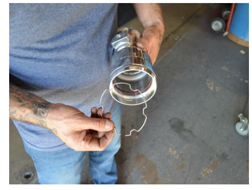
9. Install the retaining clip onto the cold side intercooler pipe.