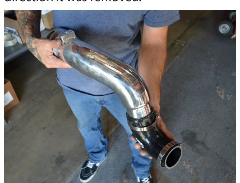
10. Install the elbow hose onto the cold side intercooler pipe. Secure using the provided clamps.