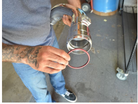
7. Install the OEM O-Ring onto the Injen cold side intercooler pipe in the same direction it was removed.