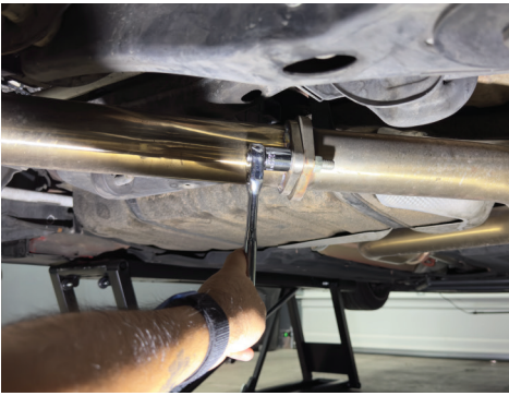
2. Remove the two nuts securing the mid pipe to the OEM muffler section.