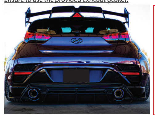
7. Ensure all bolts, nuts, and clamps are properly secured.

CONGRATULATIONS! You have just completed the installation of this exhaust system. Periodically, check the alignment of the exhaust, normal wear and tear can cause nuts and bolts to come loose. Note: Check clearance and adjust if needed! Failure to check the alignment of the exhaust can cause damage that will void the warranty. Injen Technology is not responsible for any damages caused by/from improper installation.