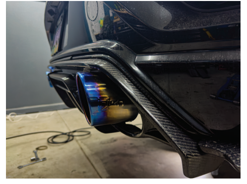
6. Adjust the exhaust tips to the desired