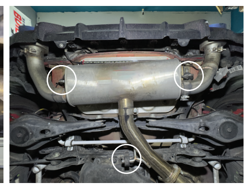
3. Detach the three hangers from the rubber insulators, then carefully remove the exhaust.