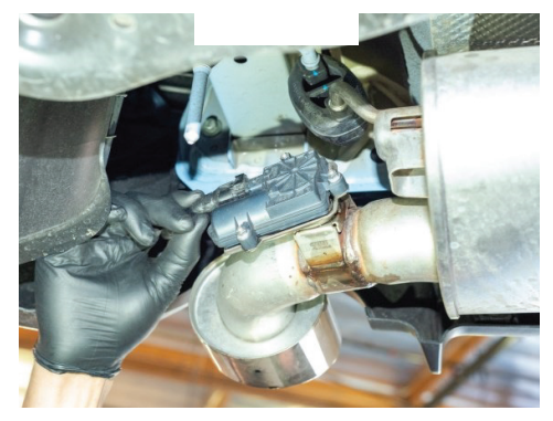
1. If equipped with exhaust valve, disconnect the exhaust valve harness. Secure the harness with the provided zip tie, it will no longer be used.