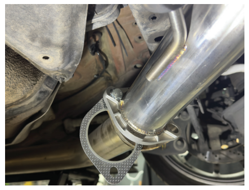
4. Insert the injen front pipe hanger into the rubber insulator, then secure the front pipe to the oem exhaust with the provided hardware. Ensure to use the provided exhasut gasket.