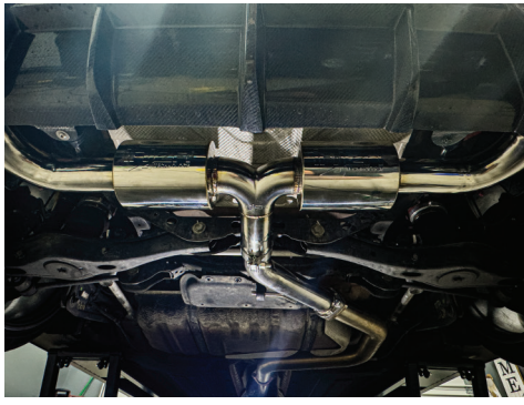
5. Insert the muffler section hangers into the rubber insulators, then secure the muffler section location then secure the clamps. to the front pipe with the provided clamp.