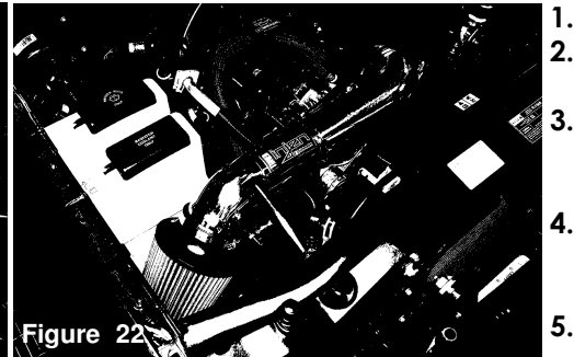
Congratulations! You have just completed the installation of this intake system. Periodically, check the alignment of the intake, normal wear and tear can cause nuts and bolts to come loose. Failure to check the alignment and adjust the intake can cause damage that will void the warranty.

1. Upon completion of the installation, reconnect the negative battery terminal before you start the engine. 2. Align the entire intake system for the best possible fit. Once the intake has been properly fitted continue to tighten all nuts, bolts and clamps.