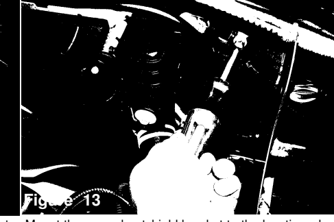
Place the heatshield into position and line up the two lower Place one M6 nut and washer on each stand off stud and holes on the heatshield to the two stand off studs already then secure nuts with a 10mm socket and rachet. on the grommets from figure 9.