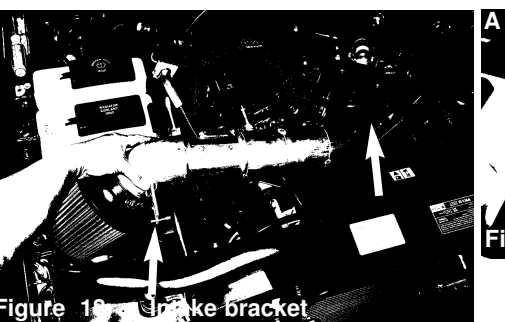
Position the intake pipe into the engine bay. Place the intake pipe into the step hose already on the throttlebody and also line up the intake bracket to the vibramount on the heatshield.

a 8mm nut driver to secure the filter clamp