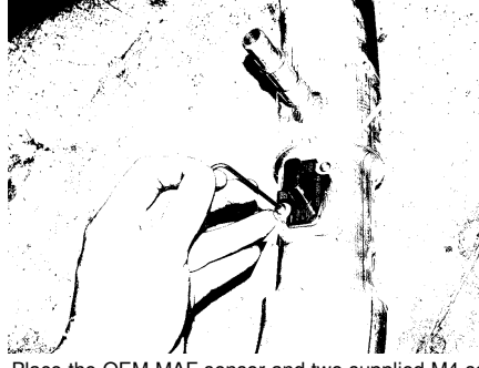
Place the OEM MAF sensor and two supplied M4 screws onto the welded MAF sensor adapter welded on the Injen intake pipe. Then secure the screws with a 2.5mm Allen wrench.