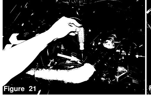
Make sure the intake pipe, filter and heatshield doesn't come into contact with anything and then make your final adjustment before securing the last clamp on the throttlebody.