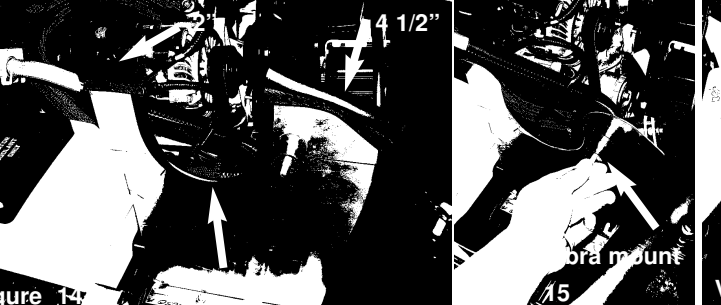
Place the 4 1/2" vinyl trim with pad on the upper right side, Place the vibra mount onto the left side of the heatshield Place a M6 nut and washer on the right side of the heatshield to attach the vibra mount to the heatshield and then secure the M6 nut to lock the vibra mount in place.