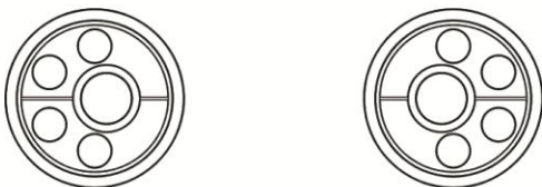
REAR OF VEHICLE