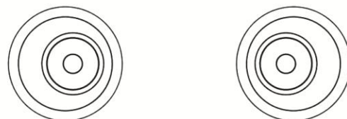
REAR OF VEHICLE