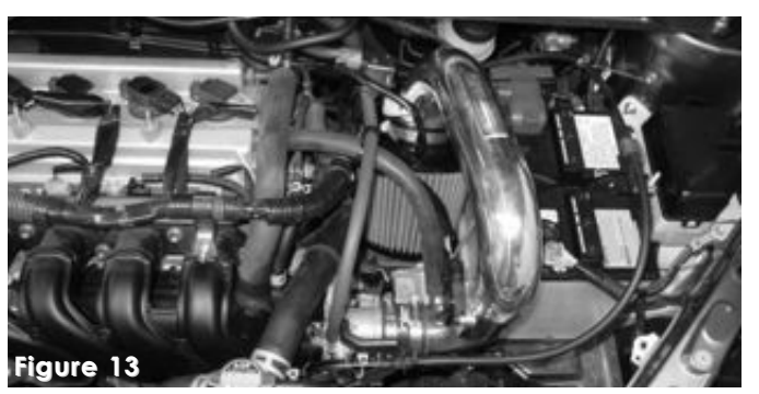
Congratulations! The installation of the IS2105 is now complete.