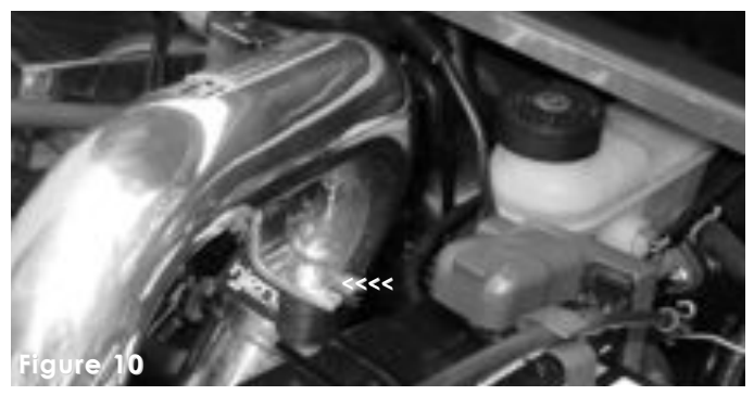
Line up the bracket on the intake to the vibra-mount stud and use an m6 flange nut and fender washer to secure the intake in place.