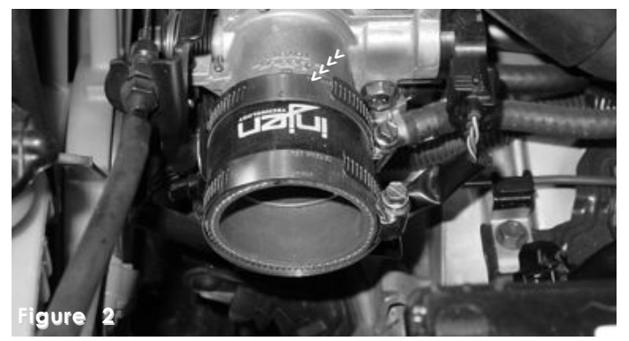
Press the 2 1/4 straight hose over the throttle body and use two clamps, tighten the clamp on the throttle body at this point.