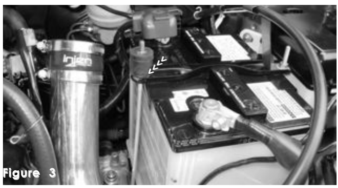
Take the male/female vibra-mount and screw it on the end of the threaded battery post. The vibra-mount will need to be adjusted up or down according to the bracket location on the primary intake.