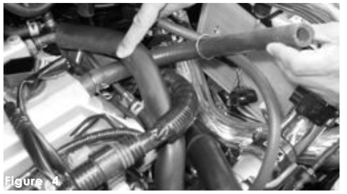
Take the 14 15mm heater hose and press it over the port located on the crankcase. The stock hose clamps will be used to prevent the hose from slipping out.