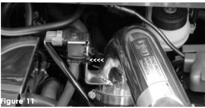
Insert the vacuum switching valve over the mounting bracket. Use the zip tie provided in this kit to keep the vacuum switching valve from vibrating.