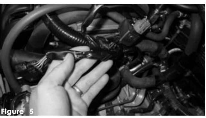
The harness line is moved out of the way prior to installing the primary intake. The harness will be used later in the instructions to reconnect the air temperature sensor.