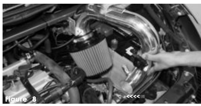
Lower the assembled intake system into the engine compartment and press the 2 1/4 end into the hose on the throttle body.