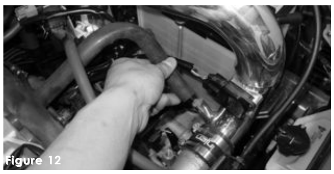
Press the end of the 15mm hose over the 5/8 port on the intake, use the stock hose clamp to secure the hose in place.