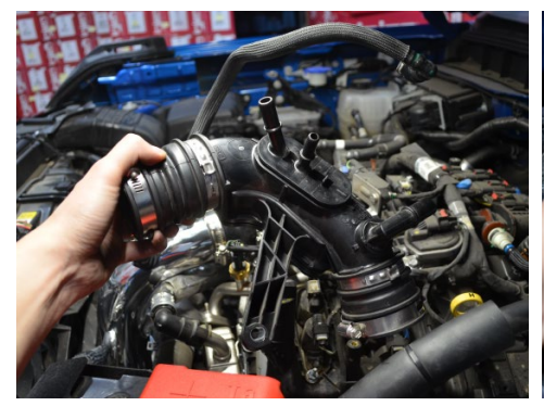
13. Loosen the clamp securing the driver side tube to the turbo inlet and then remove the tube.