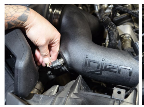
37. Reconnect the IAT sensor harness.