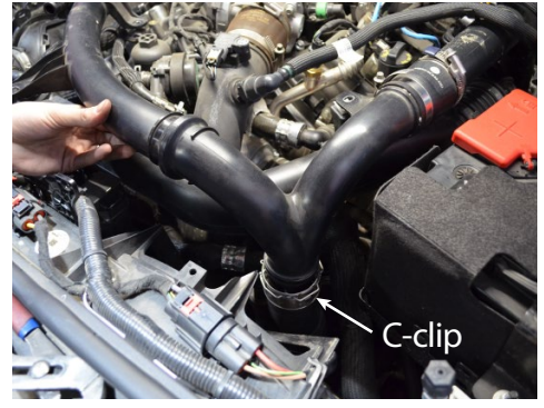
then lift up the charge pipe.