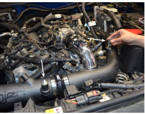
38. Install the provided M6 vibra mounts to the driver and passenger side tube.