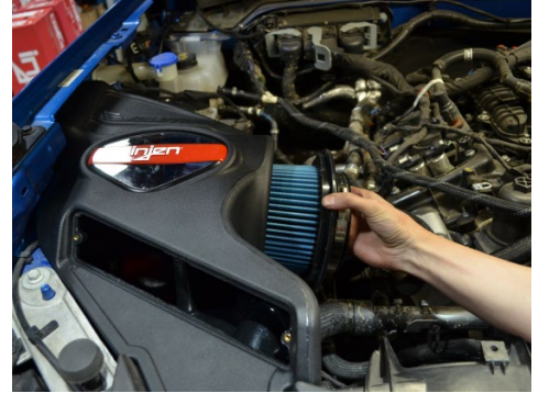
24. Install the twist lock filter on to the Injen air box. Once seated, rotate the filter a 1/4 turn in either direction so the filter can lock into place