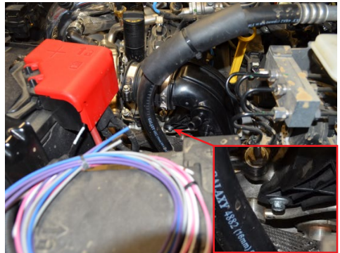
11. Remove the bolt securing the driver side intake tube to the engine.