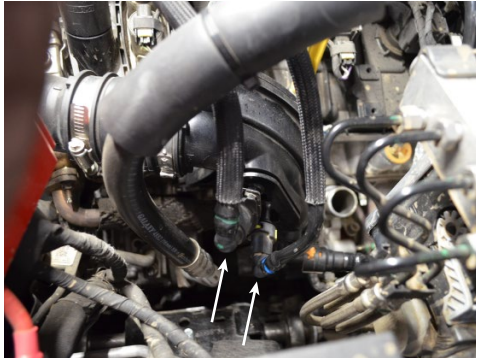
the intake tube by pressing down on the locking clips.