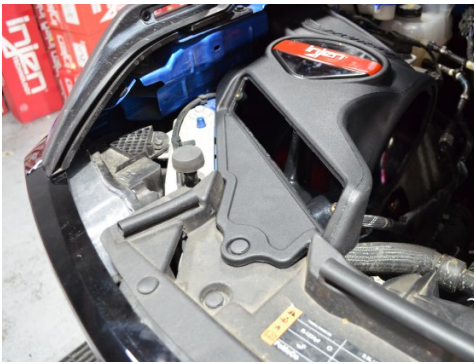
23. Secure the air box to the front shroud with the factory push clip.