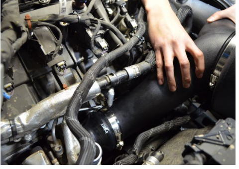
29. Install the passenger side intake tube. First, insert the tube to the hump hose then to the air filter.