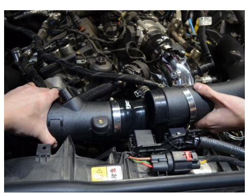
33. Attach the 3.00" hump hose to the passenger side tube then insert the driver side tube into the hump hose.