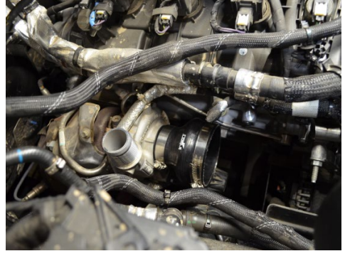
28. Attach the 2.00"-3.00" Stepping hump hose onto the passenger side turbo. Secure the hose with the provided clamps.