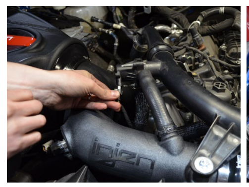
46. Reconnect the diverter valve harness.