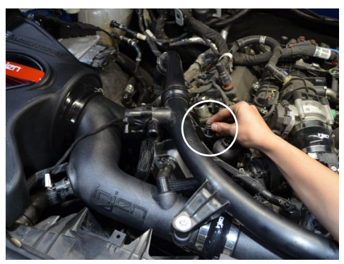
43. Secure the charge pipe to the engine using the OEM bolt.