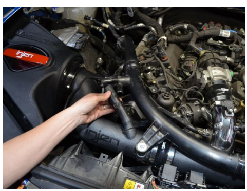
45. Connect the OEM diverter valve hose to the injen intake and diverter valve.