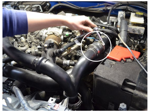
7. Loosen the clamp connecting the driver 8. Disconnect the two crankcase lines on side charge pipe and the Y connecting pipe then remove the charge pipe.