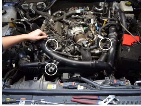
4. Remove the three bolts holding down the charge pipe.