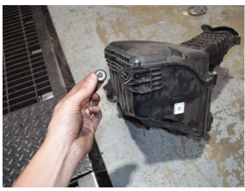
20. Remove the OEM grommet from the air box.