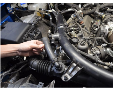
3. Disconnect the hose attached to the diverter valve.