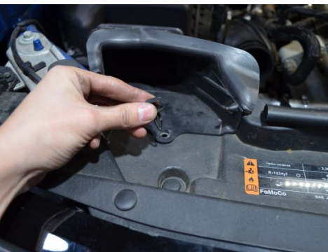
14. Remove the push clip securing the air 15. Disconnect the IAT sensor harness. box inlet to the front shroud.