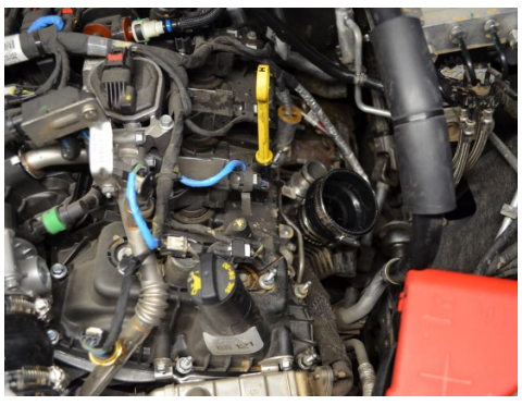
32. Attach the 2.25"-3.00" Stepping hump hose onto the driver side turbo inlet. Secure the hose with the provided clamps.