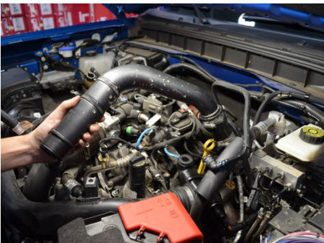
9. Remove the driver side charge pipe.