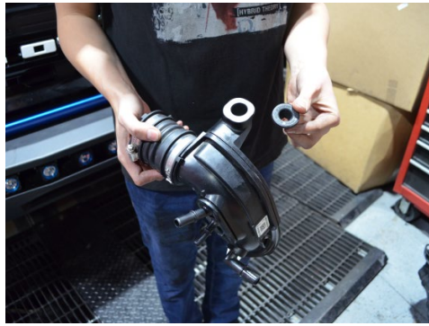
30. Remove the OEM grommet from the driver side intake tube.