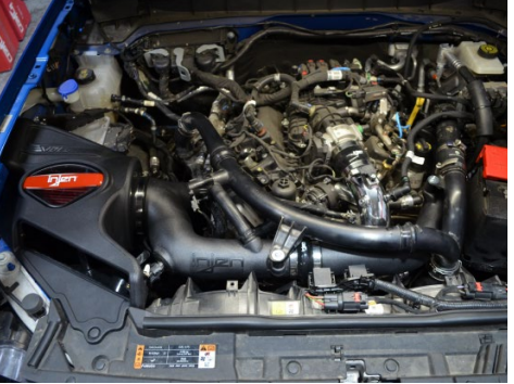
47. Ensure all bolts, hoses, and clamps are properly secured.