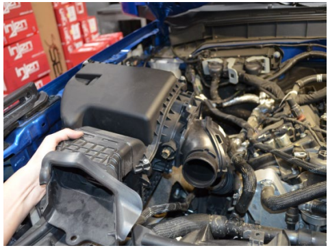
18. Lift the air box out of the engine bay.