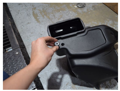
21. Install the OEM grommet on to the injen airbox.