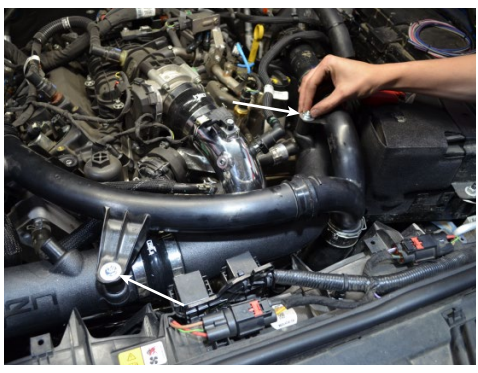
42. Secure the charge pipe to the intake tube using the provided M6 nut and washers.

40. Reconnect both crankcase lines to the 41. Reinstall the charge pipe. crankcase adapter.