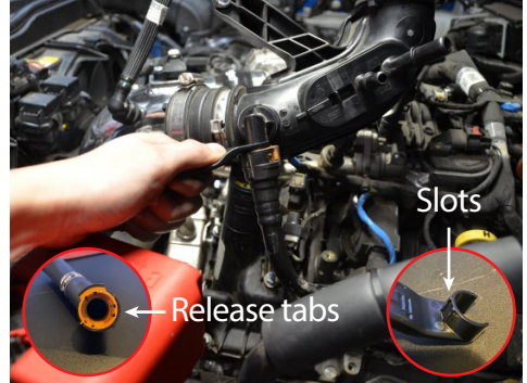
12. Line up the slots on the Injen release tool to the crank case fitting slots and firmly push up. This will unlock the tabs required to release the fitting.