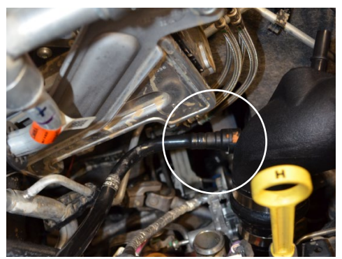
36. Reconncet the driver side crankcase line to the 5/8" machined fitting.