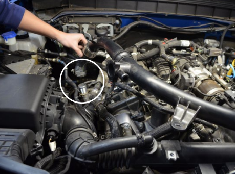
5. Detach the hose connecting the charge 6. Pull back the charge pipe C-Clip and pipe to the passenger side turbo.