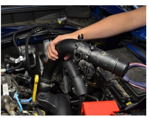
39. Reinstall the driver side charge pipe.