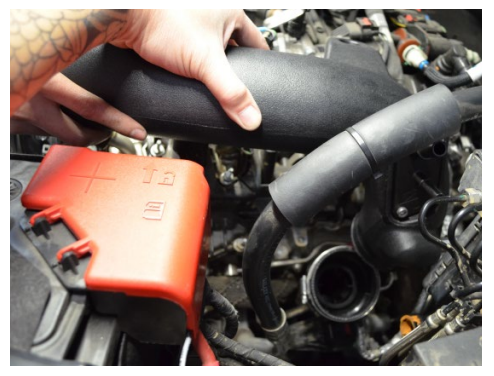
34. Insert the driver side tube into the 2.25"-3.00" Stepping hump hose.