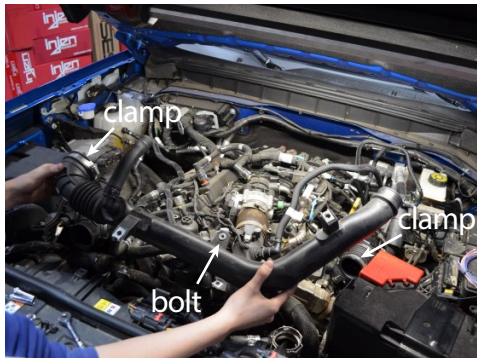
10. Remove the bolt securing the front intake tube to the cold side charge pipe. Then loosen the two clamps and remove the tube.