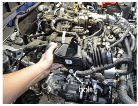
19. Remove the bolt securing the passenger side tube to the engine. Then detach the tube from the turbo.