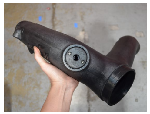
25. Place the temp sensor adapter onto the passenger side tube and secure using the provided M4 bolts.