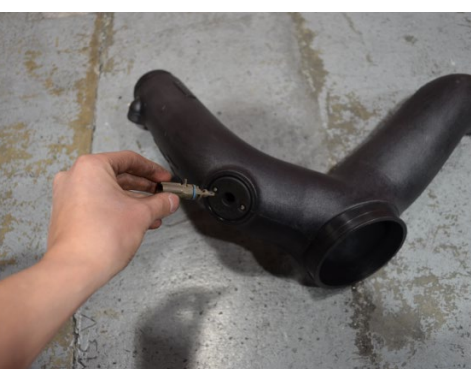
27. Install the IAT sensor to the adapter. Once fully seated, rotate the sensor to secure in place.

26. Twist the IAT sensor to remove the sensor from the air box.