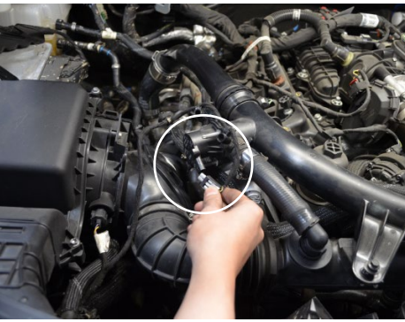
2. Disconnect the diverter valve harness.