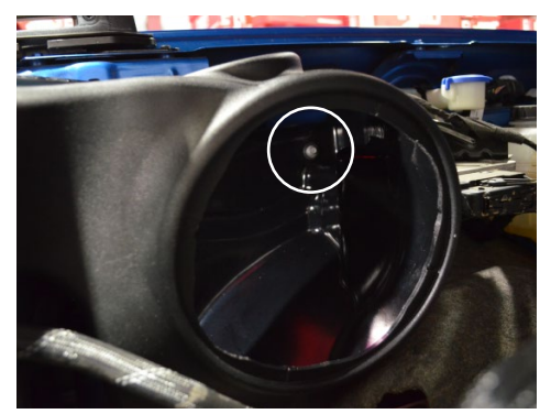
22. Install the airbox into the engine bay and secure the air box to the chassis with the factory bolt.