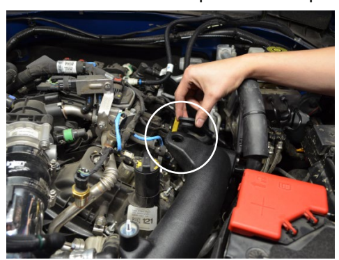
31. Install the OEM grommet onto the injen driver side tube.