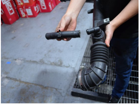
44. Remove the diverter valve hose from the OEM intake tube.