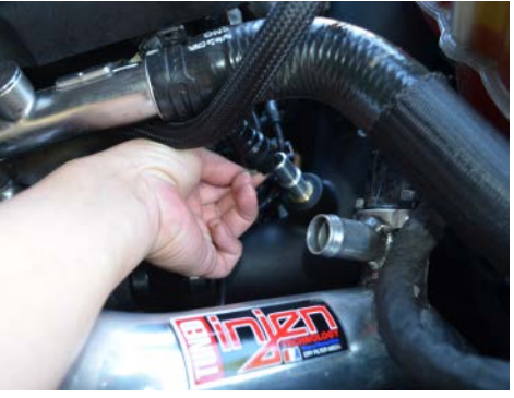
17. Connect the crank case line onto the machined fitting located on the injen tube