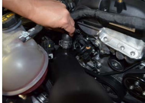
18. Connect the diverter valve return line to the injen intake tube. Then secure it using the OEM tension clamp.