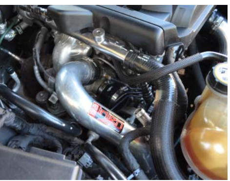
15. Install the 2.3875" - 3" hump hose onto the turbocharger and secure it using the provided clamps.