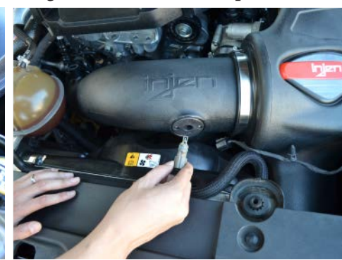
20. Install the IAT sensor into the air temp sensor adapter. Once full seated, twist the sensor to secure it.

CONGRATULATIONS! You have just completed the installation of this intake system. Periodically, check the alignment of the intake, normal wear and tear can cause nuts and bolts to come loose. Note: Check clearance and adjust if needed! Failure to check the alignment and adjust the intake can cause damage that will void the warranty. Injen Technology is not responsible for any damages caused by/ from improper installation.