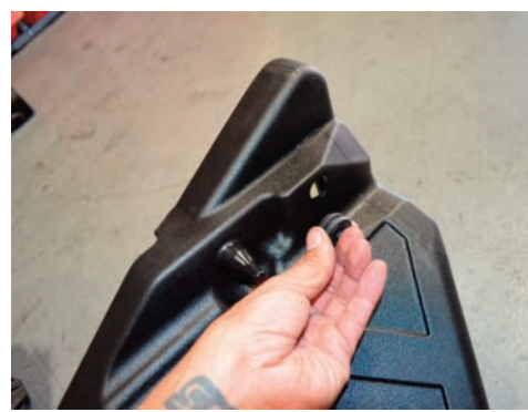
10. Install the smaller grommet and aluminum spacer from figure 8 into the injen air box.