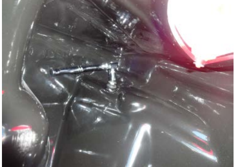
12. Through the filter inlet, secure the injen air box using the factory 10mm bolt.