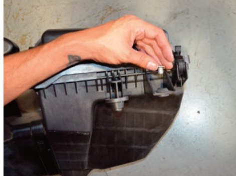
grommets from the air box.