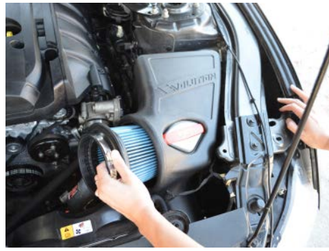
13. Install the filter into the air box. Once seated, Secure the twist lock filter by rotating in either direction 1/4" turn.