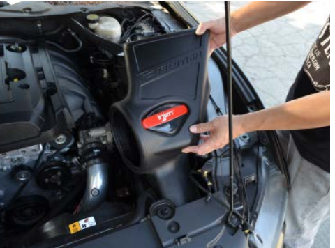
11. Install the injen air box into the engine bay.