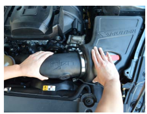
19. Insert the injen intake tube into the air 20. Insert the injen intake tube into the filter. 20. Insert the injen intake tube into the

CONGRATULATIONS! You have just completed the installation of this intake system. Periodically, check the alignment of the intake, normal wear and tear can cause nuts and bolts to come loose. Note: Check clearance and adjust if needed! Failure to check the alignment and adjust the intake can cause damage that will void the warranty. Injen Technology is not responsible for any damages caused by/ from improper installation.