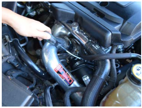
20. Insert the injen intake tube into the hump hose and secure the tube using the provided clamps.