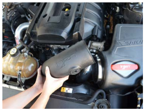
16. Lower the injen intake tube into the engine bay.