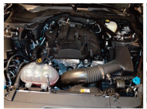
1. Stock intake system.