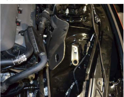
9. Install the larger grommet from figure 8 into its original hole location.