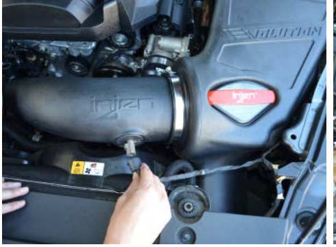
22. Reconnect the IAT sensor harness .