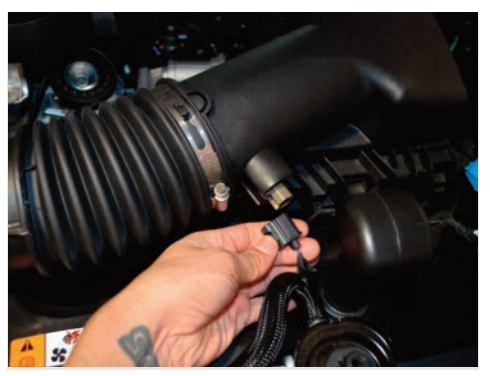
3. Disconnect the IAT sensor harnesss. Then twist the IAT sensor to remove it from the air box.