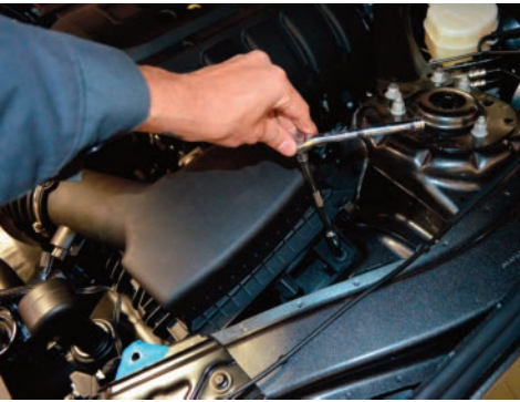
2. Remove the 10mm bolt from the side of the air box.