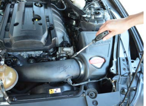
23. Secure all clamps on the intake system.