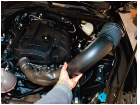
7. Loosen the clamp connecting the intake 8. Remove the aluminum spacer and two tube to the turbocharger. Then remove the intake tube.