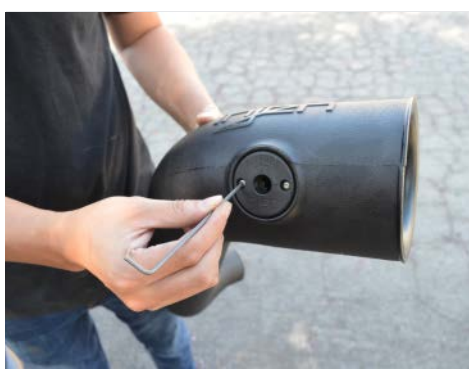
14. Place the air temp sensor adapter on the injen intake tube. Secure using the provided M4 bolts.