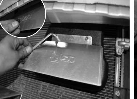
Install the rain guard. Secure using provided M6 socket cap screws and tighten. Once secure, cover the socket cap screw using provided vinyl cap. This will prevent any contact with screws and front bumper support. Failure to do so will result in vibration noise.

WARNING: FAILURE TO FOLLOW INSTALLATION INSTRUCTIONS AND NOT USING THE PROVIDED HARD-WARE MAY DAMAGE THE INTAKE SYS-TEM, ENGINE AND COMPONENTS!!! *Do not attempt to install the intake system while the engine is hot. Severe burn could result from touching hot