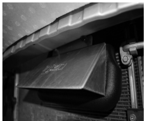
Rain guard installation is now complete. Re-install the the scoop assembly and secure the intake system. Note: Check clearance and adjust if needed! Failure to check the alignment and adjust the intake can cause damage that will void the warranty. Injen Technology is not responsible for any damages caused by/from improper installation.