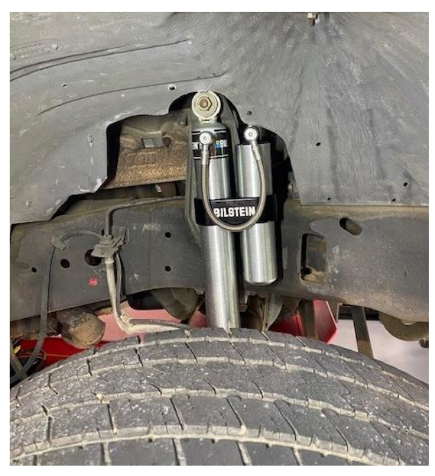
Figure 2. front passenger side