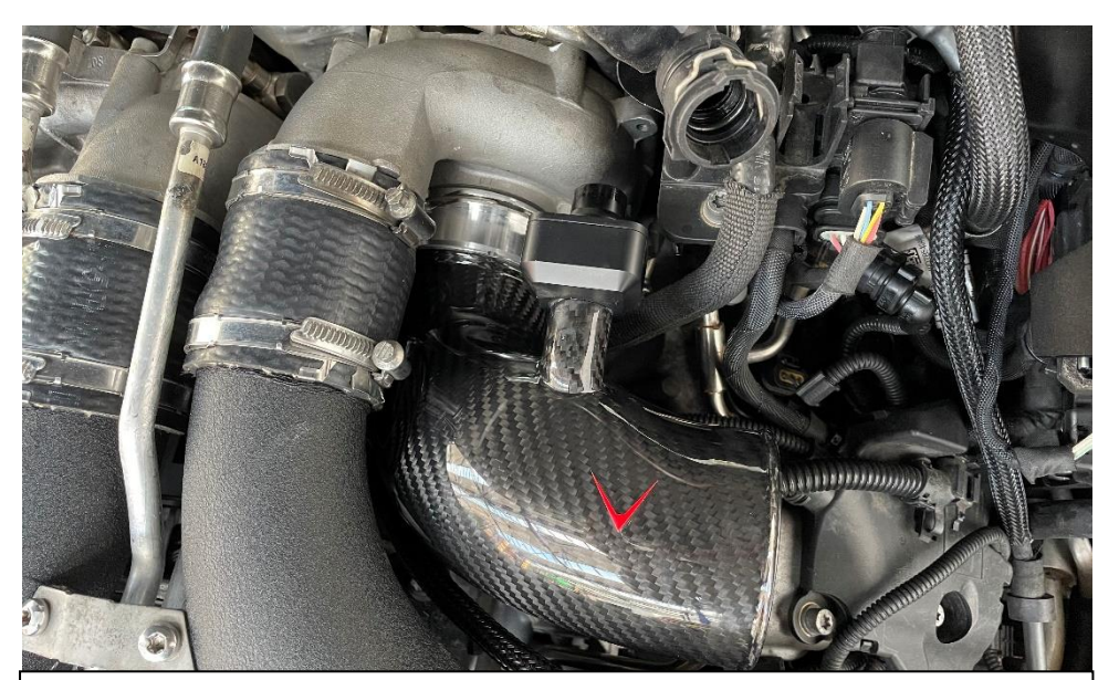
7. Push the inlets into place and secure with the clip. Connect the breather tube back into place and secure.

5. Remove the spring clip and the internal gasket from the inlets. Note the orientation of the gasket. It needs to go back into the carbon inlets in the same orientation.