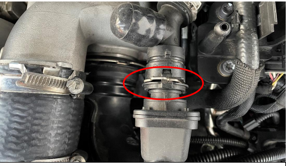
2. Pull up the spring clips holding the breather connectors to the inlets.