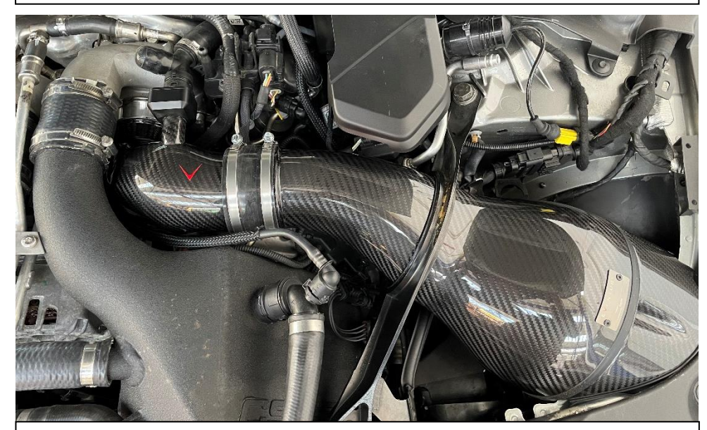
8. Now the intake can be installed back into place.

6. Insert the spring clip onto the machines flange with the top of the clip positioned over the raised section. Also insert the O-ring inside the flange as shown. The tapered face of the gasket should face the turbo.