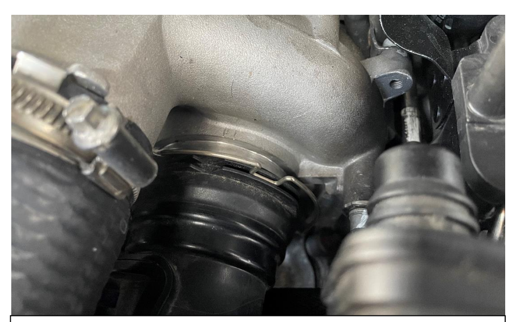
3. The inlets can be removed by pulling up the spring clips around the turbo flanges.