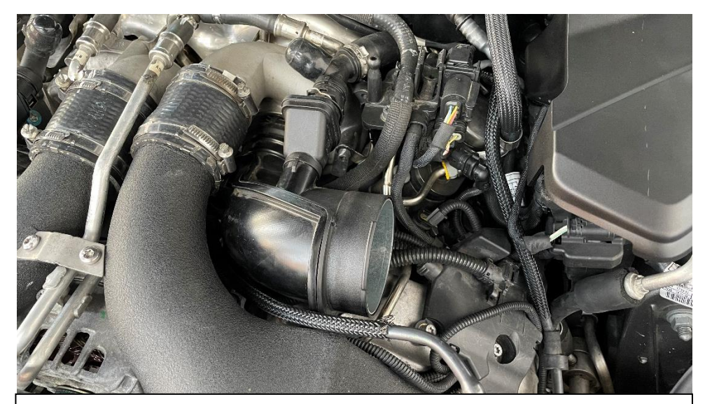
1. Start by removing the intake from the inlets.