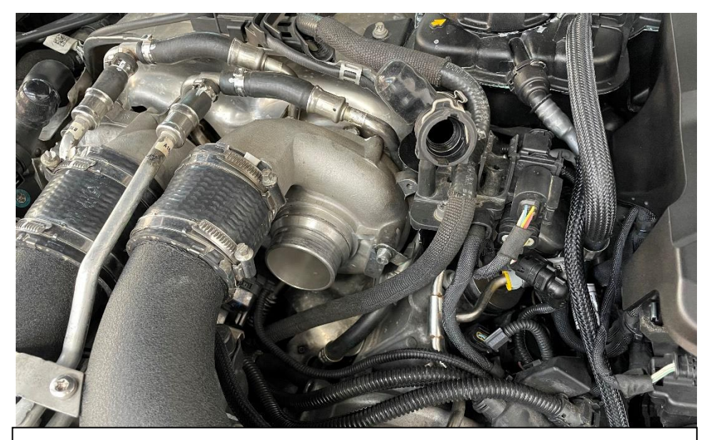
4. Remove the inlets from the turbos.