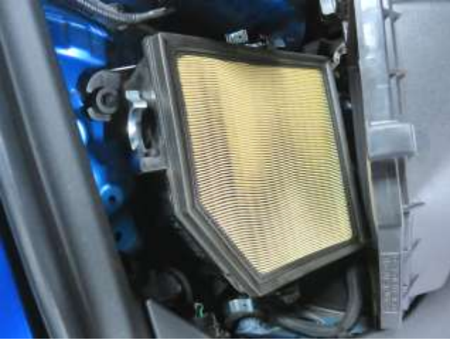
g. Open the air box and remove the stock panel filter.