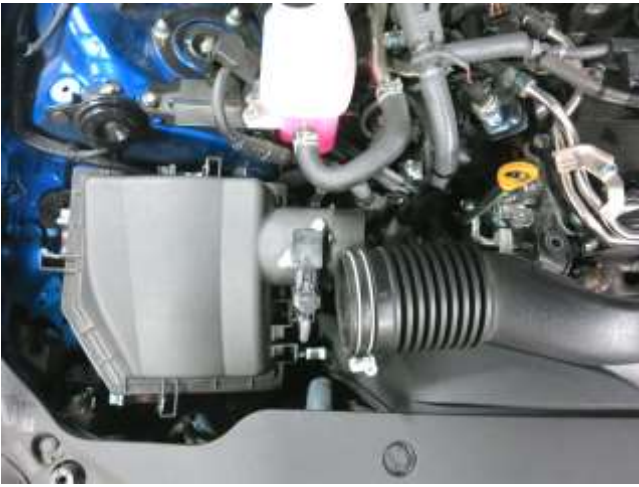
e. Use a 10mm socket and ratchet, or a Phillips head screwdriver, to loosen the hose clamp holding the intake tube to the air box. Then, pull the tube off of the air box.