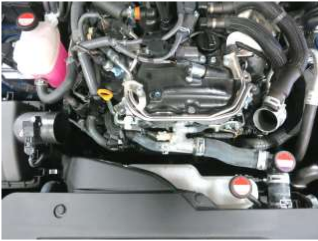
f. Loosen the hose clamp holding the intake tube to the turbo inlet pipe. Then, completely remove the intake tube. AEM recommends that you keep your stock intake components.