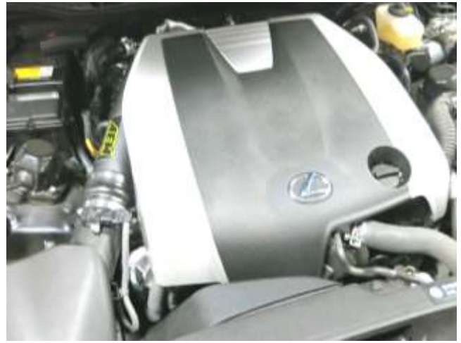
f. Reinstall the engine cover. Check for clearance between the tube, engine, and engine cover prior to fastening all hose clamps.