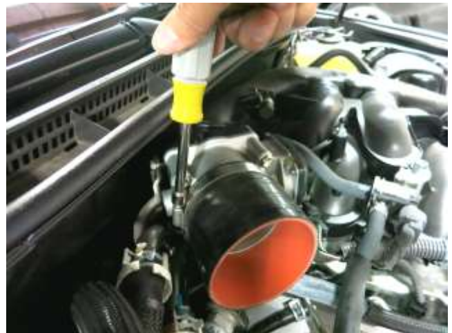
b. Install the supplied coupler(5-325 for IS350; 5-323 for IS250) and fasten the hose clamp(9452) to the throttle.