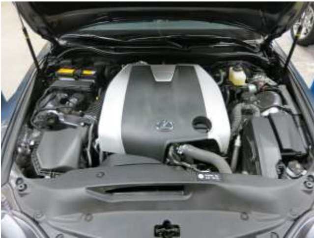
g. Factory air induction system.