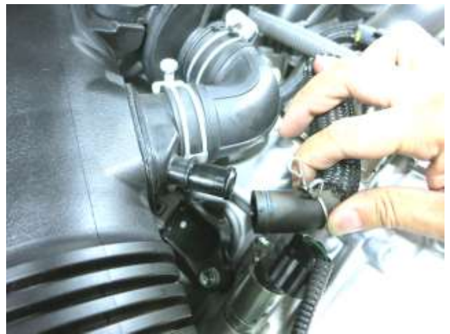
b. Disconnect the breather hose from the stock intake tube.