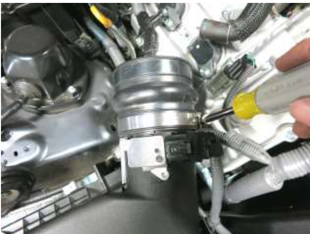
c. Install the supplied hump hose(5-586) and hose clamp (9452) onto the factory airbox lid as shown.