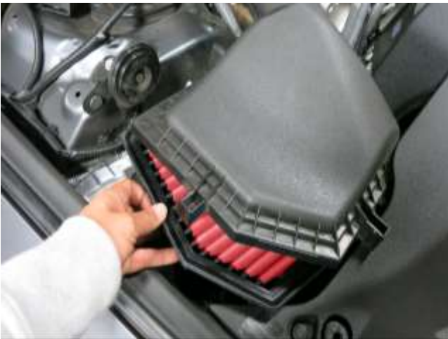
a. Install the AEM panel Filter(28-20452).

a. When installing the intake system, do not completely tighten the hose clamps or mounting hardware until instructed to do so.