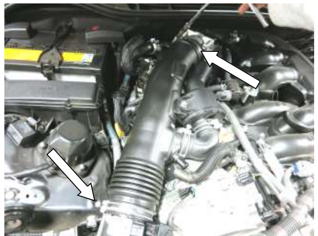
d. Loosen the stock hose clamps on both ends of the intake tube using a 10mm socket and remove the tube.