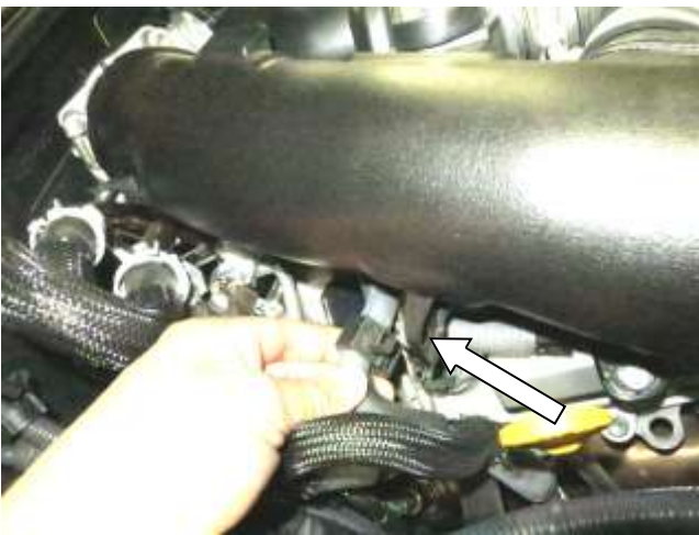
c. Detach the vacuum line harness from the intake tube as shown.