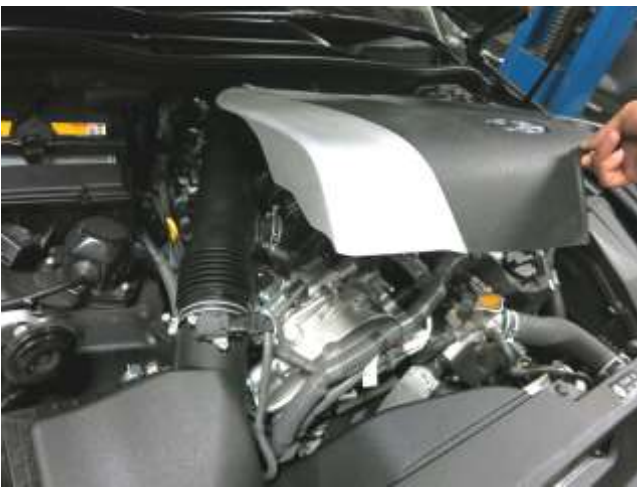
a. Lift up the engine cover and set aside.