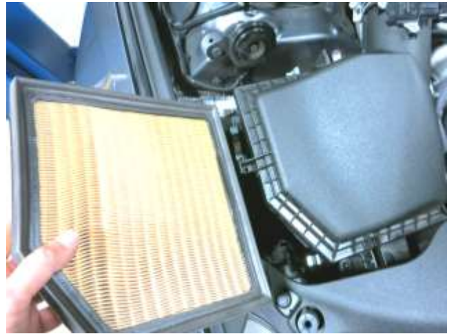
f. Remove the stock panel filter.