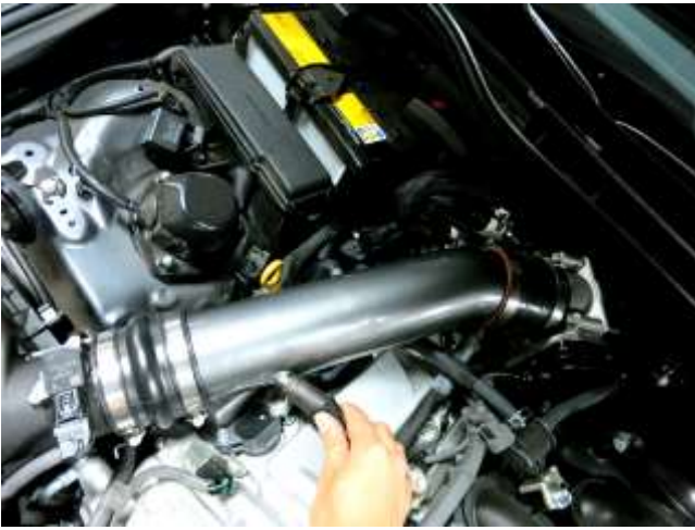
e. Reconnect the breather hose to the AEM tube.