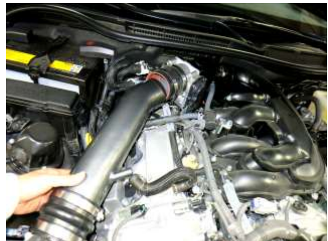
d. Install the hose clamps onto each previously installed hose coupler. Position the tube(2-1540C) as shown.