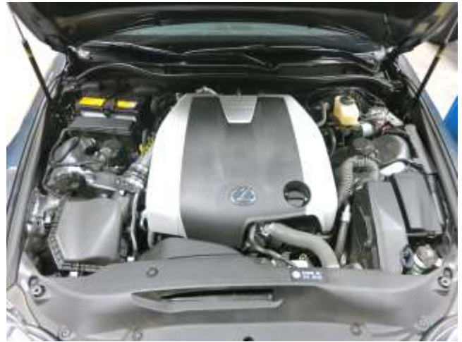
h. Finished installation of AEM Intake System.