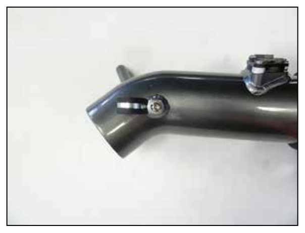
18. Install the provided loop clamp onto the AEM<sup>®</sup> intake tube and secure with the provided hardware.