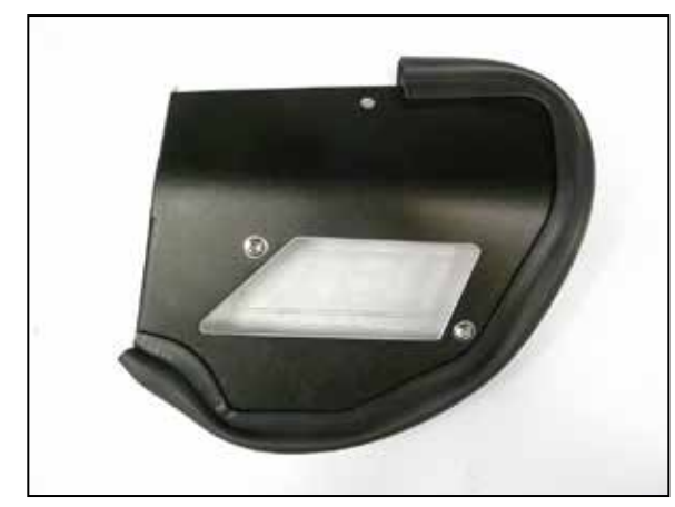
10. Install the AEM<sup>®</sup> window and 18.5" edge trim onto the heat shield lid as shown.