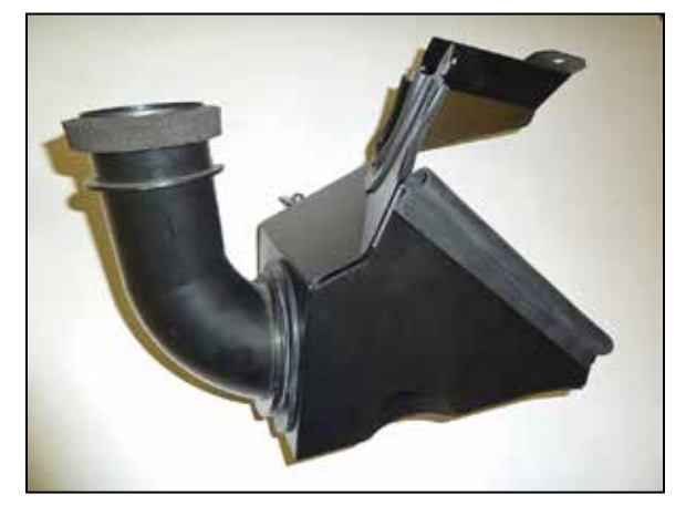
15. Install the fresh air intake duct into the hole of the heat shield as shown.