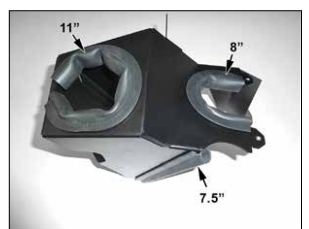
12. Install the 7.5", 8" and 11" edge trim onto the heat shield as shown.