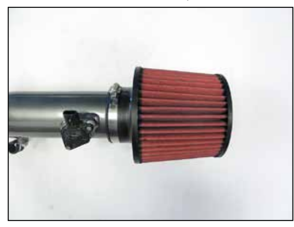
19. Install the AEM<sup>®</sup> air filter onto the intake tube and secure with the provided hardware.