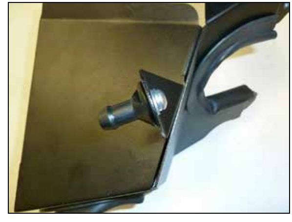
13. Install the mounting stud onto the heat shield using the provided hardware as shown.