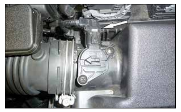
2. Disconnect the mass air sensor electrical connection.

3. Disconnect the EVAP solenoid and bracket from the factory intake tube.