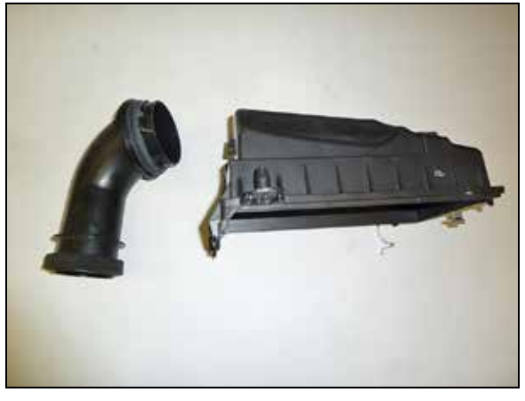
14. Remove the factory fresh air intake duct from the factory air filter housing.