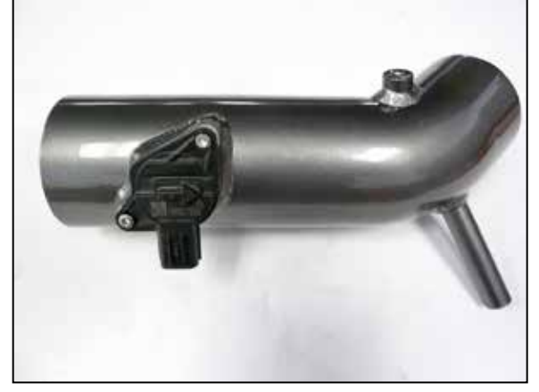
17. Remove the mass air sensor from the factory air filter housing and then install it into the AEM<sup>®</sup> intake tube and secure with the hardware provided.