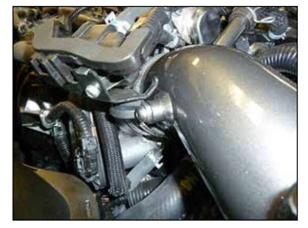
23. Insert the EVAP solenoid bracket into the adel clamp attached to the intake tube.