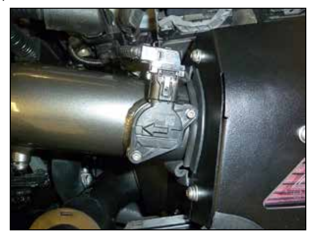
25. Reconnect the mass air electrical connection.