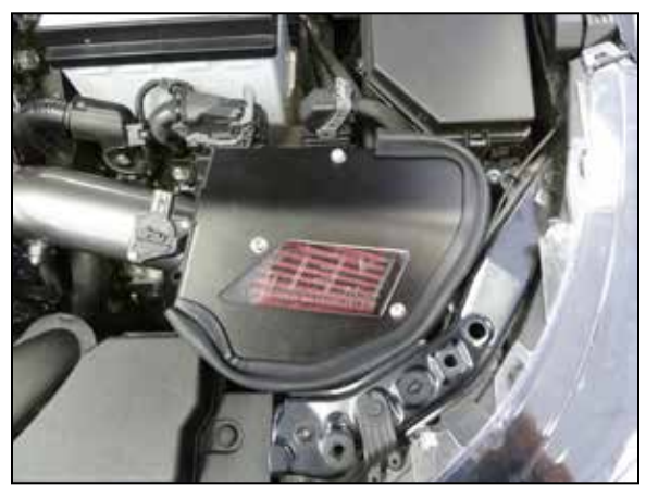
24. Install the heat shield lid and secure with the provided hardware.