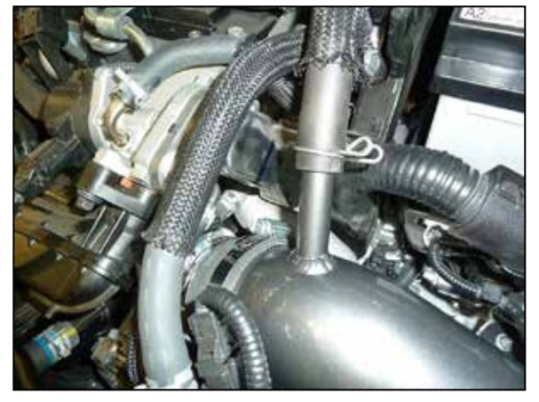
22. Connect the PCV hose to the AEM<sup>®</sup> intake tube and secure with the factory spring clamp.