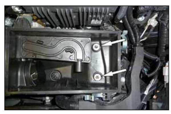
7. Remove the two bolts that secure the lower air filter housing and then remove the housing from the vehicle.