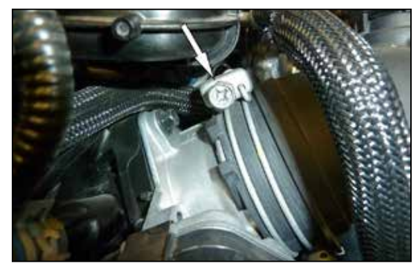
4. Loosen the hose clamp that secures the intake tube to the throttle body.

3. Disconnect the EVAP solenoid and bracket from the factory intake tube.