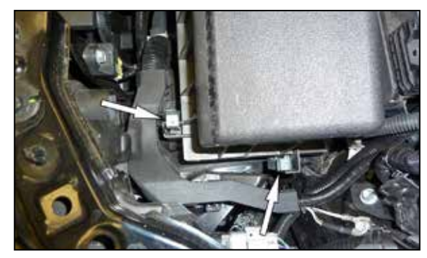
6. Release the two clips that secure the upper air filter housing and then remove the upper housing from the vehicle.