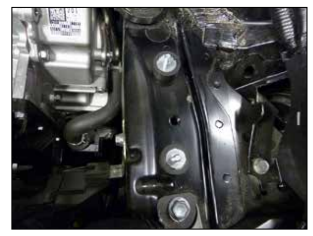
8. Install the two provided rubber mounted studs into the frame at the factory air filter housing mounting locations.