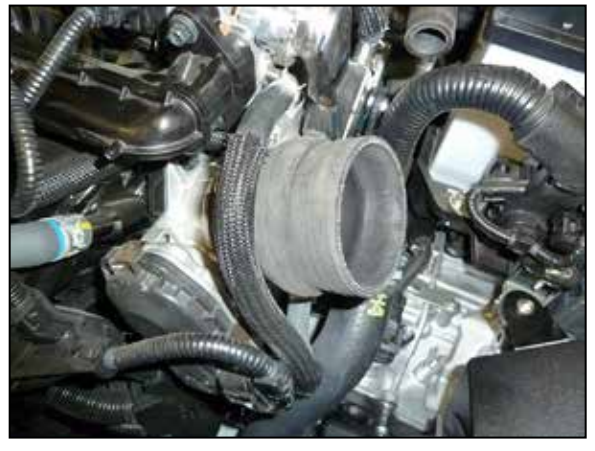
20. Install the provided coupler (084036) onto the throttle body and secure with the provided hose clamp.