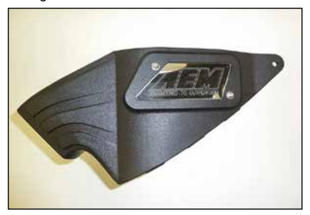
8. Install the AEM ^{\circ} badge into the filter housing and secure with the provided hardware.