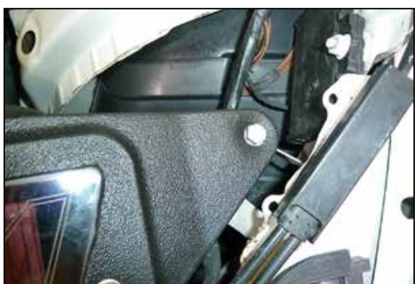
12. Install the remaining spacer into the air filter housing and then secure the housing with the provided hardware.