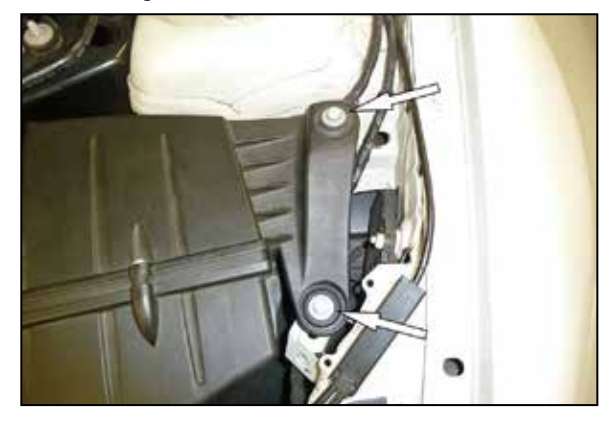
4. Remove the two bolts shown that secure the factory air filter housing to the inner fender.