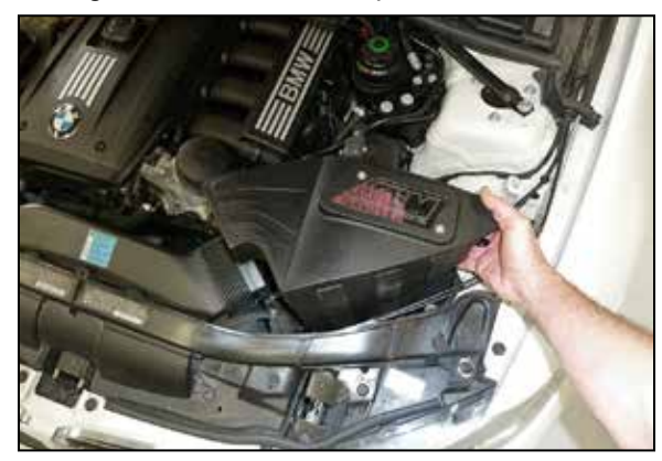
11. Install the AEM® filter housing assembly into the vehicle so that it sits on the factory bushings and the fresh air duct installs onto the AEM® air filter housing.