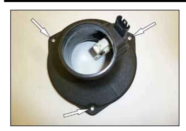
7. Install the provided spacers into the AEM<sup>®</sup> housing as shown.