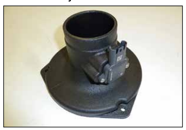
6. Remove the mass air sensor from the factory housing and install it into the AEM® housing and secure with the provided hardware.

NOTE: AEM recommends that customers do not discard factory air intake.