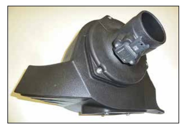
10. Install the AEM® mass air housing onto the filter housing and secure with the provided hardware.