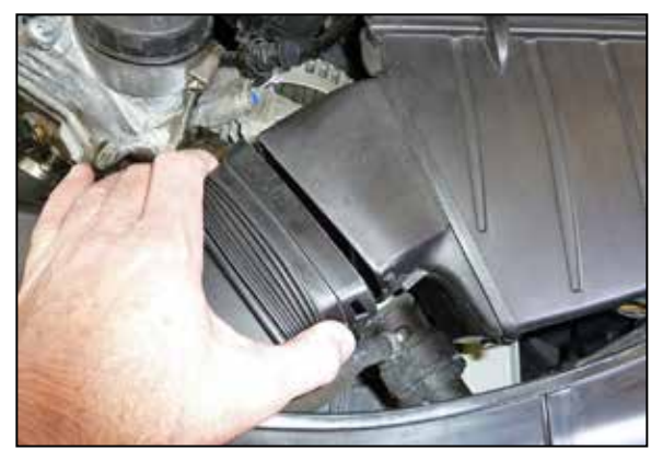
3. Disconnect the fresh air intake duct from the air filter housing.