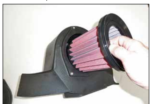
9. Install the AEM® air filter into the filter housing.