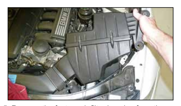
5. Remove the factory air filter housing from the

NOTE: AEM recommends that customers do not discard factory air intake.