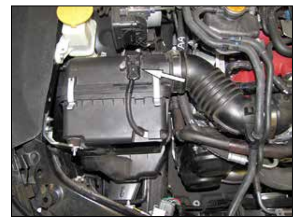
3. Disconnect the mass air sensor electrical connection and unclip the wiring harness from the air filter housing.