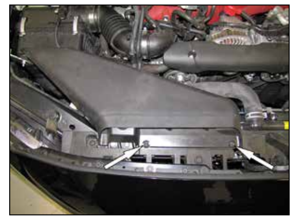
2. Remove the two plastic retaining clips that secure the fresh air duct and then remove the fresh air duct from the vehicle.

NOTE: Disconnecting the negative battery cable erases pre-programmed electronic memories. Write down all memory settings before disconnecting the negative battery cable. Some radios will require an anti-theft code to be entered after the battery is reconnected. The anti-theft code is typically supplied with your owner's manual. In the event your vehicles anti-theft code cannot be recovered, contact an authorized dealership to obtain your vehicles anti-theft code.