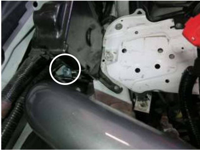
g. Align tube for best fit before tightening the nut/bolt combination.