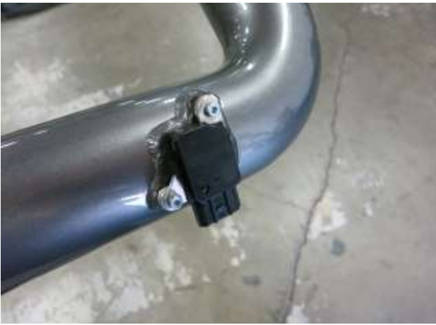
e. Install the MAF sensor onto the AEM intake tube and secure with the supplied M4 socket head bolts.