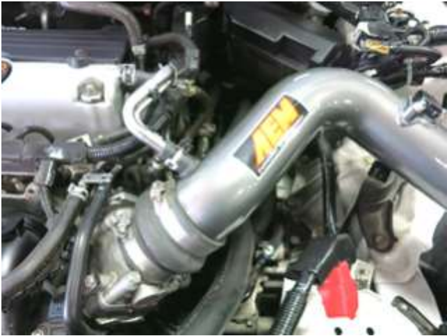
h. Install the supplied PCV nipple to the intake tube then install the PCV line into it. Secure the PCV line with spring clamp from step 2 d.