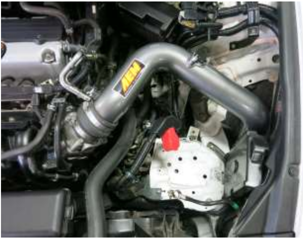
f. Install the intake tube by inserting the bracket to the nut/bolt combo from step 3d first, then into to the coupler. DO NOT TIGHTEN THE CLAMP AT THIS TIME.