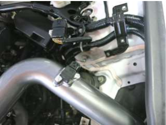
i. Connect the MAF sensor wire harness.