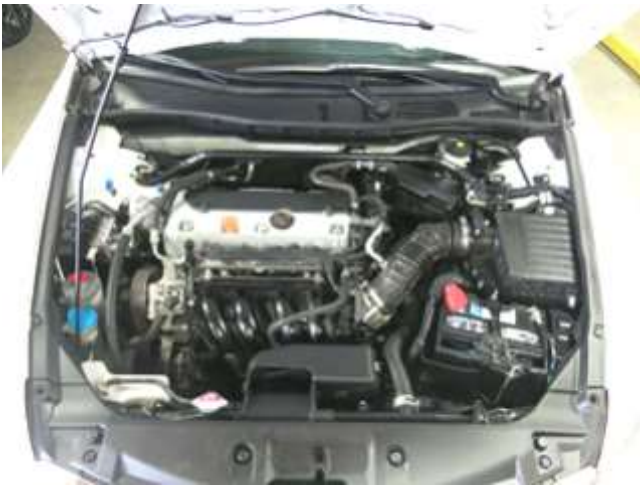
STOCK INTAKE INSTALLED