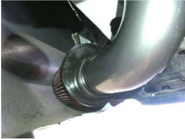
j. Install the AEM Dryflow filter as shown. NOTE: IT MAYBE NECESSARY TO ROTATE THE FILTER UNTIL IT CLEARS ALL NEARBY COMPONENTS.