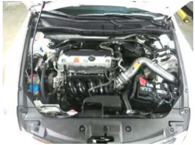
AEM INTAKE INSTALLED