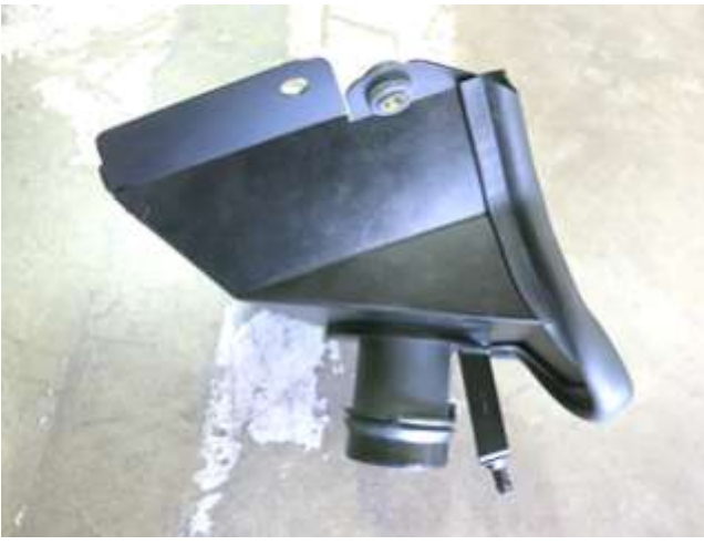
c. Assemble the driver side intake system as shown. Take care to use the correct MAF housing bracket (part number "7-363" will be stamped on).