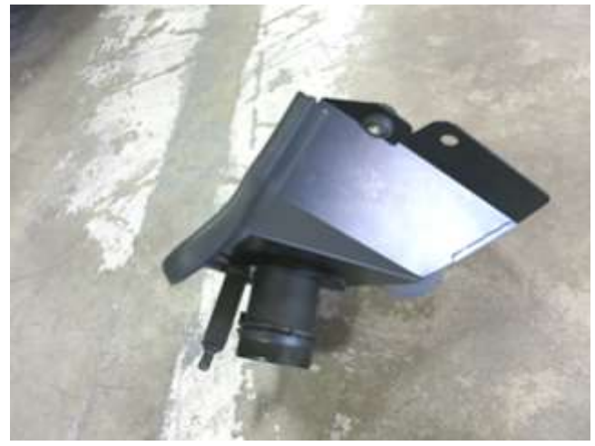
d. Assemble the passenger side intake system as shown. Take care to use the correct MAF housing bracket (part number "7-362" will be stamped on).