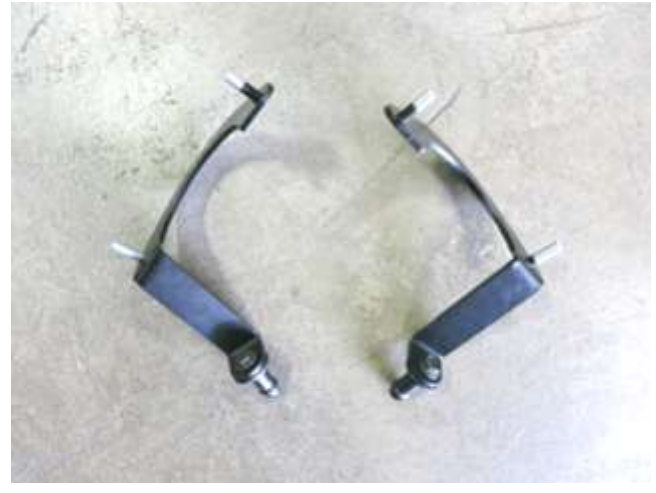
b. Assemble both MAF housing brackets as shown.