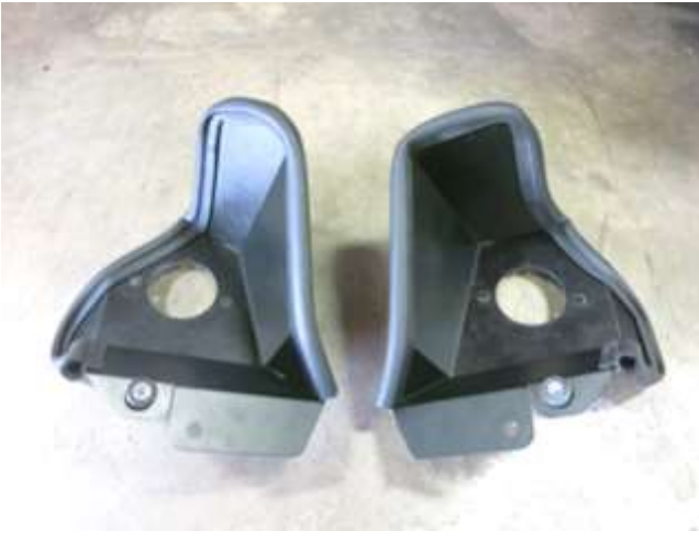
a. Apply edge trim to both heat shields as shown. Cut the single 80" length of trim as necessary. Also install the grommets and sleeves removed in step 2h.