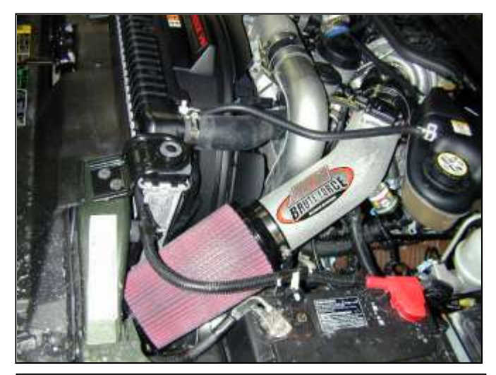
k. Plug in the MAF sensor.

NOTE: If the air filter status meter wire is in tension proceed to Step 4.