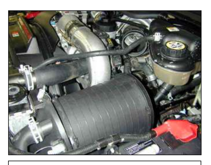
g. Remove the rear section of the intake system.