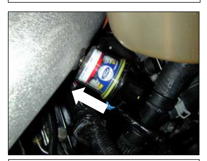
j. Install the air filter status meter into the rubber grommet on the rear of the pipe.

NOTE: If the air filter status meter wire is in tension proceed to Step 4.