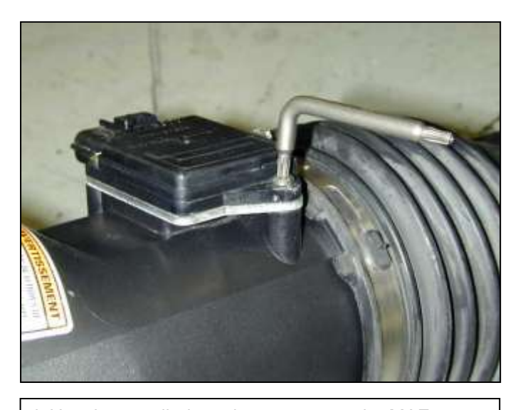
i. Use the supplied torx key to remove the MAF sensor. Save screws for later use.