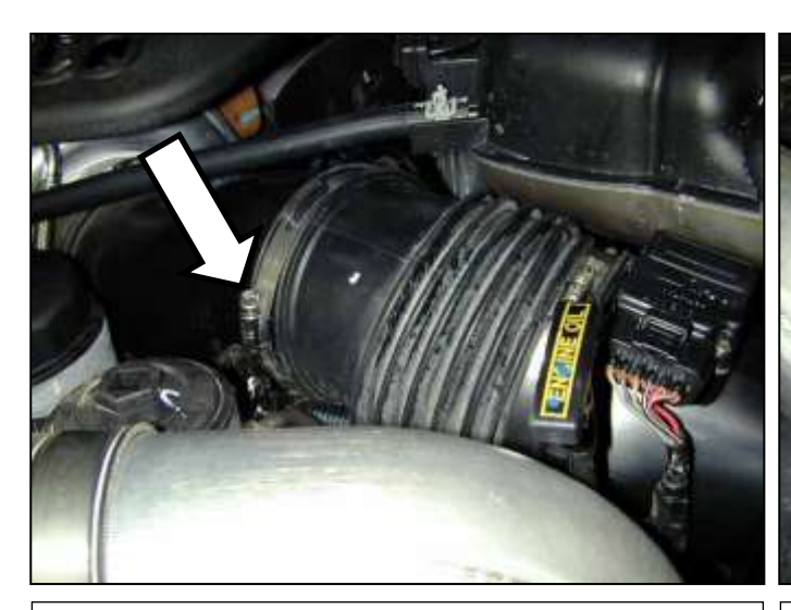
c. Loosen the hose clamp on the turbo inlet pipe.