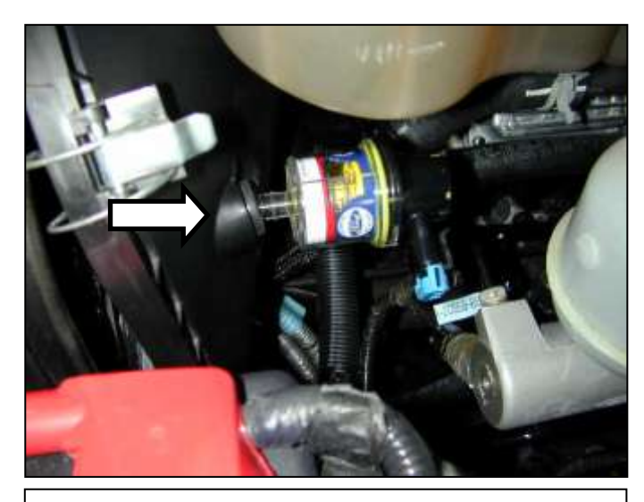
f. Pull the air filter status meter from the grommet.