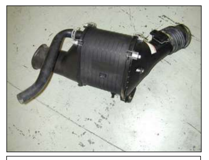
h. Remove the remaining stock air box system.