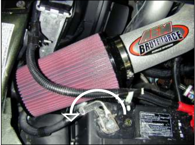
g. Install the air filter onto the end of the pipe. If the negative lead touches the air filter, rotate the terminal, as shown.