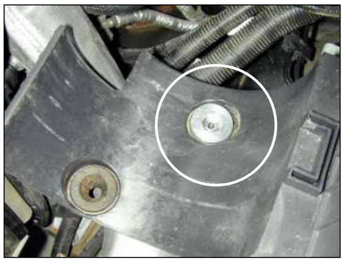
c. Place the aluminum stand in the plastic member as shown.