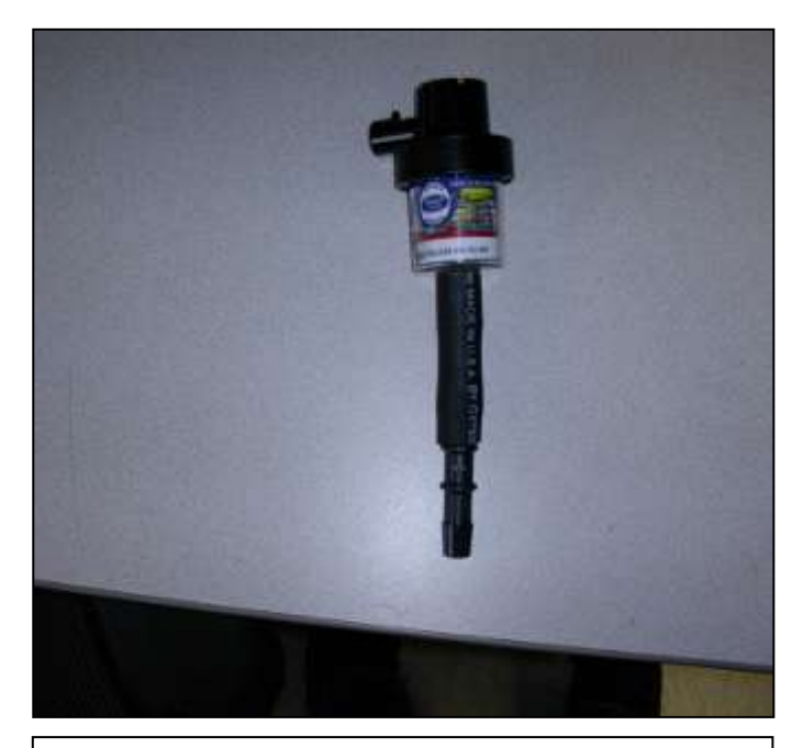
a. If the air filter status meter wire is in tension, add the supplied hose and plastic connector as shown.