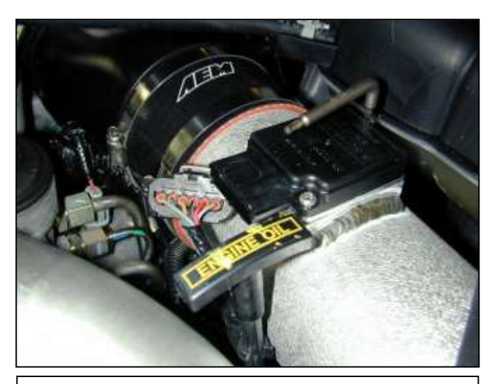
h. Vehicle with a MAF Sensor: Install the sensor into the intake pipe using the two factory bolts removed during step 2i. Proceed to step 3k.).