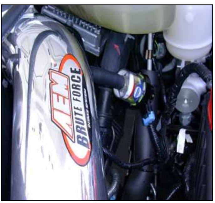
b. Install the air filter status meter assembly as shown.