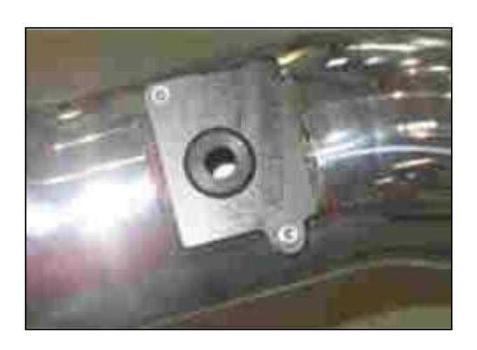
i. On vehicles equipped with an IAT sensor, install the provided adapter plate onto the intake pipe using the two supplied bots. Install the supplied grommet into the plate. Install the IAT sensor into the grommet on the adapter plate and proceed to step 3j.).