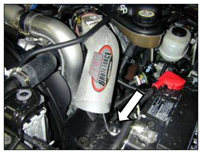
f. Place the inlet pipe in engine bay as shown. Confirm that the mounting tab is under the fender washer.