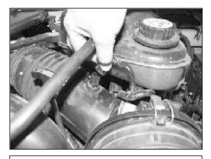
e. On vehicles equipped with IAT, unplug the IAT sensor and remove from the housing.