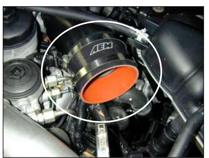
b. Install the supplied coupler as shown.

a. When installing the intake system, do not completely tighten the hose clamps or mounting hardware until instructed to do so.