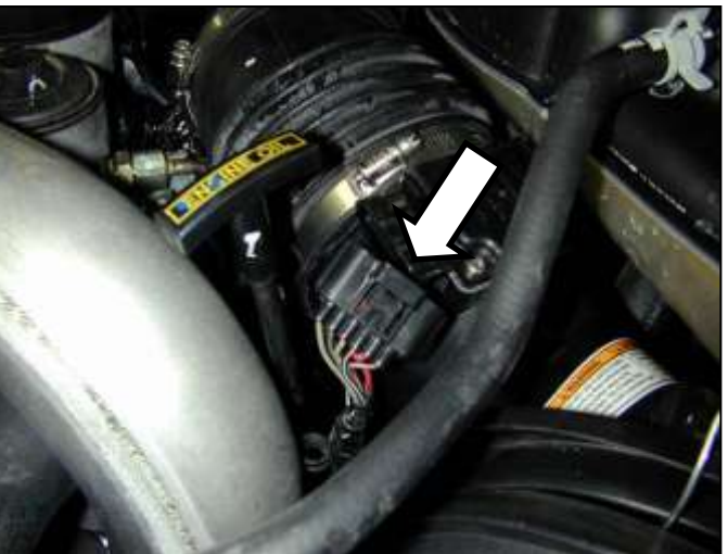
d. Vehicle equipped with MAF sensor. Unplug the mass air flow (MAF) sensor.