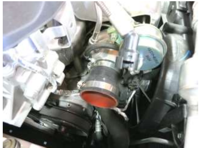
d. Install the hose with clamps onto the turbo compressor inlet as shown.