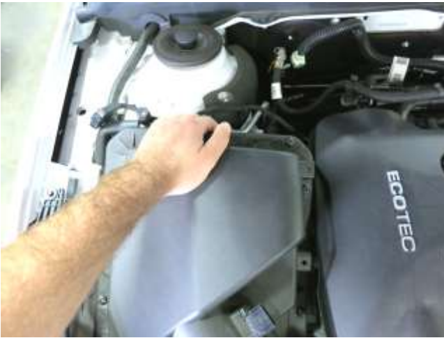
e. Pull up and remove the air box and tube assembly from the engine compartment. The tube will slip off of the turbo after lifting up on air box.