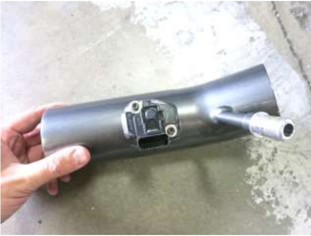
a. Install the MAF sensor into the AEM intake tube with the supplied M4 bolts.