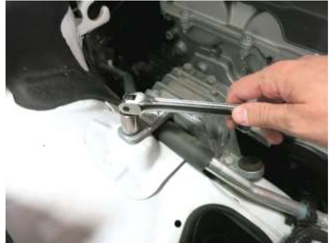
h. Loosen and remove the 15mm bolt on the engine mount. The bolt will be reinstalled in step 3f.