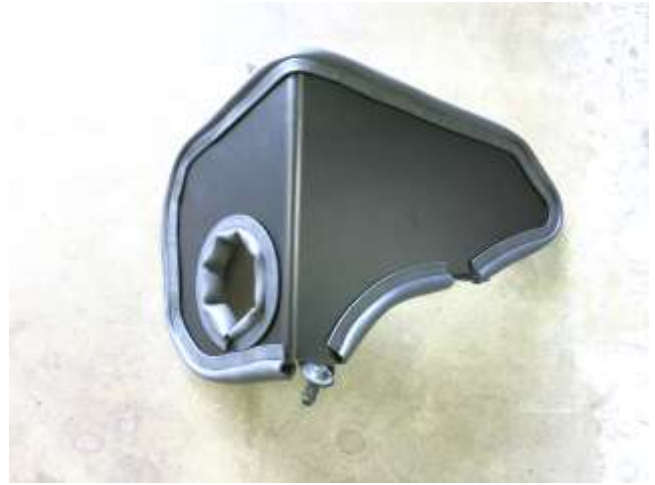
b. Install the edge trims and mounting hardware on the AEM heat shield as shown. Please refer to the illustration on pg. 2 for part details if needed. Edge trim will need to be cut to approx. lengths of 39", 12", and 6".