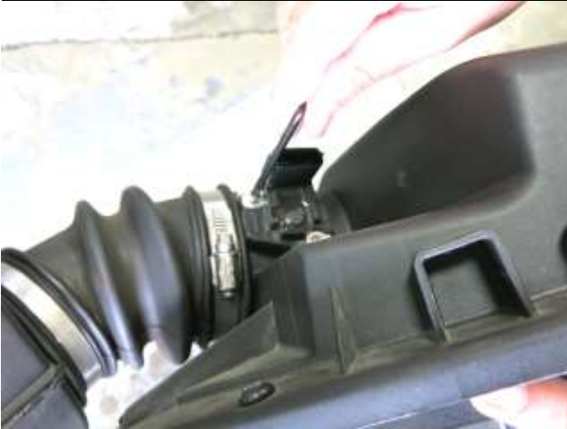
g. Loosen the MAF sensor screws and remove the sensor from the air box. The sensor will be reused in step 3a.