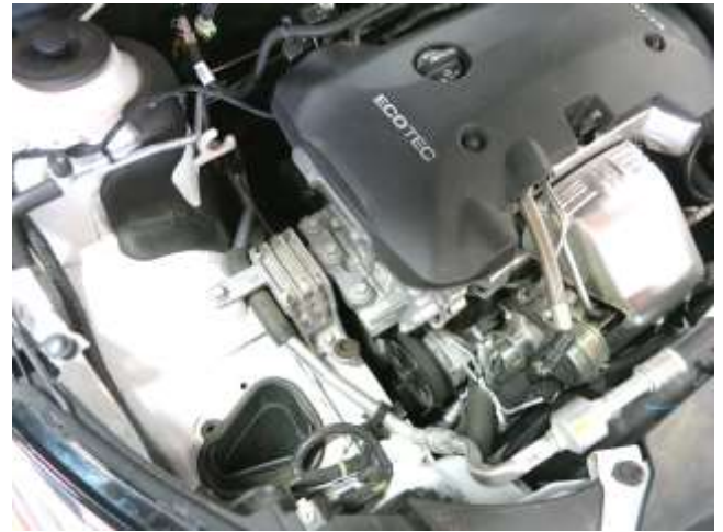
f. Engine compartment without factory air box assembly.