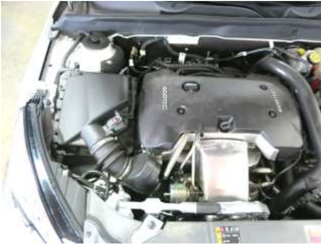
STOCK INTAKE INSTALLED