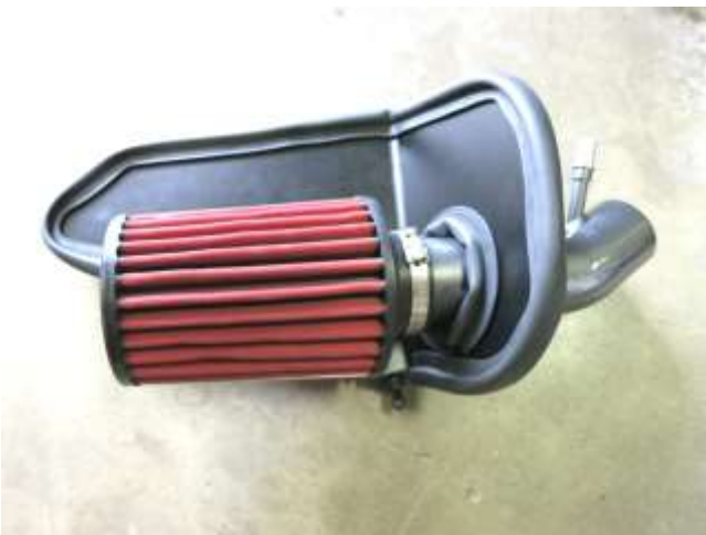
c. Insert the AEM intake tube into the heat shield opening and install the air filter with hose clamp as shown. Torque filter hose clamp to 30 in-lb at this time.