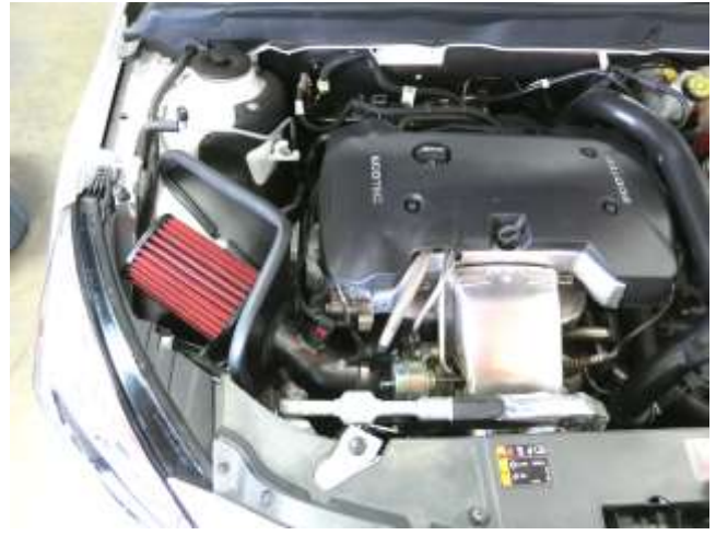
AEM INTAKE INSTALLED