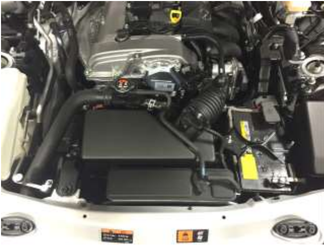
STOCK INTAKE INSTALLED