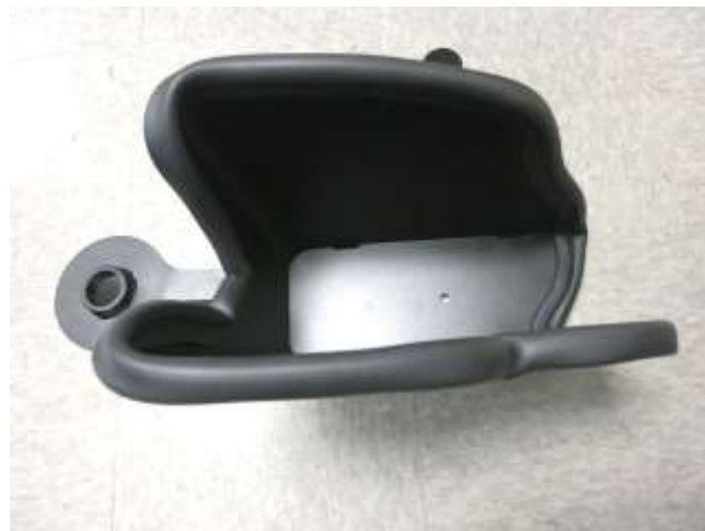
b. Install the supplied rubber edge trim onto the AEM heat shield assembly as shown.