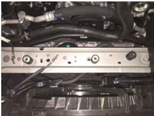
a. Install the supplied rubber isolator mounts into the engine compartment as shown.