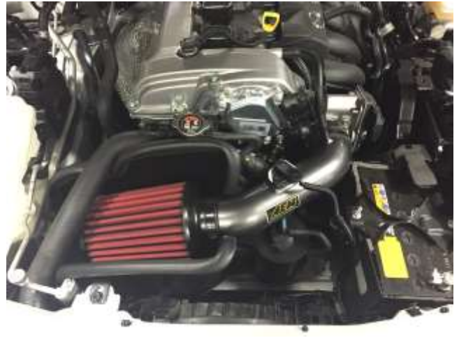
AEM INTAKE INSTALLED