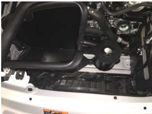
c. Install the complete heat shield assembly into the engine compartment as shown and secure with supplied hardware.