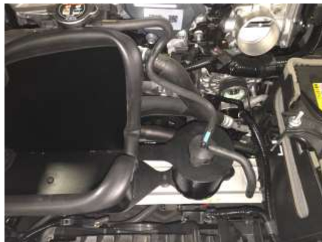
d. Transfer the coolant from the factory tank into the AEM reservoir and seal with factory cap.