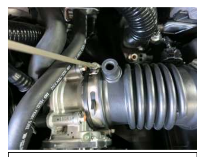
d. Loosen hose clamp securing coupler to throttle body.