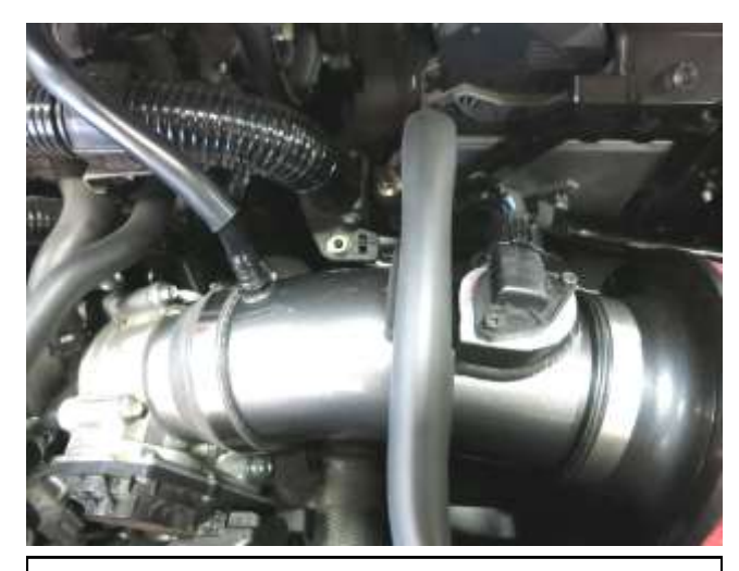
I. Install the breather hose into the coupler and reconnect the MAF sensor wiring.