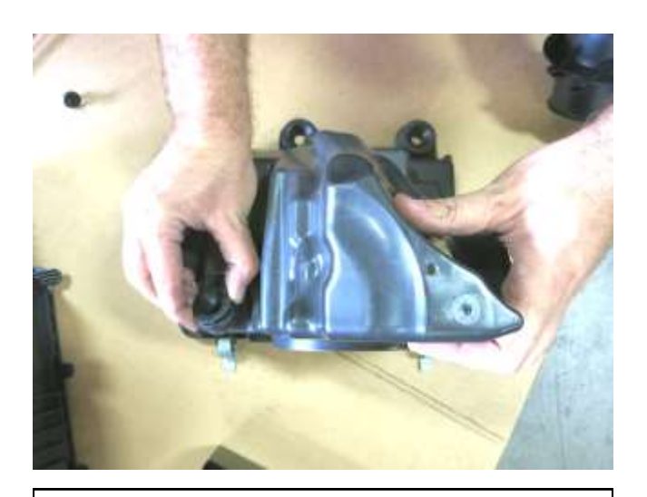
d. Remove the three rubber grommets from the factory air box and insert them into the AEM heat shield.