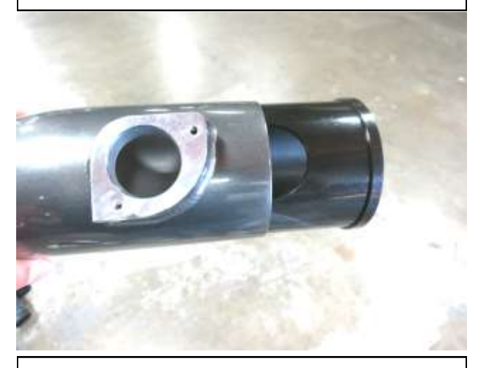
g. Install the supplied MAF sleeve into the AEM intake tube and line up the opening to the MAF adaptor.