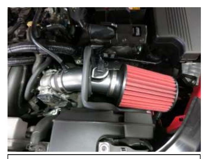
m. Check for clearance around the filter, heat shield and intake tube then tighten all hose clamps. Reinstall the engine cover.