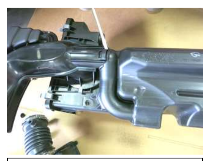
b. Unclip the resonator chamber from the cold air scoop while rotating the cold air scoop gently.