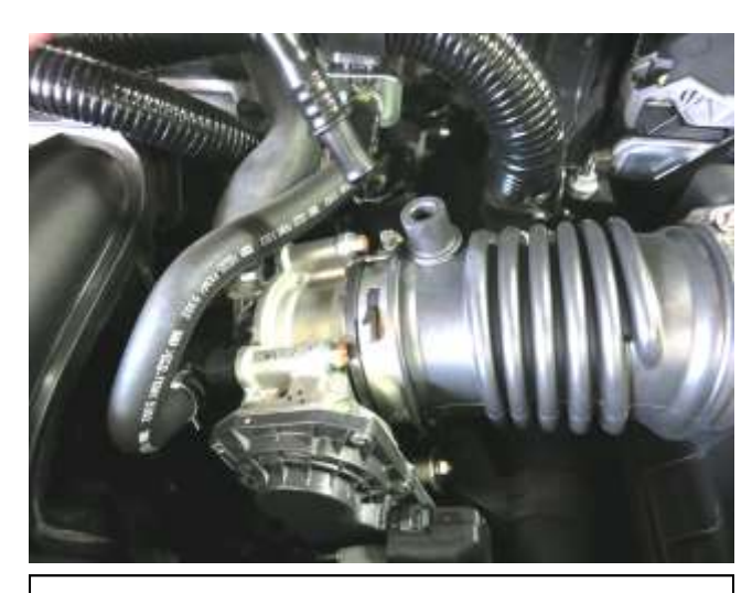
b. Remove breather hose from factory coupler.