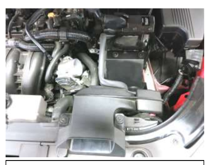
f. Install the AEM heat shield assembly into the engine compart by lining up the three rubber grommets and secure with factory M6 bolts.