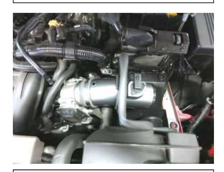
j. Install the AEM intake tube through the heat shield to the throttle body coupler as shown.