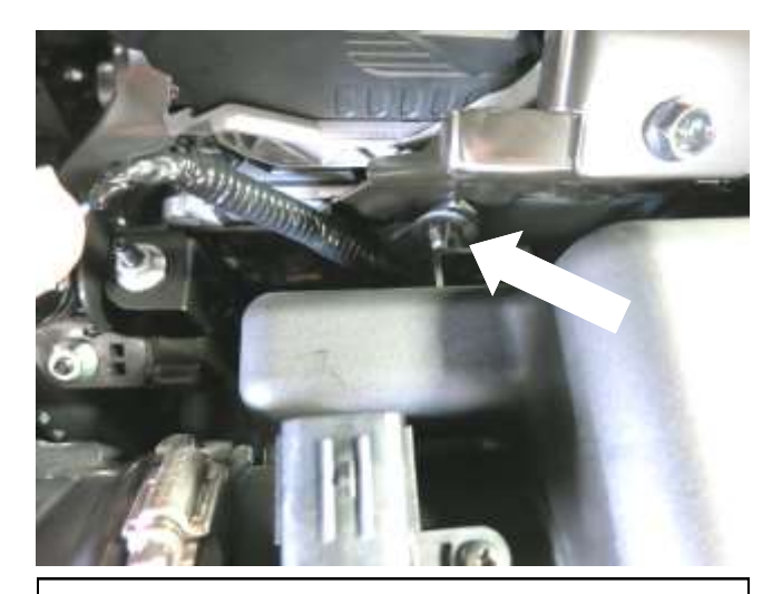
e. Use needle nose pliers to unclip wire harness from air box.