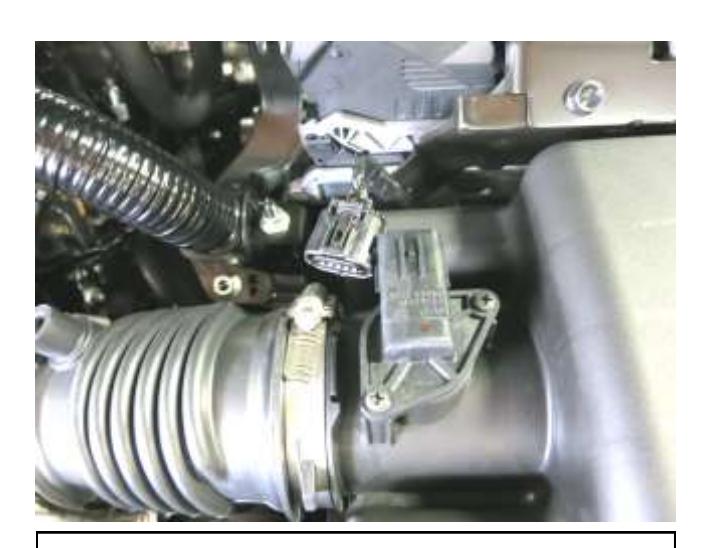
c. Unplug MAF sensor harness.