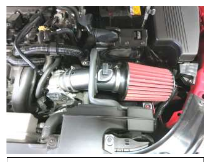
k. Install the AEM filter onto the intake tube.