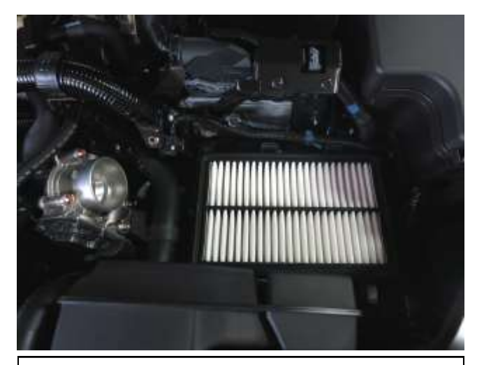
g. Remove the air box lid along with the air inlet hose.