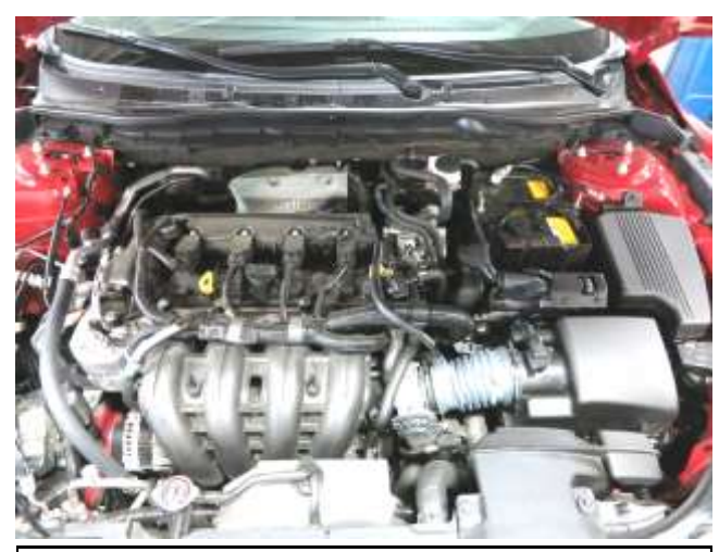
a. Remove engine cover by gently pulling it up and away from the top of the engine.