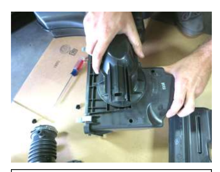
c. Separate the cold air scoop from the lower air box.