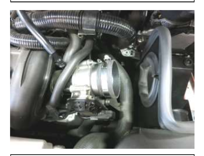
i. Install provided coupler with hose clamps onto throttle body. Do not tighten hose clamps at this point.