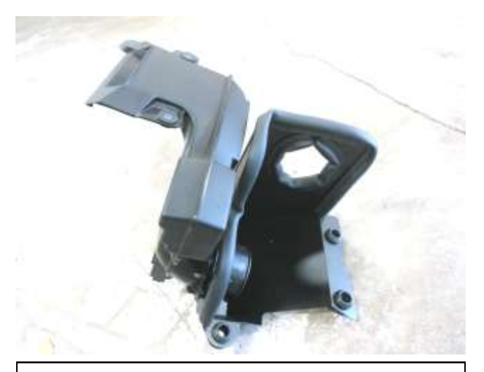
e. Install edge trim around the intake tube pass through hole and around the AEM heat shield then install the air scoop into the AEM heat shield assembly.