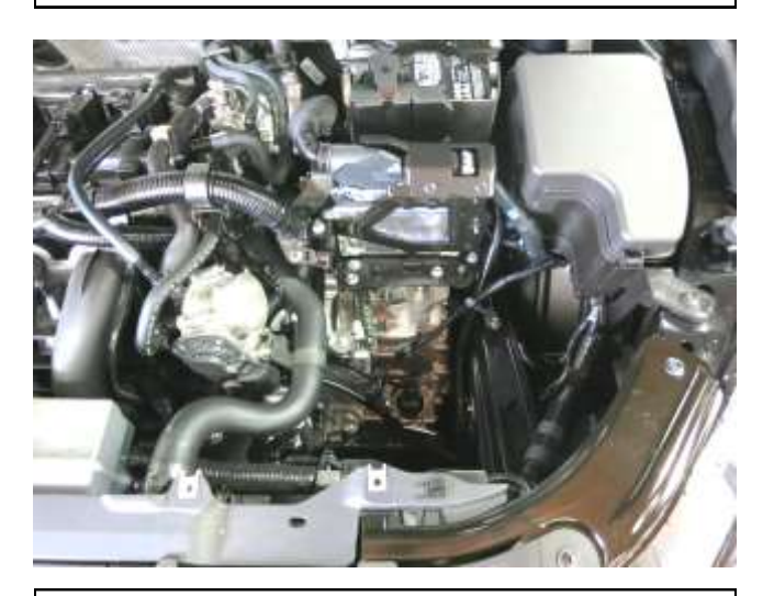
i. Gently remove factory lower air box and factory cold air inlet scoop.