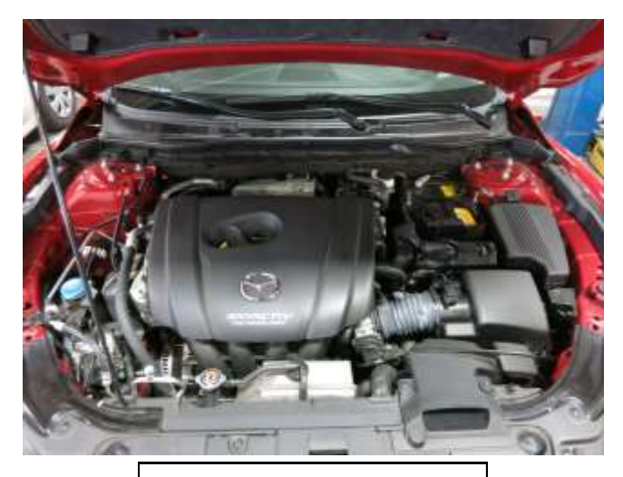
o. Factory air induction system.