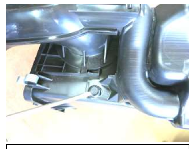
a. Unclip the two plastic retainers securing the cold air inlet scoop to the factory air box.

a. When installing the intake system, do not completely tighten the hose clamps or mounting hardware until instructed to do so.