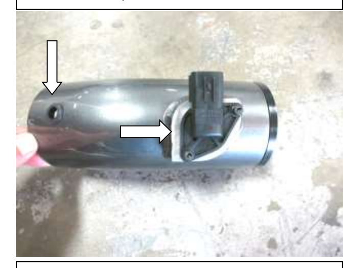
h. Install MAF sensor and rubber grommet into the AEM intake tube as shown.