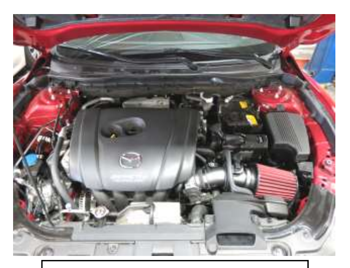
p. Finished installation of AEM Intake System.