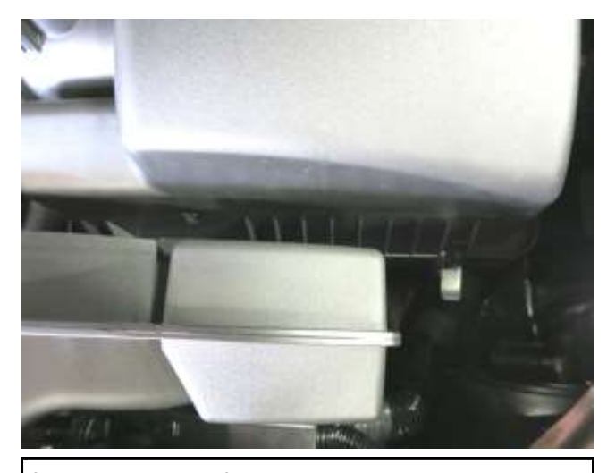
f. Unclip air box lid from lower air box.