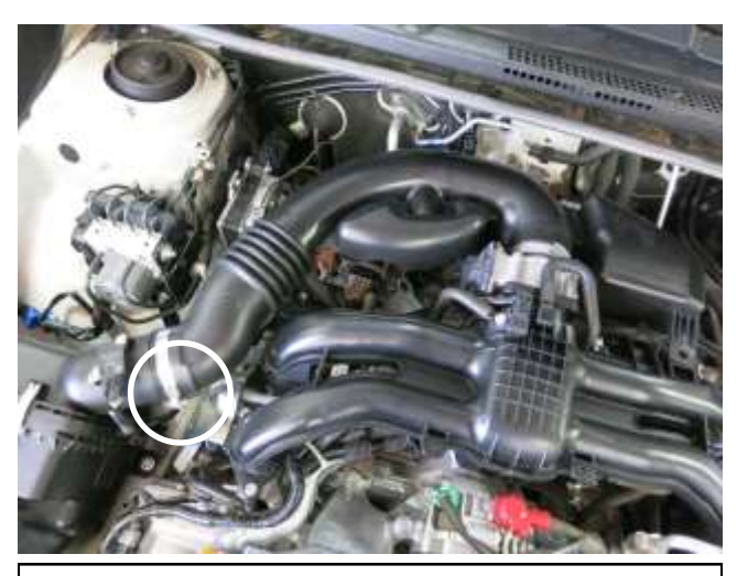
d. Loosen the hose clamp at the air box and remove the stock intake tube from the vehicle.