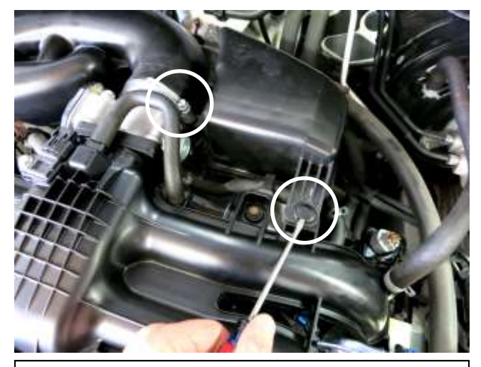
b. Remove the clip securing the stock intake resonator to the engine. Then loosen the hose clamp at the throttle body.