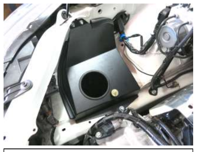
b. Install the AEM heat shield in the vehicle