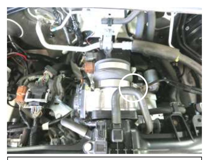
c. Install the provided hose and hose clamps onto the throttle body. Tighten the hose clamp closest to the throttle body now.