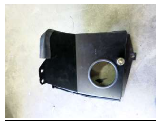
a. Install the edge trim and rubber mount onto the AEM heat shield according to the parts diagram on pg. 2.

a. When installing the intake system, do not completely tighten the hose clamps or mounting hardware until instructed to do so.