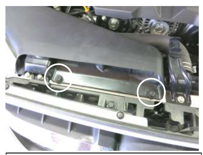
a. Remove the scoop and the two clips from the vehicle.The scoop will not be reinstalled but do not discard.