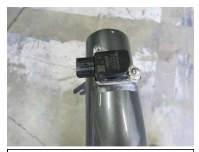
d. Install the MAF sensor that was removed in step 2h. and secure with the provided Allen head bolts.