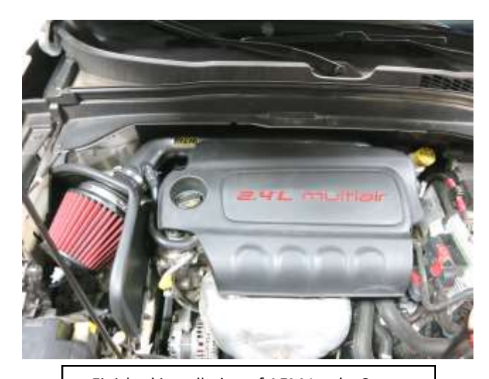
p. Finished installation of AEM Intake System.