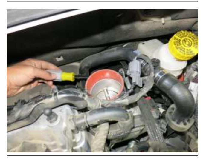
g. Install the supplied coupler(5-272) and fasten using the hose clamp(9444) as shown. Loosely slide the other hose(9444) clamp over the other end of the coupler.