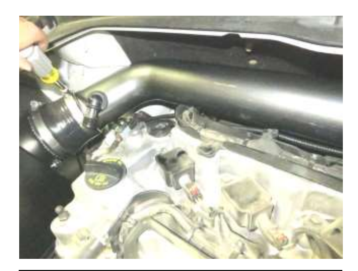
i. Install the AEM tube into position, lining the inlet end up to the air horn and outlet end to the throttle coupler.