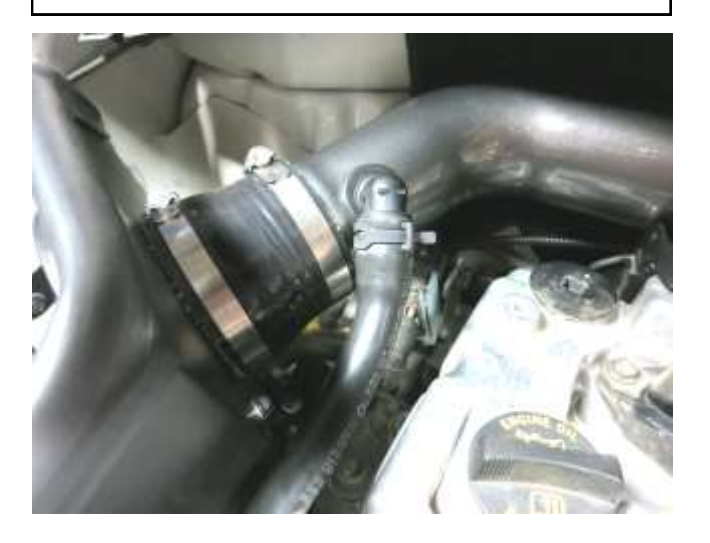
k. Connect the breather hose to the plastic elbow and fasten using the provided spring clamp(08557).