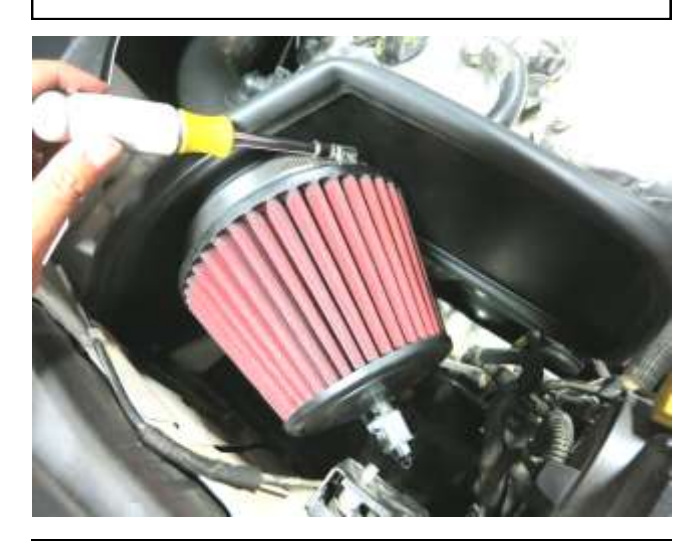
I. Install the air filter and hose clamp(94104) as shown. Connect the IAT harness(21781) to the sensor and check for clearance.