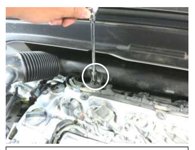
b. Remove the indicated mounting bolt securing the stock intake tube to the engine.