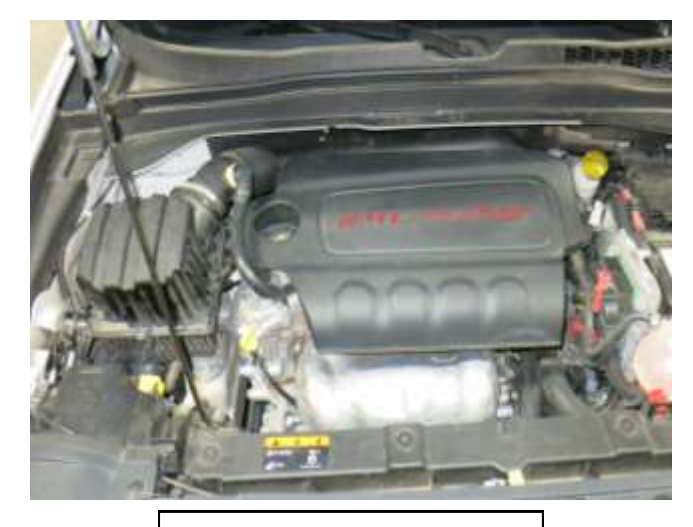
o. Factory air induction system.