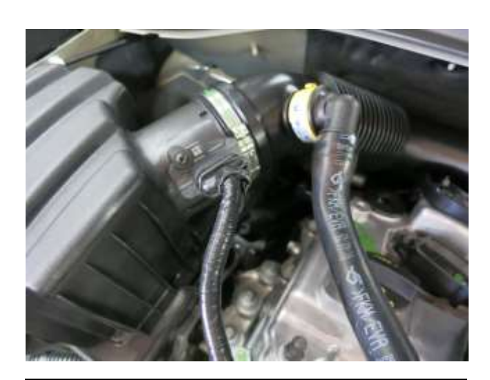
c. Carefully detach the crankcase breather and humidity sensor electrical connector if so equipped from the intake tube.