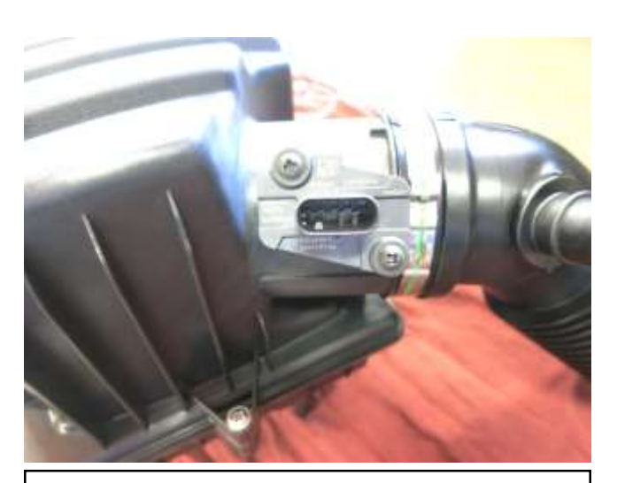
h. Remove the humidity sensor from the air box with Phillips screw driver if so equipped . Sensor will be reinstalled in a later step.