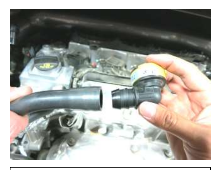
j. Remove the original crank case elbow connection from the rubber hose as shown.