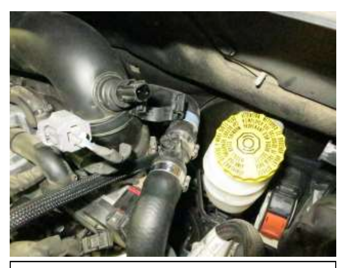
d. Unclip the rubber hose shown from the intake tube. Disconnect the IAT harness from the sensor and loosen the hose clamp on the throttle securing the intake tube.