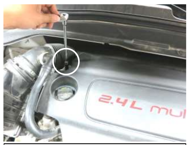
a. Remove the M6 bolt shown. Pull up on the engine cover to detach it from the mounting grommets.