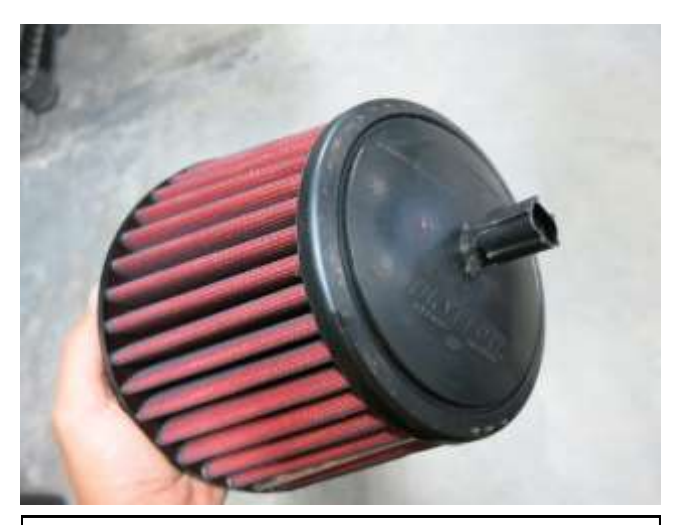
a. Carefully install the IAT sensor into the endcap of the AEM filter. Note: Soapy water will help with installation.

a. When installing the intake system, do not completely tighten the hose clamps or mounting hardware until instructed to do so.