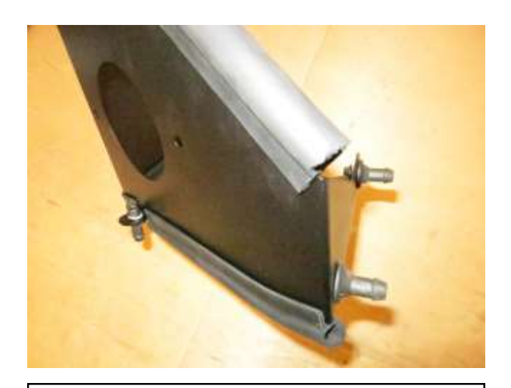
c. Fasten the supplied plastic mounts(8-186-1) to the heat shield as shown using the supplied split washers(1-3036) and M6 bolts(1-2110).