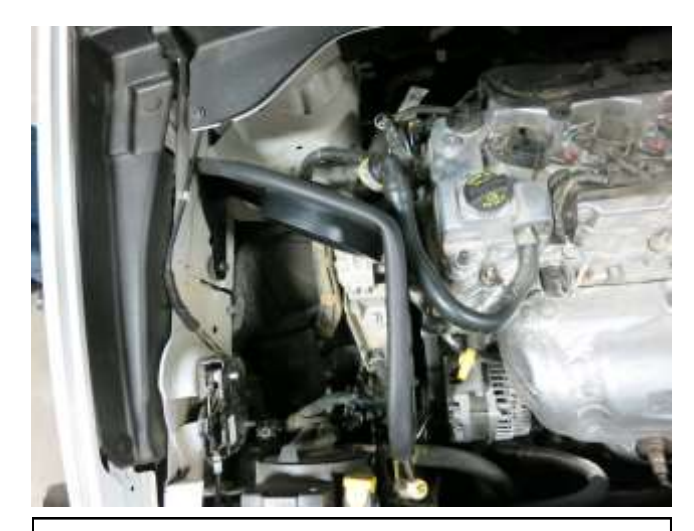
e. Install the heat shield as shown into the original air box mounting grommet locations.