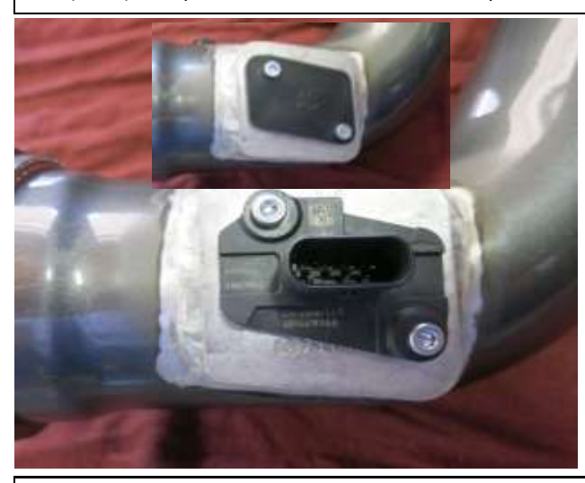
i. If equipped with humidity sensor, install the sensor into the sensor pad as shown with supplied hardware otherwise install block-off plate with supplied gasket and hardware as shown.