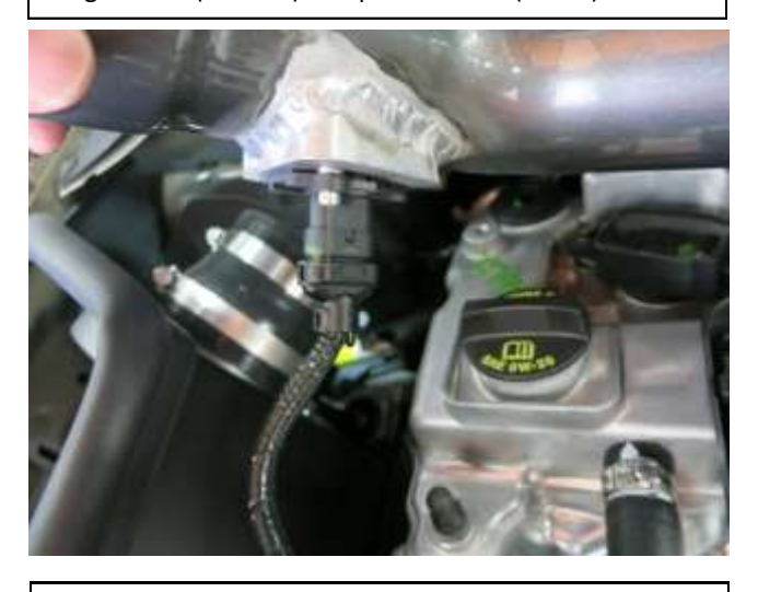
i. If equipped with humidity sensor, attach the electrical connector at this time otherwise proceed to next installation step.