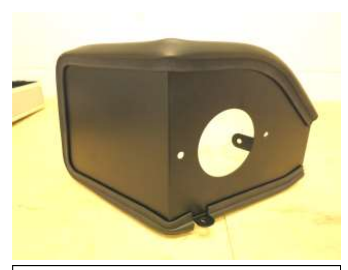
b. Install the supplied edge trim(102496, 8-4008) as shown and trim accordingly if needed with side cutters.