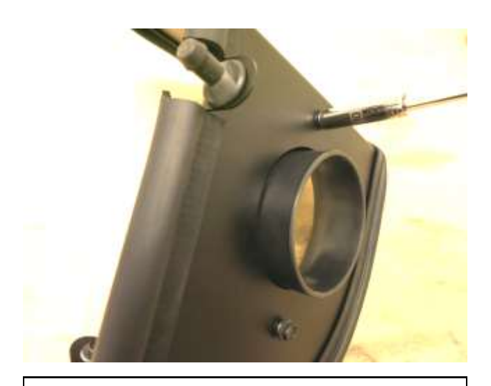
d. Orient and fasten the air horn(21512-1) to the heat shield as shown with the split washers(1-3025) and bolts (1-2110) included in the kit.