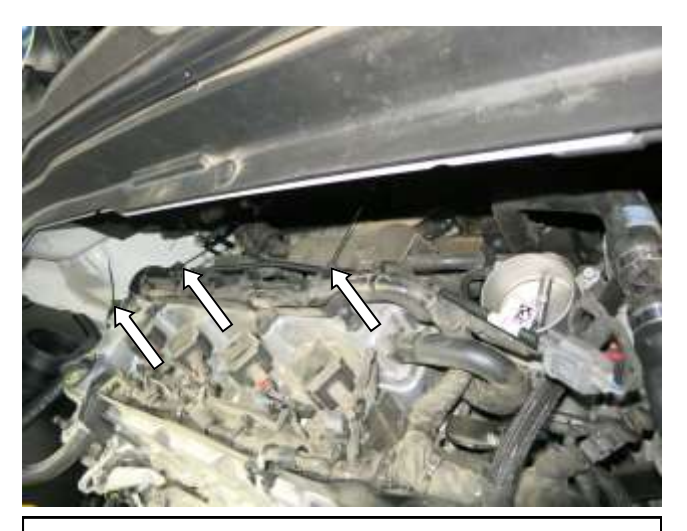
f. Extend the stock IAT wire harness by installing the extension(21781) provided and fasten as indicated using the provided zip ties(1-113).