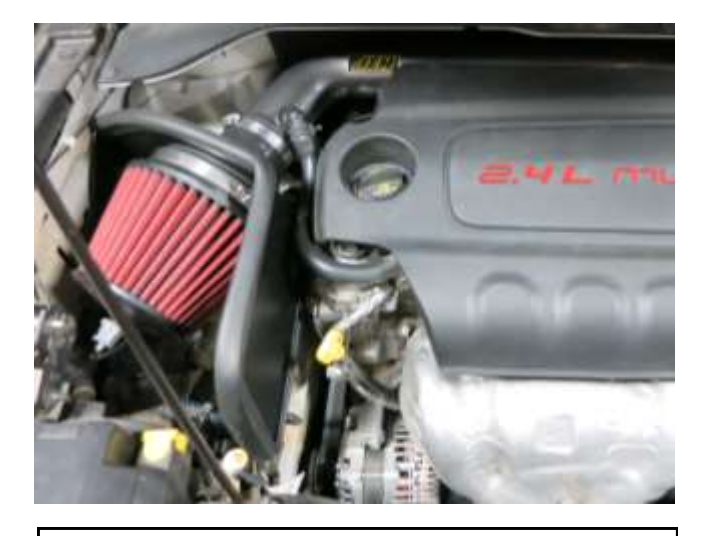
m. Check the harness clearance and snip off excess tabs on zip ties. Reinstall the engine cover and fasten with the stock bolt.