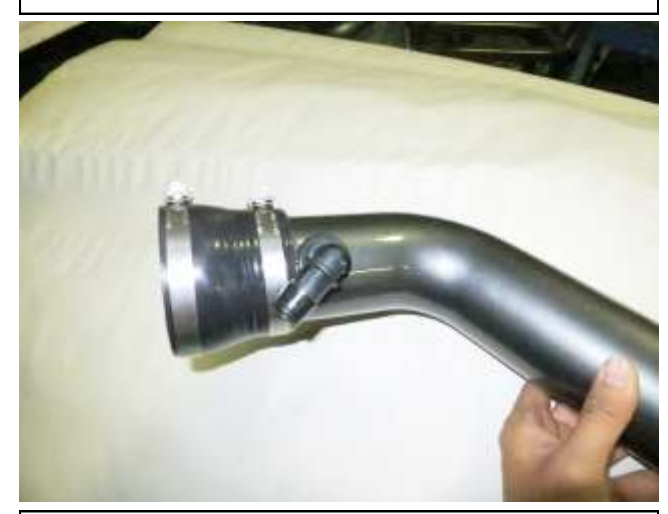
h. Pre-assemble the AEM tube as shown, installing the provided coupler(5-353), hose clamps(9448, 9456), rubber grommet(784645) and plastic elbow(8-139).