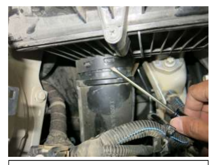
e. Use a flathead screwdriver to detach the inlet duct from the lower air box.