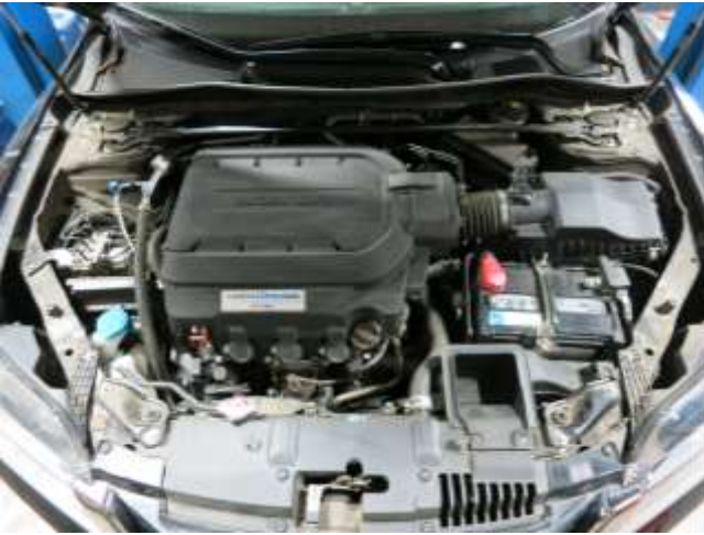
k. STOCK INTAKE SYSTEM