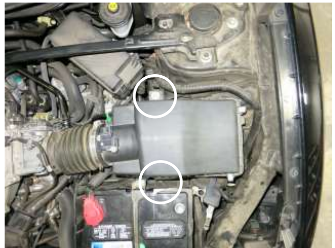
d. Remove the two bolts circled that secure the air box to the vehicle.