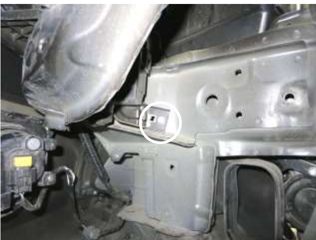
m. Remove the bolt securing the above bracket . This bolt will not be reused.