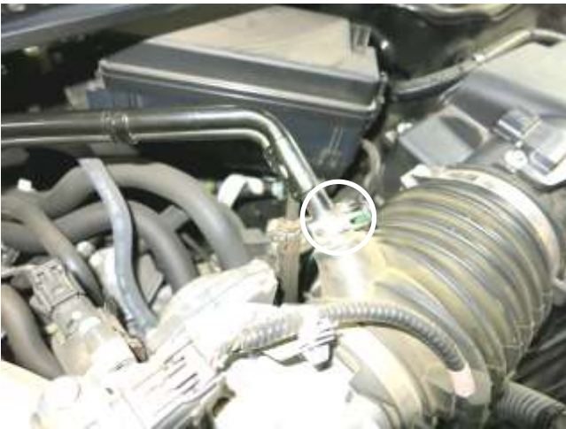
c. Squeeze the spring clamp and remove the vent line from the stock intake tube. This will be reused in step 3f.