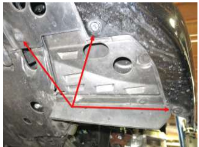
-the clip can then be pulled out together. Repeat for the three clips in front of the wheel shown above.