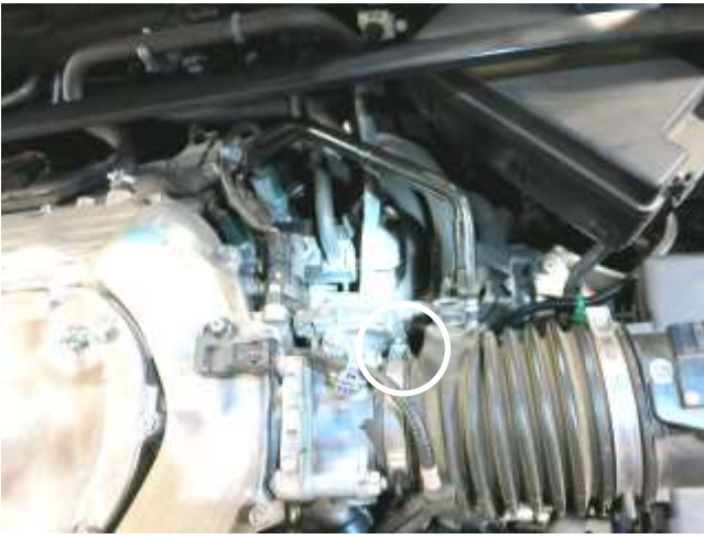
e. Loosen the hose clamp at the throttle body and remove the intake tube from the throttle body.