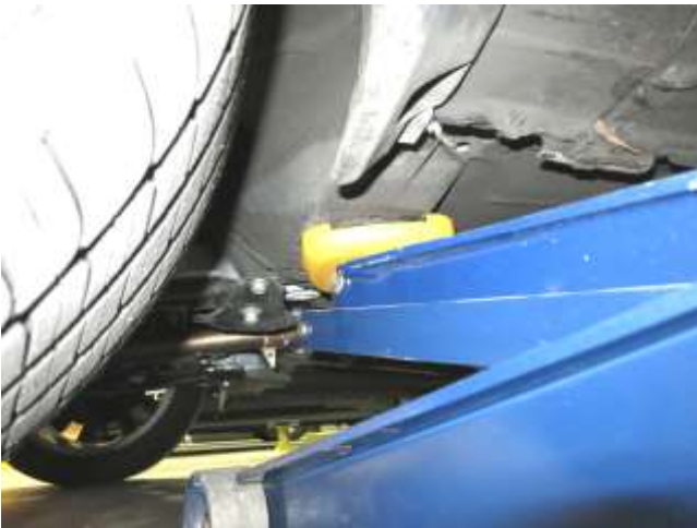
g. Jack vehicle up at a weight bearing location to lift driver-side wheel off the ground, then remove the wheel.