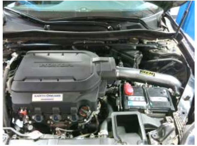
l. AEM INTAKE SYSTEM