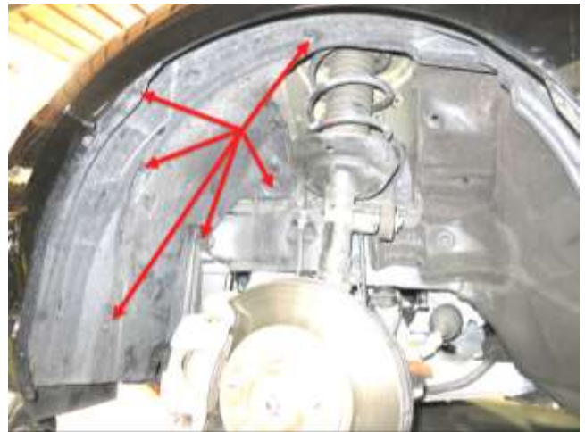
h. Using a flat screw driver, disconnect the nine trim panel clips shown above. Disconnect by inserting screw-