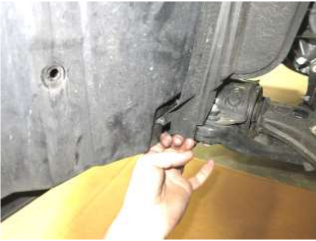
j. Separate the undercarriage panel from the fender liner by rotating them away from each other.