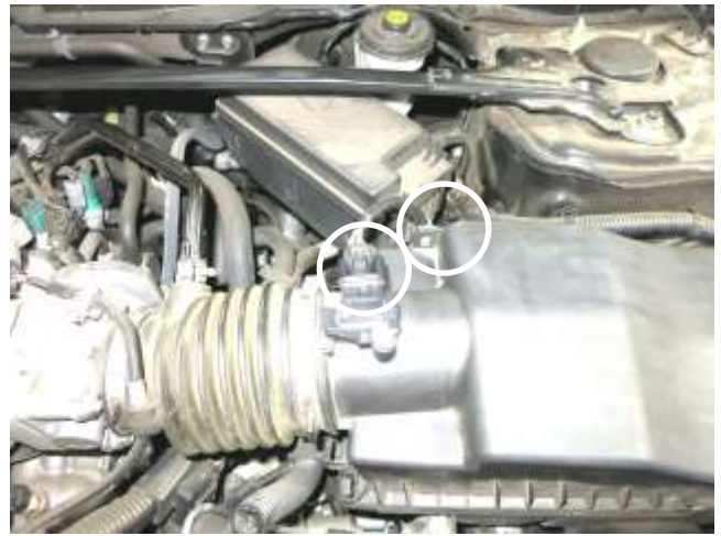
b. Depress the MAF electrical connector and squeeze the green clip to remove the wiring harness from the stock air box.