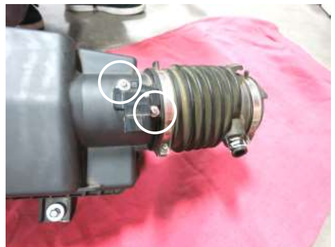
n. Remove the two screws securing the MAF to the stock air box. These will be reused in step 3c.