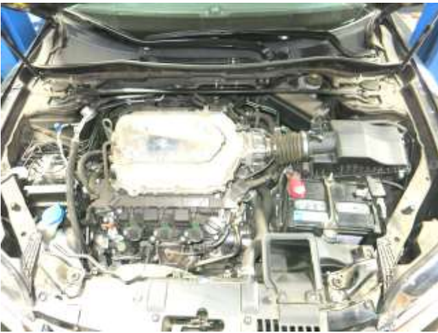
a. Remove the engine cover by lifting straight up.