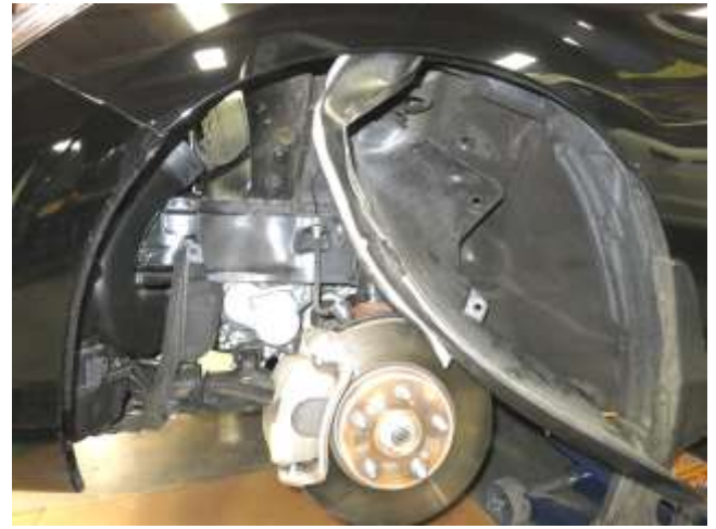
k. Once the fender liner is free, it can fold neatly back behind the brake assembly as shown.