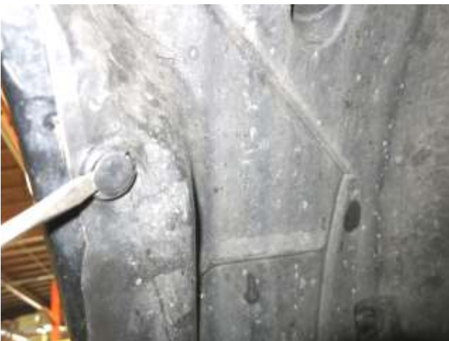
i. drivers on both sides, one after the other and twisting until one piece separates from the other. Both pieces of