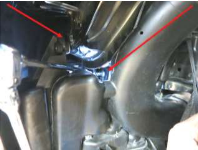
l. First remove the bolt shown above on the left, allowing you to lower the resonator. Using a short 10mm socket and u-joint on the end of at least 14" of extension