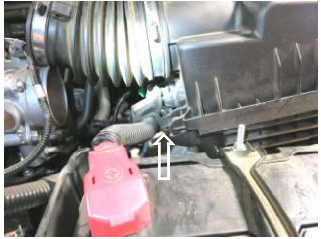
f. Unclip the wiring harness from the stock air box and remove the stock intake system from the vehicle. Note: Do not discard any of your stock equipment.