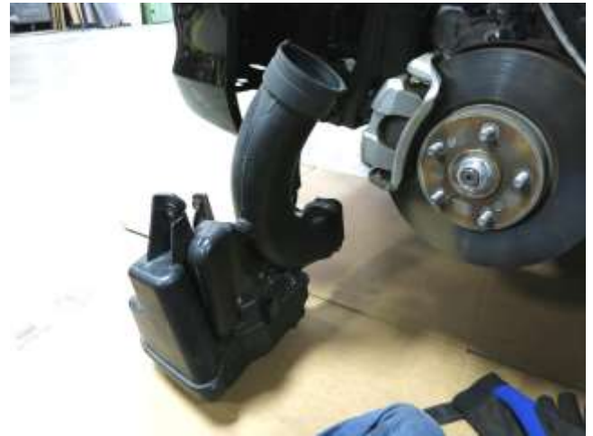
-and remove the bolt on the right. The resonator can then be pulled out as shown above.