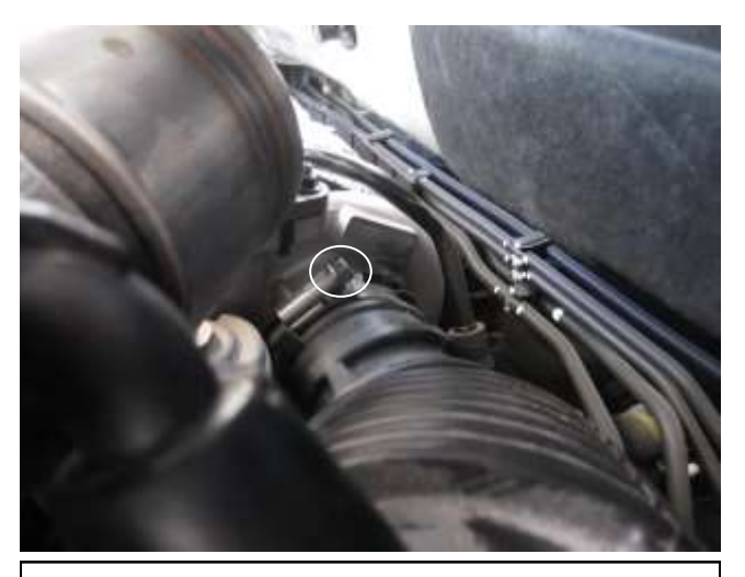
d. Loosen the hose clamp at the throttle body and remove the stock air box/intake tube from the vehicle. Note: Do not discard any of your stock equipment.