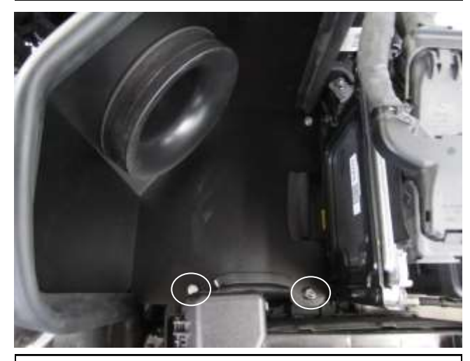
i. Install a washer (08275) and nut (07529) onto the rubber mount, shown on the right. Then install the bolt (08373), 2 washers(08275), and nut (07529) to secure the heat shield to the bracket. Ref. Exploded View