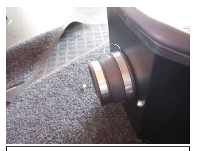
f. Install the hose adapter (5-1046) onto the filter adapter with hose clamps (9448 & 9456). Tighten the hose clamp closest to the heat shield at this time.