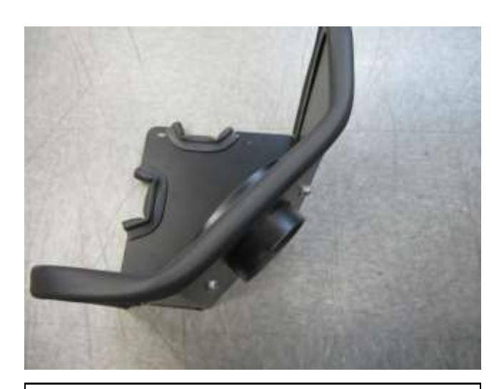
d. Install the adapter (21512-1) with the supplied button heads (07730) and 2 washers (1-3025 & 08275).