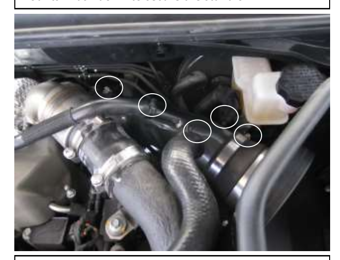
j. Install the AEM intake tube (2-1513C) into the two couplers. Tighten both hose clamps. Install all three of the hoses onto the tube and re-install the spring clamps to secure them that were removed in 2c.