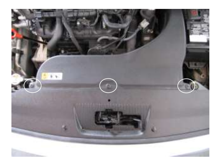
a. Remove the engine cover by pulling it up and out of the vehicle. Then, remove the 3 plastic screws circled and pull the stock scoop out of the vehicle.