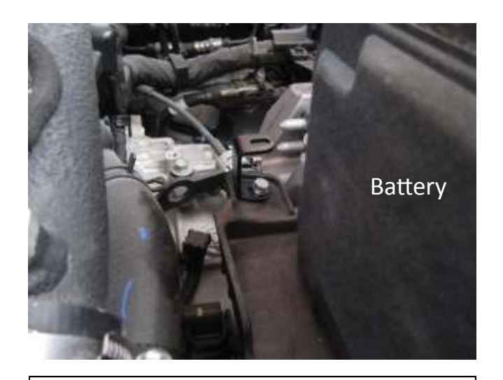
a. Install the supplied bracket (32-3095), bolt (08373), and washer (08275) onto the angled part of the battery tray as shown. Note: The 90° bend will be at the top part of the bracket.

When installing the intake system, do not completely tighten the hose clamps or mounting hardware until instructed to do so.