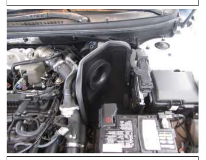
h. Install the completed heat shield into the vehicle aligning the 2 slots in the front to the previously installed mounts. Push down to secure the stand off.