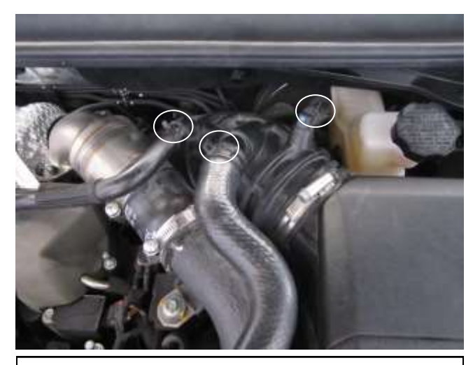
c. Release the 3 spring clamps circled on the stock intake tube and remove the 3 lines attached to the stock intake tube. These will be reattached in step 3j.