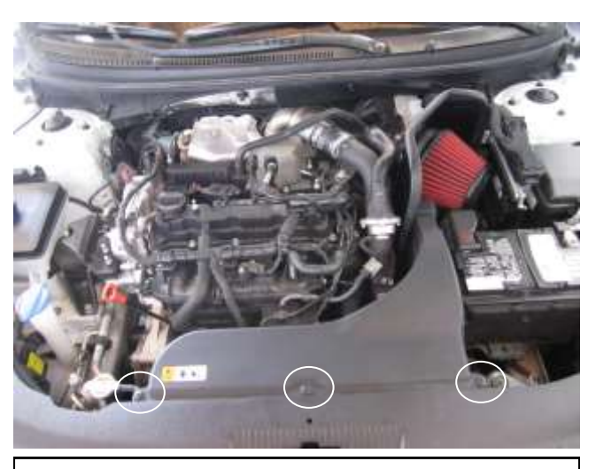
I. Install the stock scoop and plastic screws that were removed in step 2a. Then reinstall the engine cover.