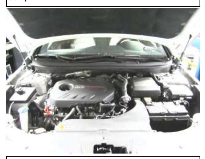
Stock Intake Installed.