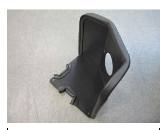
c. Install the edge trim(102487) as shown. Cut the trim to fit all three sections.