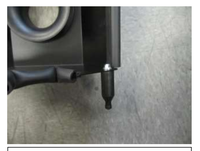
e. Install the standoff (06532) with the bolt (08318) and washer (08272) onto the heat shield as shown.