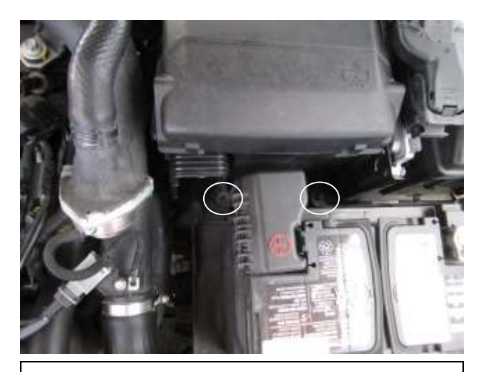
b. Remove the 2 bolts securing the stock air box to the vehicle.