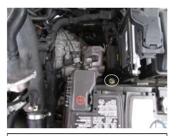
b. Install the rubber mount (1228599) into the battery tray location shown.