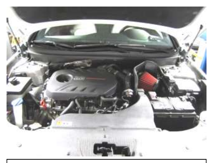
AEM Intake Installed