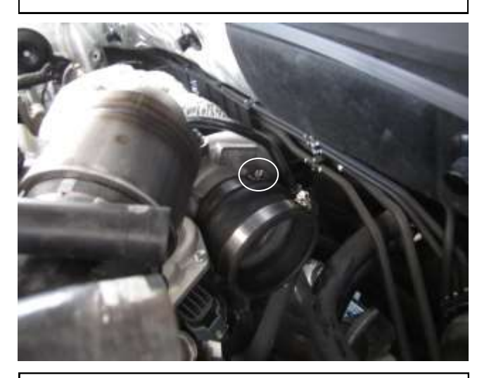
g. Install the hump hose (5-574) onto the turbo with the supplied hose clamps (9440 & 9448). Tighten the hose clamp closest to the turbo at this time.