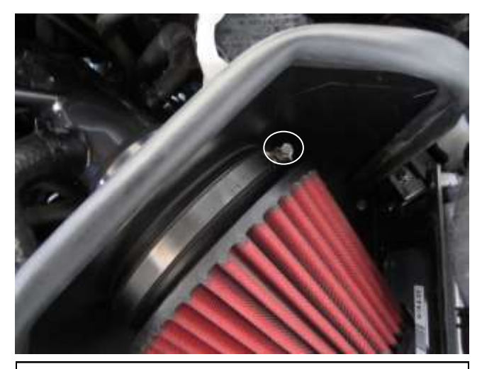
k. Install the AEM filter (21-209DK) and hose clamp (94104) onto the filter adapter and secure the hose clamp.