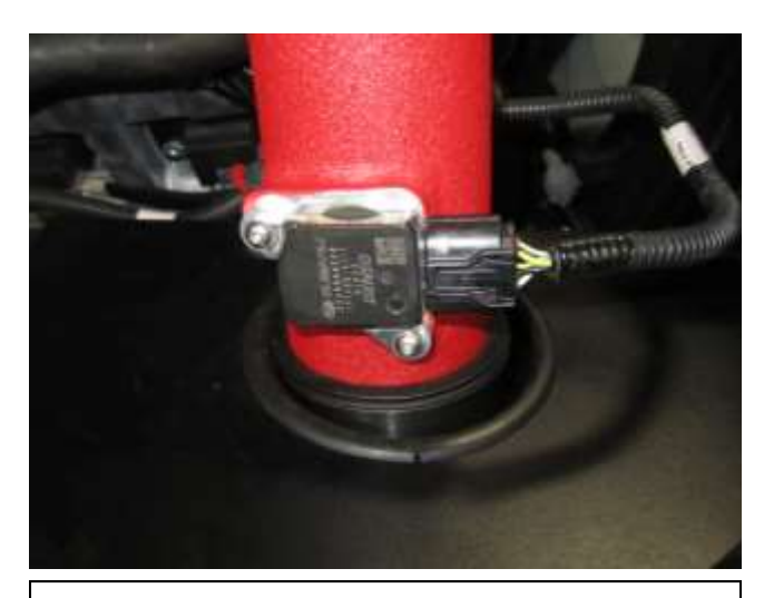
n. Plug in the mass air flow sensor connector that was detached in 2b.