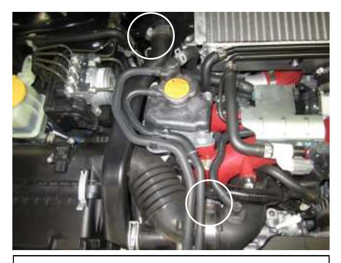
e. Loosen the hose clamps at the sound tube and the stock intake tube. Then remove the complete air box from the vehicle. NOTE: Do not discard your stock equipment.