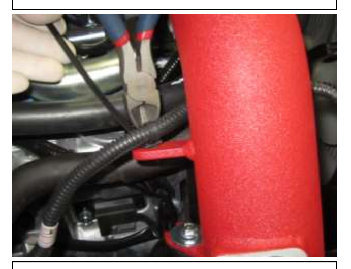
m. Secure the mass air flow sensor loom to the AEM intake tube with supplied push-in zip tie.