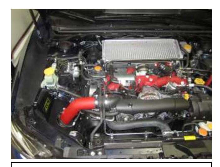
AEM Intake Installed.