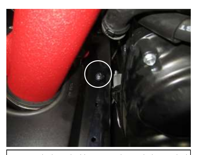
j. Secure the heat shield to engine bay with the supplied bolt (1-2038) .