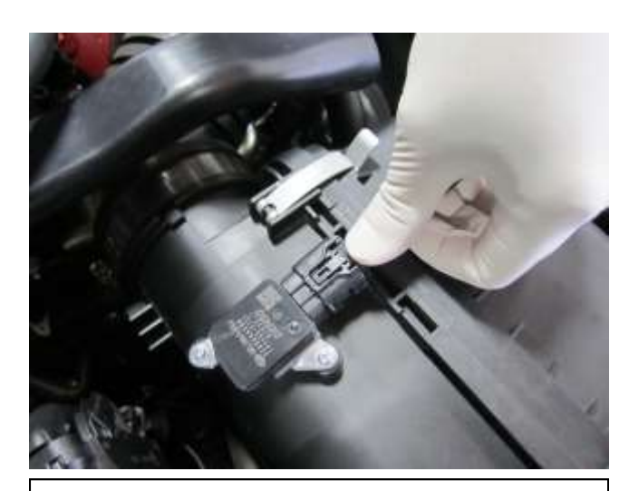
b. Depress the tab on the mass air flow sensor plug and disconnect it from the sensor.