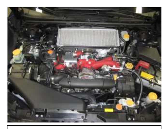
Stock Intake Installed.