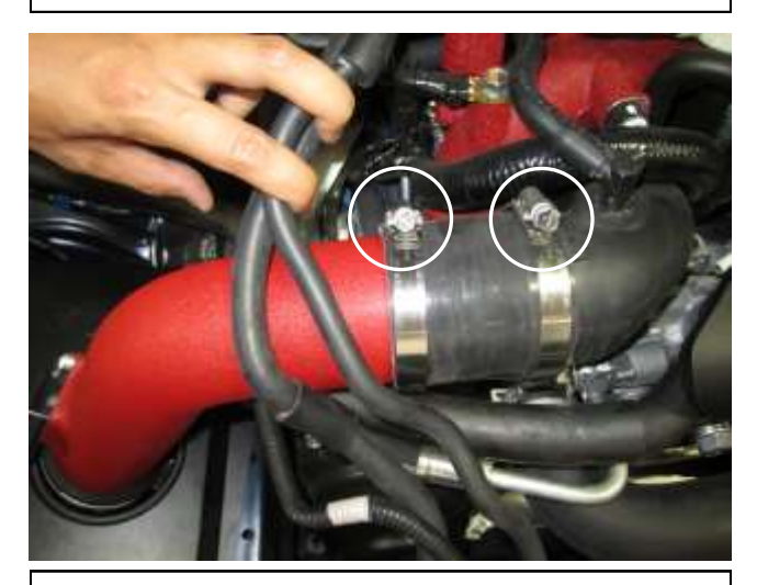
k. Install the supplied coupler (5-275) and tighten the two hose clamps (9444) onto the AEM intake tube and compressor inlet tube.