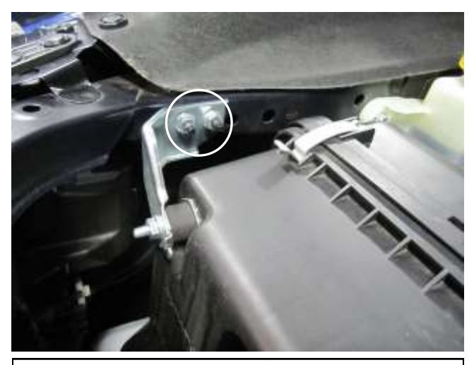
c. Remove the two bolts on the fender that secure the bracket. These will be re-used.