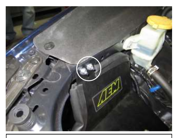
i. Re-install the nuts that were removed 2c) and tighten.