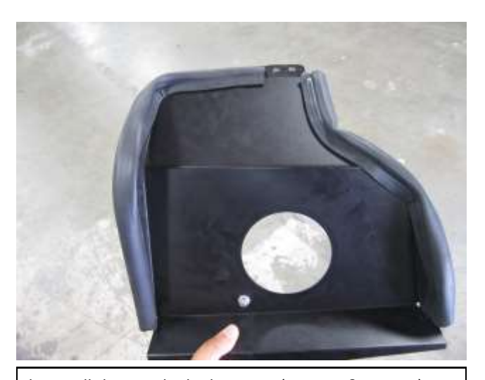
d. Install the supplied edge trims (102494 & 8-4013) onto the outer part of the heat shield.