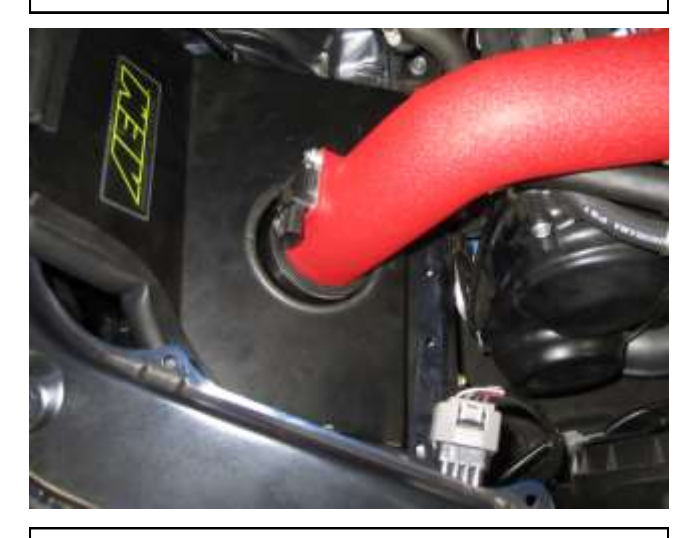
h. Install the filter, heat shield, and tube assembly into the vehicle.