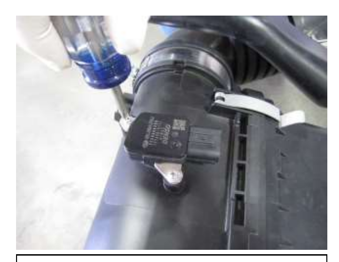
f. Remove the mass air flow sensor from the stock air box. This will be reused in 3a.