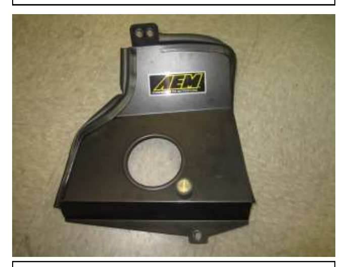
f. Completed heat shield assembly.