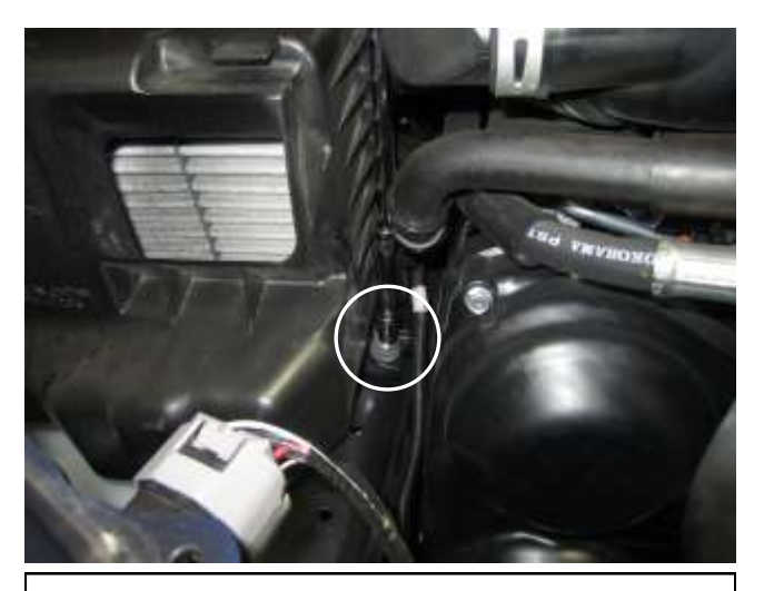
d. Remove the bolt that secures the air box to the engine bay.