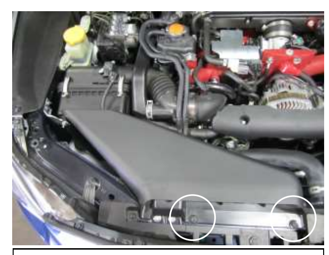
a. Remove the two plastic clips and the factory fresh air inlet duct.