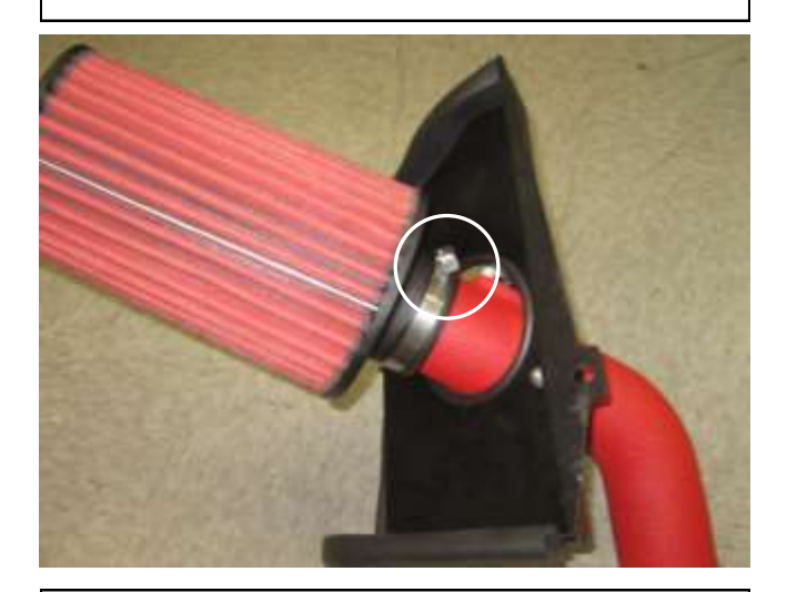
g. Install the AEM filter onto the AEM intake tube through the heat shield and tighten the hose clamp (9448)