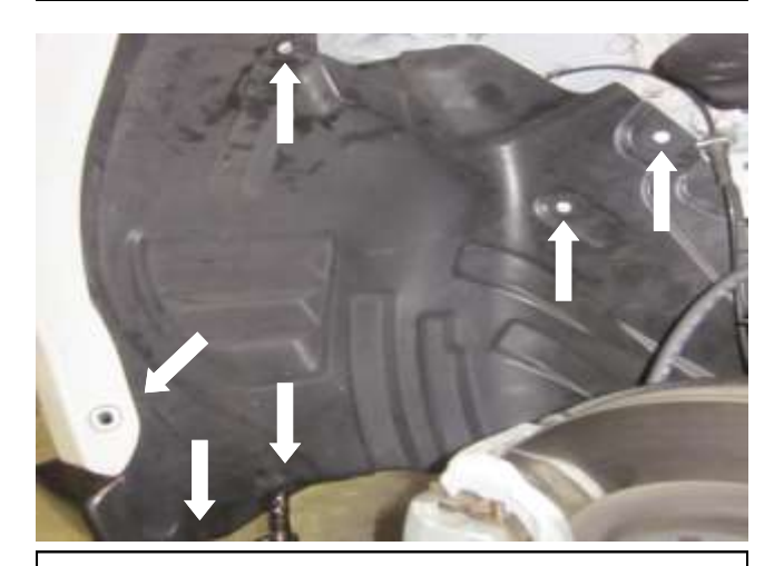
h. Raise vehicle to remove left front wheel. Remove the four locating tabs and the two M6 bolts that hold the wheel well liner in place. Position the liner out of way.