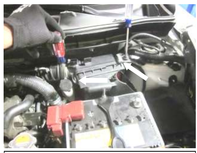
c. Loosen the hose clamp, remove the M6 bolt, and disconnect the two latches securing the air box lid to the base.