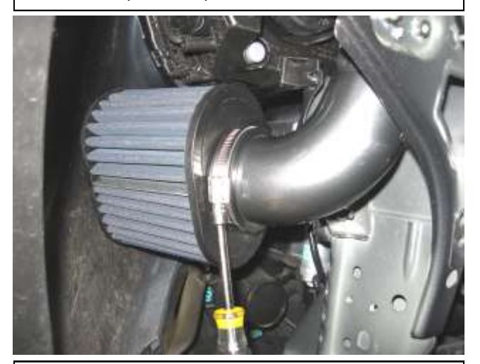
g. Install the AEM air filter onto the intake tube and tighten the provided hose clamp. On some trim models, the air filter may need to be rotated to fit properly.