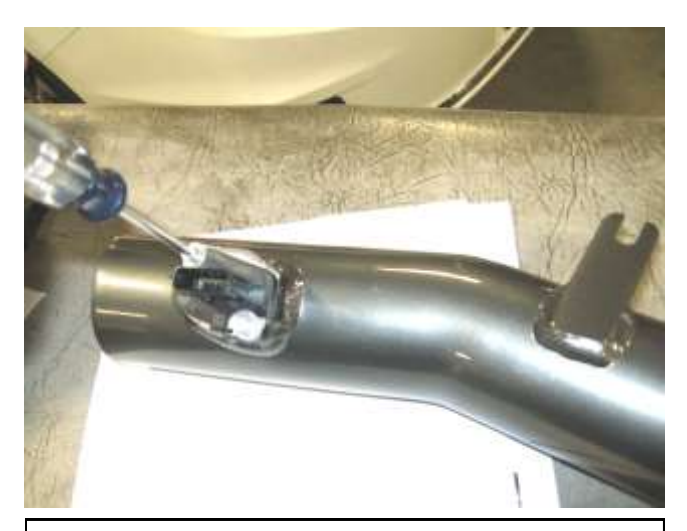
a. Install the MAF sensor onto the intake tube and secure with the two M4 screws that were removed in step2j.

a. When installing the intake system, do not completely tighten the hose clamps or mounting hardware until instructed to do so.