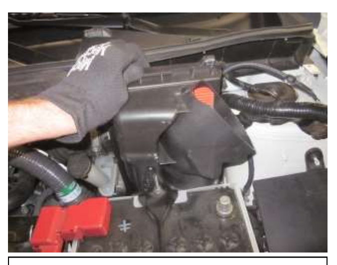
d. Remove the upper half of the air box with the filter still intact band lift both out of the engine compartment.