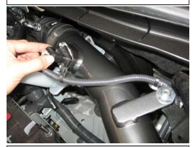
h. Install the MAF sensor connector onto the MAF sensor that was removed in 1a and reinstall fender well liner and wheel in reversed order outlined in step 2h.