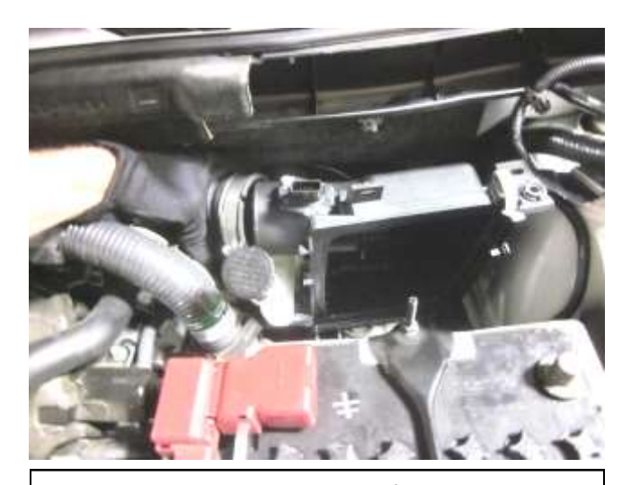
e. Disconnect the stock intake tube from the air box.