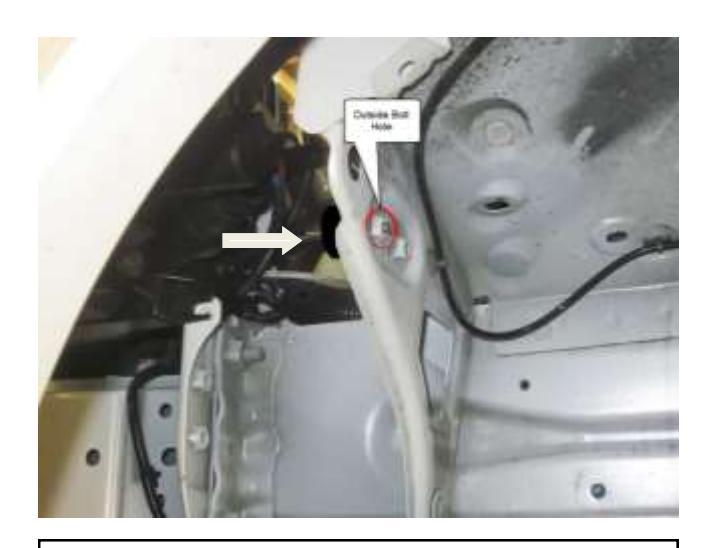
c. Install the second rubber mounted stud into the "outside" bolt hole in the fender well brace, make sure to capture the harness bracket, and tighten.