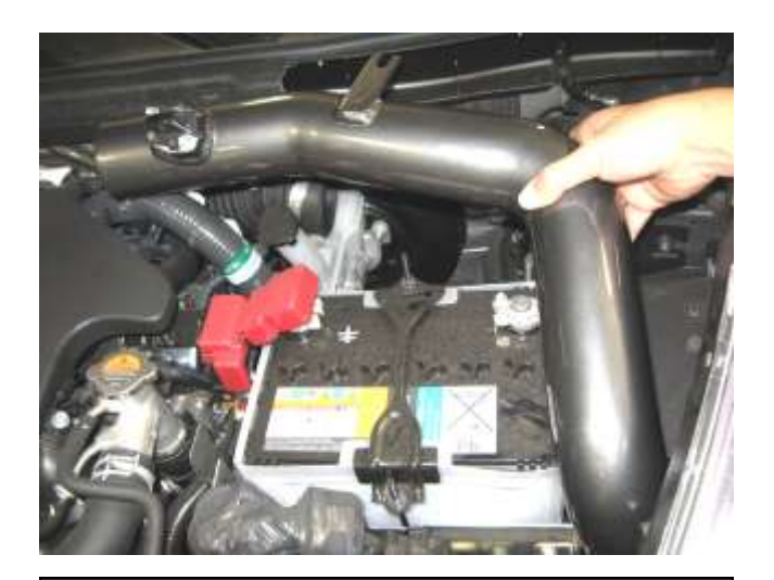
d. Install the AEM intake tube by inserting it into the opening next to the battery and into the lower fender well first, and then gently maneuver it into position.