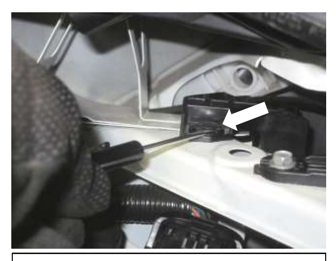
g. Disengage the resonator's plastic locating tab above the drivers side head light.