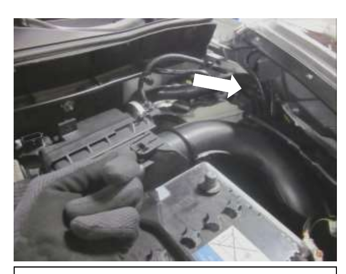
b. Lift up on the air box tab and pull out the locating pin on the stock air intake tube.