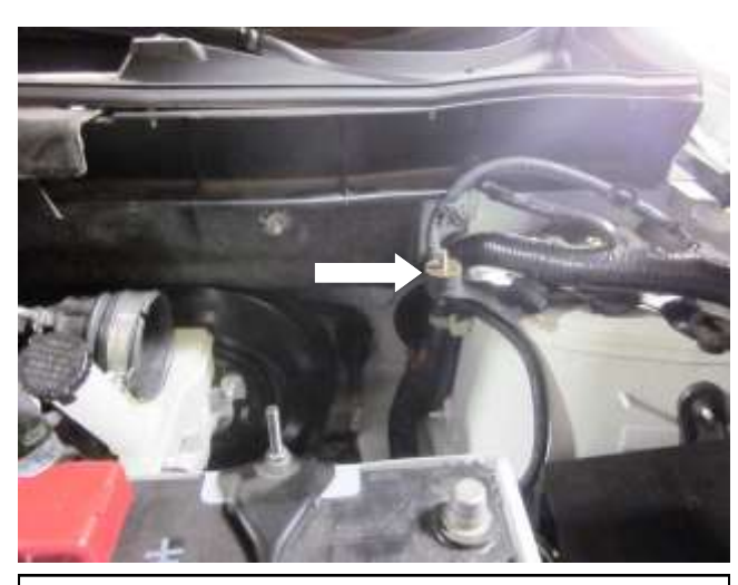
b. Install one of the provided rubber mounted stud in the bracket where you removed the M6 bolt in step "C" and tighten.