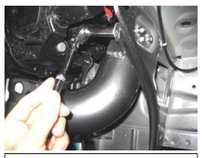
f. Align the lower portion of the AEM intake tube bracket on top of the rubber bushing and tighten the provide M6 nut/washer.