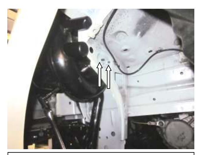
i. Remove the two M6 bolts in the fender well brace that holds resonator and harness bracket in place.