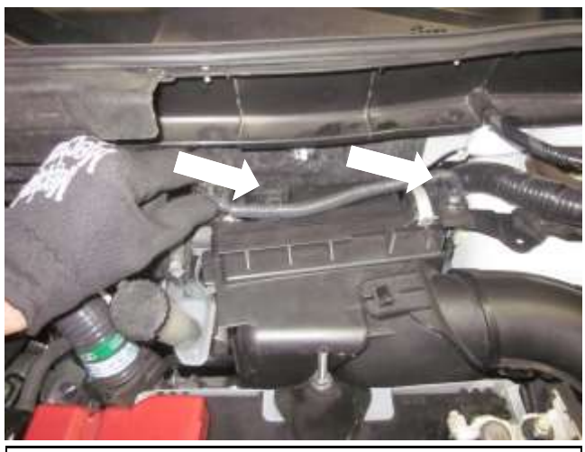
a. Unplug the MAF sensor connector and disconnect the two clips holding the wiring harness to the air box.