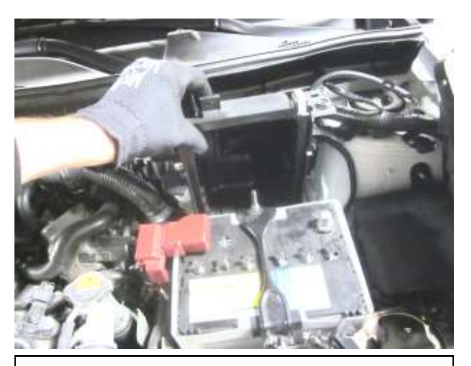
f. Remove the stock air box from the vehicle. Note: Remove the rubber bushings under the air box and keep with air box as they will not be utilized.