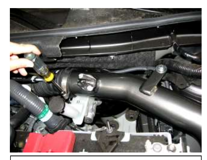
e. Position the AEM tube inside the stock intake hose and align the bracket with the rubber bushing. Tighten the hose clamp and the provided M6 nut/washer.