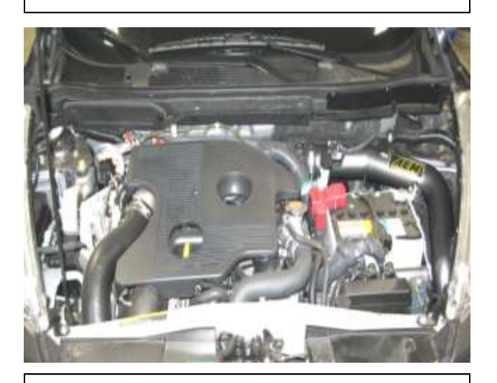
j. Finished installation of AEM Intake System.