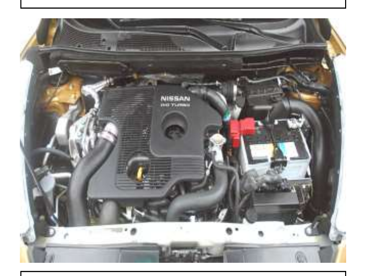
i. Factory air induction system.