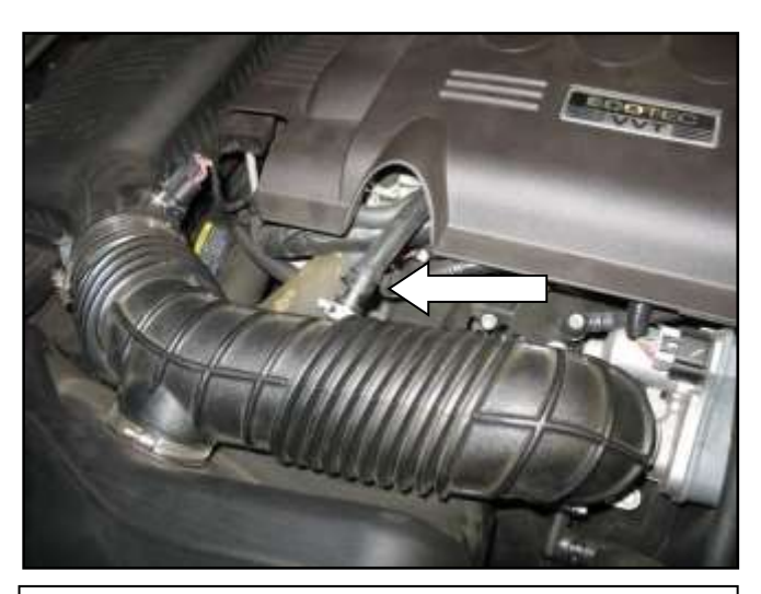
b. Unclasp the spring clamp. Remove the PCV breather hose from the inlet tube.