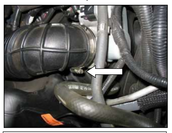
a. Loosen the hose clamp at the throttle body.