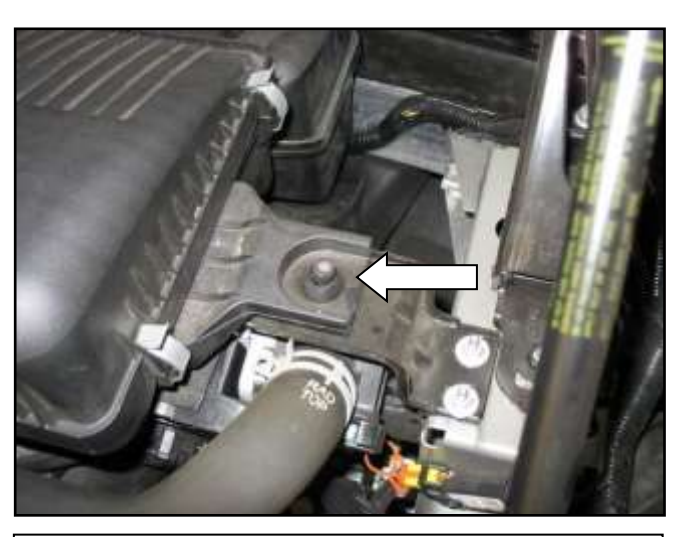
g. Loosen the remaining air box mounting bolt. Remove the air box from the engine bay, careful not to damage the hood.