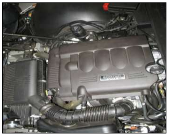
Factory air box system installed