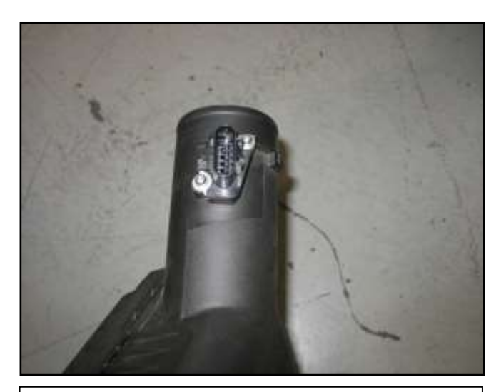
c. Remove the MAF sensor from the stock air box. The mounting screws will be reused.