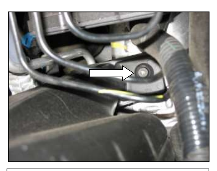
d. Loosen the inlet resonator tube mounting bolt located near the throttle body.