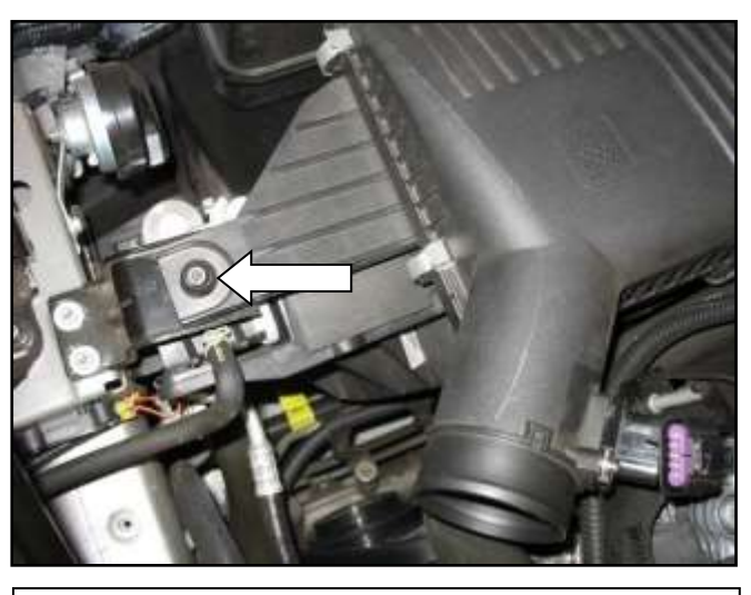
f. Loosen the air box mounting bolt.