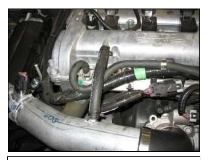
f. Insert the intake pipe into the coupler at the throttle body. Attach the supplied breather hose and secure with the factory spring clamps.