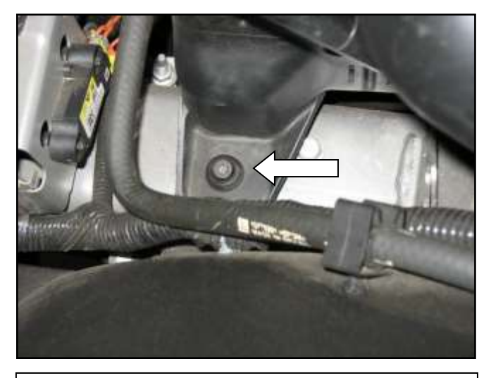
e. Loosen the remaining inlet resonator tube mounting bolt.