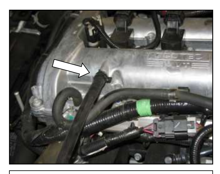
i. Remove the breather hose by unclasping the spring clamp. Both clamps will be reused.