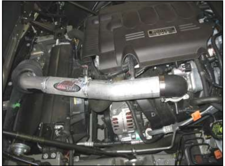
AEM® intake system installed