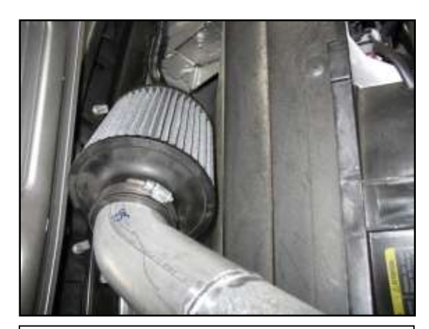
h. Attach the air filter element as shown and secure with the #48 hose clamp. Check for clearance against the radiator shroud. Attach filter sock to protect against the elements.