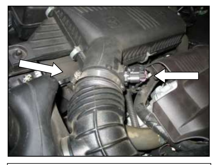
c. Loosen the hose clamp at the air box. Disconnect the mass air flow (MAF) sensor connector.