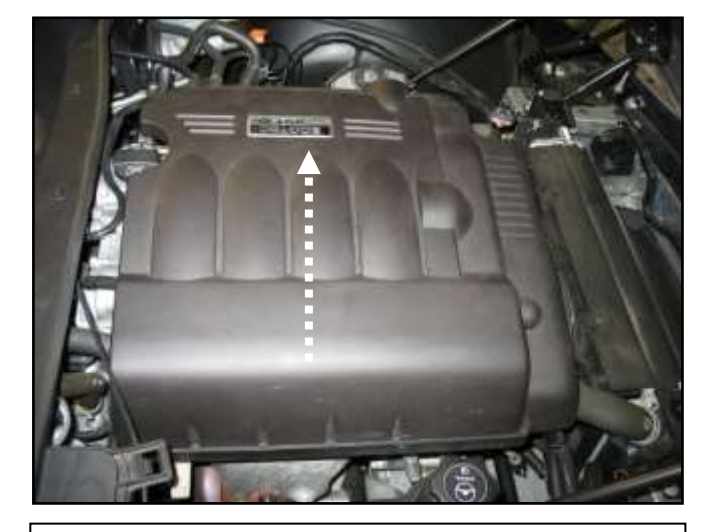
h. Remove the engine cover by pulling straight up on all four corners. This part will be reused.