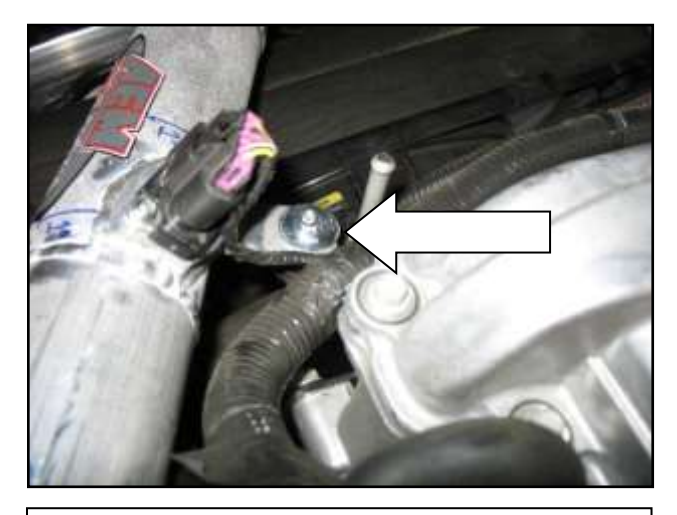
g. Align the bracket with the rubber mount. Secure with the M6 washer and M6 serrated nut. Reconnect the MAF sensor wire harness connector.