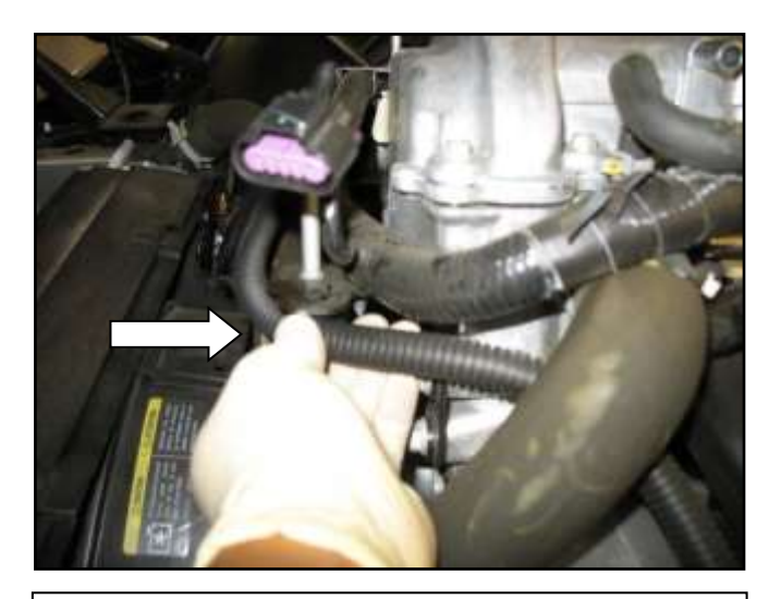
j. Remove the tree mount wire tie from the engine bracket.