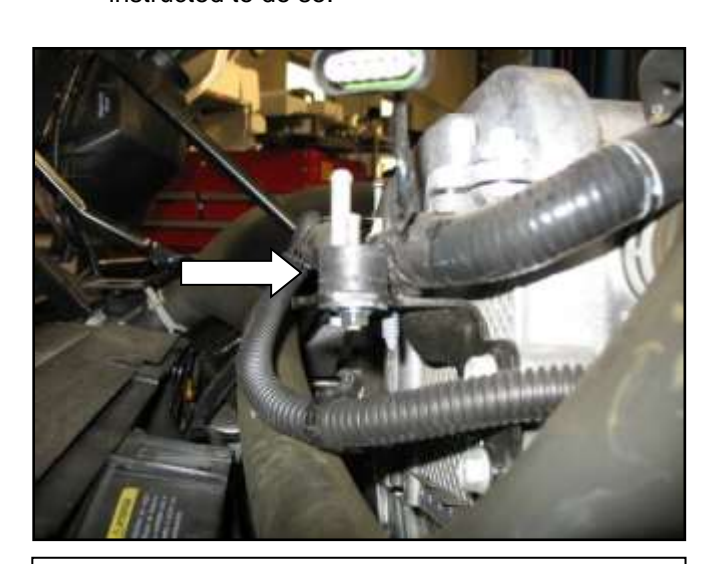
b. Install the supplied rubber mount. Secure the bottom of the rubber mount with the M6 washer and serrated nut in the hole left by the tree mount wire tie.

a. When installing the intake system, do not completely tighten the hose clamps or mounting hardware until instructed to do so.