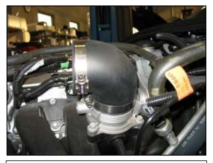
d. Attach the coupler at the throttle body as shown. Secure with the #44 hose clamps.