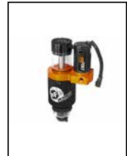
Diesel Fuel System

P/N: 42-14011 (Full-time) 42-14012 (Part-time)