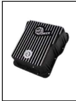
Transmission Pan Cover

P/N: 46-70012-WL (w/ Oil) 46-700012 (Blk) 46-70010 (RAW)