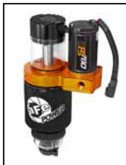
Diesel Fuel System

P/N: 42-12035 (Full-time) 42-12036 (Boost Act.)