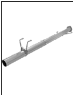
Exhaust Race Pipe

P/N: 50-72005 (P10R) 51-72005 (PDS) 75-72005 (PG7)