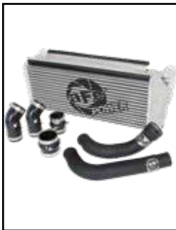
Intercooler w/ Tubes