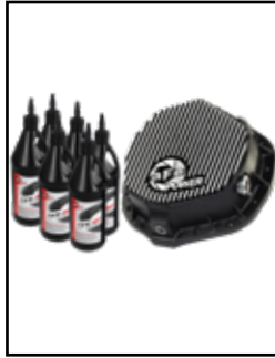
Rear Differential Cover

P/N: 46-70012-WL (w/ Oil) 46-70012 (Blk) 46-70010 (RAW)