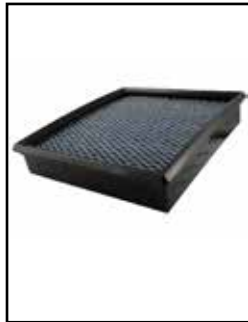
OER Air Filter

P/N: 30-10102 (P5R) 31-10102 (PDS) 73-10102 (PG7)