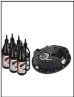
Front Different Cover

P/N: 46-70042-WL (w/ Oil) 46-70042 (Black) 46-70040 (RAW)