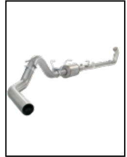
Race Exhaust System

P/N: 49-02003 (w/ Muffler) 49-02003NM (no Muffler)