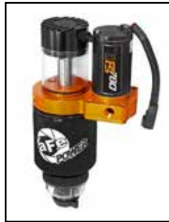
Diesel Fuel System

P/N: 42-12021 ('03-'04.5) 42-12031 ('05-'10)