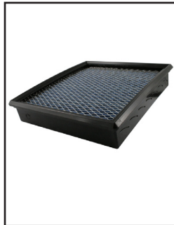
OER Air Filter

P/N: 30-10011 (P5R) 31-10011 (PDS) 73-10011 (PG7)