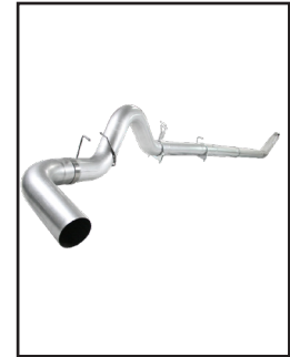
Race Exhaust System