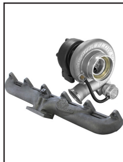
Turbocharger w/ Manifold

P/N: 46-70032-WL (w/ Oil) 46-70032 (Blk) 46-70030 (RAW)