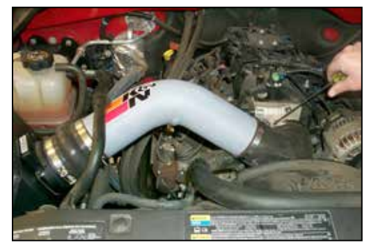
16. Install the K&N<sup>®</sup> intake tube into the angled hose, then, slide the other end into the hump hose. Adjust everything for best fit and clearance and tighten all hose clamps as shown.