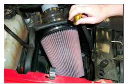
18. Install the K&N<sup>®</sup> air filter onto the mass air adapter and secure it with the provided hose clamp as shown.