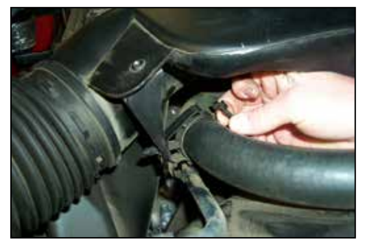
4. Unclip the radiator hose from the stock intake tube as shown.