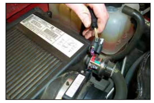
3. Disconnect the mass air sensor electrical connection as shown.

2. Remove the bolt that secures the engine cover, then, remove the engine cover as shown.