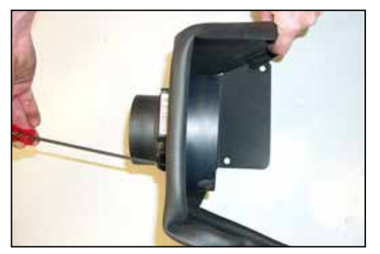
11. Using the provided hardware assemble the mass air adapter, heat shield, gaskets and the stock mass air sensor as shown.