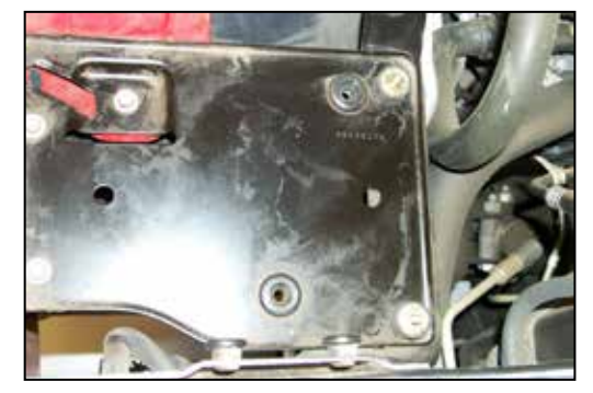
9. Install the rubber mounted studs as shown and tighten firmly by hand.