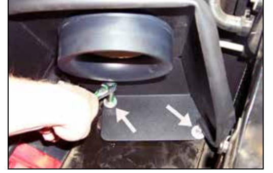
17. Tighten the hardware on the heat shield as shown.