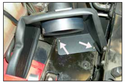
12. Install the heat shield onto the rubber mounted studs as shown.