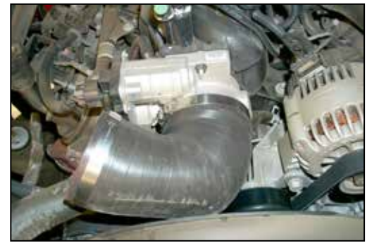
14. Install the silicone angled hose and hose clamps onto the throttle body but do not tighten at this time.