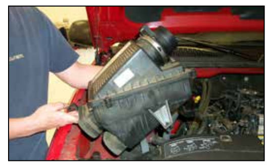
6. Pull firmly upwards to remove the air cleaner assembly as shown.

5. Loosen the hose clamps at the throttle body and at the mass air sensor, then remove the stock intake tube as shown.