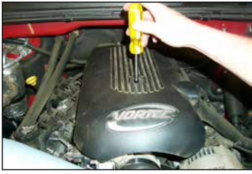
20. Reinstall the engine cover and secure it with the stock hex bolt.