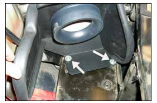
13. Secure the heat shield to the rubber mounted studs using the provided hardware but do not tighten at this time.