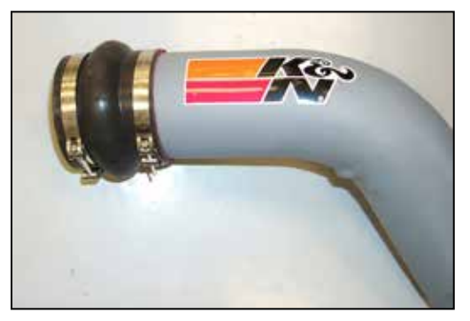
15. Install the silicone step hump hose and hose clamps onto K\&N^{\mbox{\tiny $\$$}} intake tube as shown.