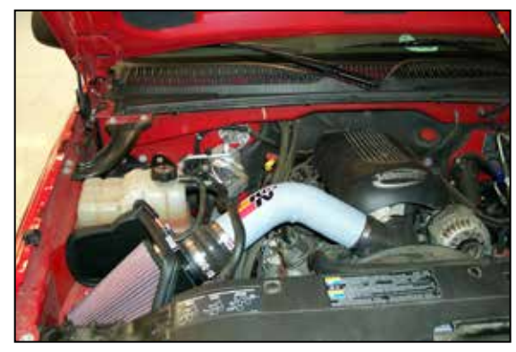
21. Reconnect the negative battery cable and double check to make sure everything is tightened and properly positioned before starting the vehicle.

22. The C.A.R.B. exemption sticker, (attached), must be visible under the hood so that an emissions inspector can see it when the vehicle is required to be tested for emissions. California requires testing every two years, other states may vary.