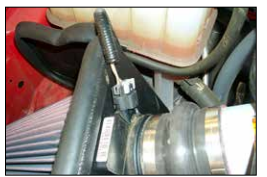
19. Reconnect the mass air sensor electrical connection as shown.