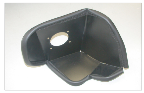
16. Install the provided trim seal onto the heat shield and trim to fit as shown.