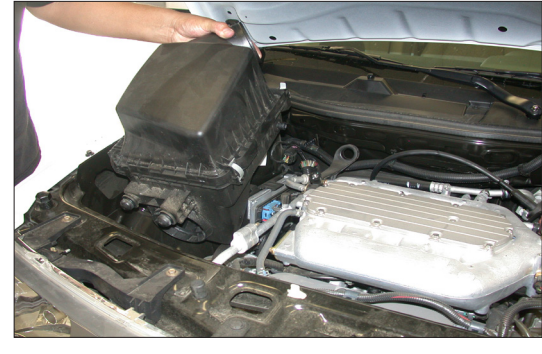
6. Pull upwards to remove the complete air cleaner assembly as shown.

NOTE: K&N recommends that you do not discard your factory air intake.