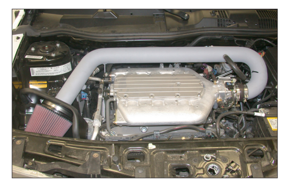
23. Reconnect the vehicle's negative battery cable. Double check to make sure everything is tight and properly positioned before starting the vehicle.