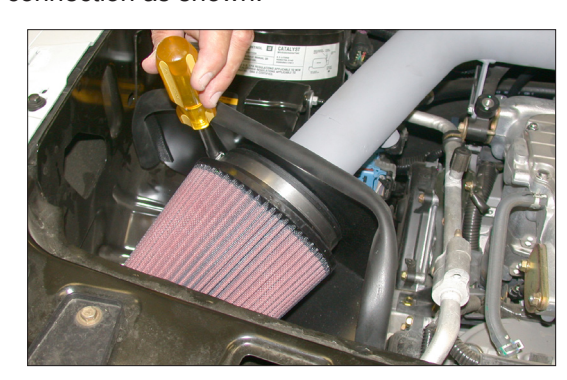
22. Install the Air Filter onto the filter adapter and secure it with the provided hose clamp as shown. NOTE: The air filter will have to be compressed/ squeezed and slided into the inner fender.