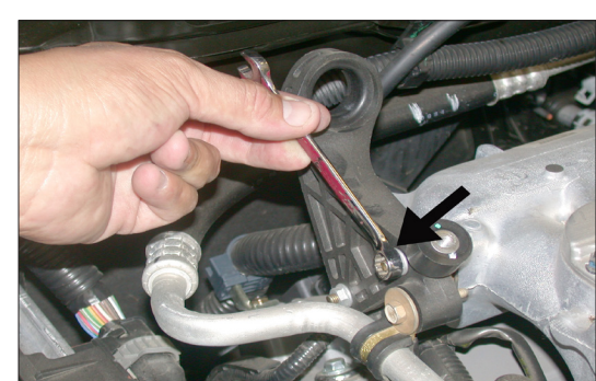
9. Remove the nut from the nylon bracket on the intake manifold as shown.