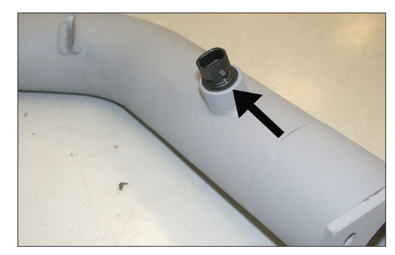
12. Install the air temperature sensor into the silicone hose as shown.