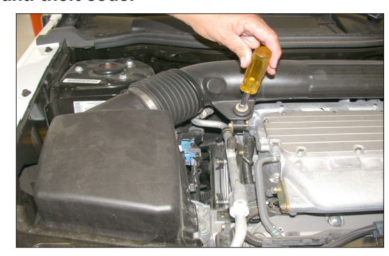
2. Remove the bolt that secures the air intake tube as shown.

NOTE: Disconnecting the negative battery cable erases pre-programmed electronic memories. Write down all memory settings before disconnecting the negative battery cable. Some radios will require an anti-theft code to be entered after the battery is reconnected. The anti-theft code is typically supplied with your owner's manual. In the event your vehicles' anti-theft code cannot be recovered, contact an authorized dealership to obtain your vehicles anti-theft code.