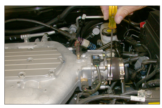
10. Install the silicone hose and hose clamps onto the throttle body as shown.