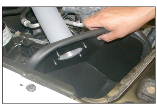
18. Install the heat shield onto the flange as shown.