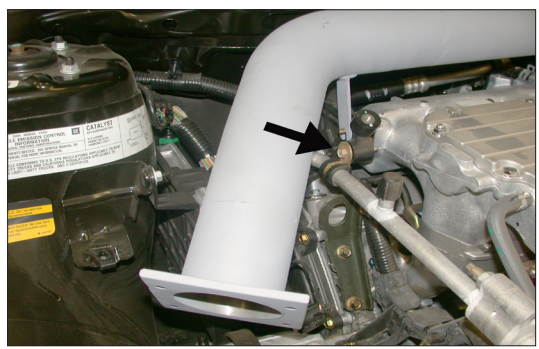
14. Line up the bracket with the stud from step 9 as shown.