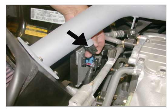
21. Reconnect the air temperature sensor electrical connection as shown.