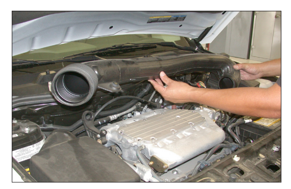
3. Loosen the hose clamps at the rubber boot on the throttle body and at the air cleaner assembly, then, remove the stock intake tube as shown.