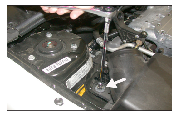
5. Loosen and remove the bolt at the back of the air cleaner as shown.