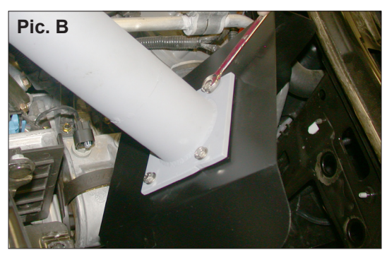
19. Install the remaining gasket and the filter adapter onto the flange (Pic. A) and secure with the remaining hardware (Pic. B) as shown.