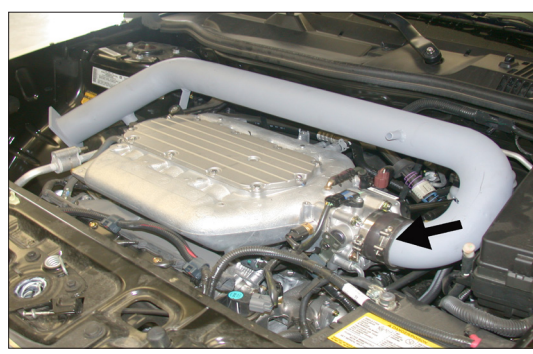
13. Install the K&N® Intake tube into the silicone hose on the throttle body as shown.