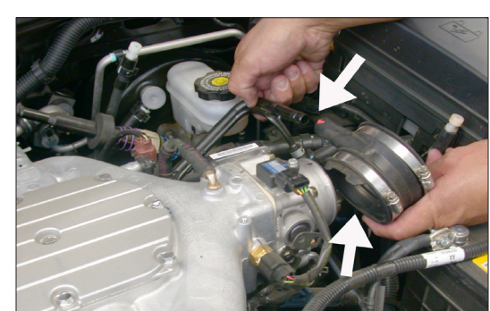
8. Remove the rubber coupler from the throttle body and disconnect the crank case vent as shown.