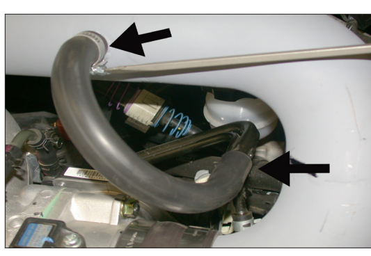
20. Slide the provided silicone hose onto the crank case vent hard line, then, connect the other end to the vent on the K&N® intake tube and secure with the provided hose clamp as shown.