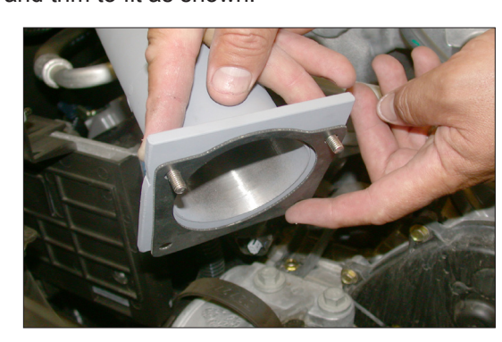
17. Install the hardware and one of the provided gaskets onto the intake tube flange as shown.