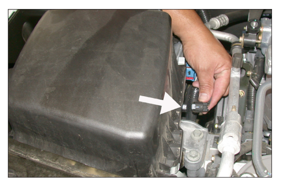
4. Disconnect the air temperature sensor electrical connection as shown.