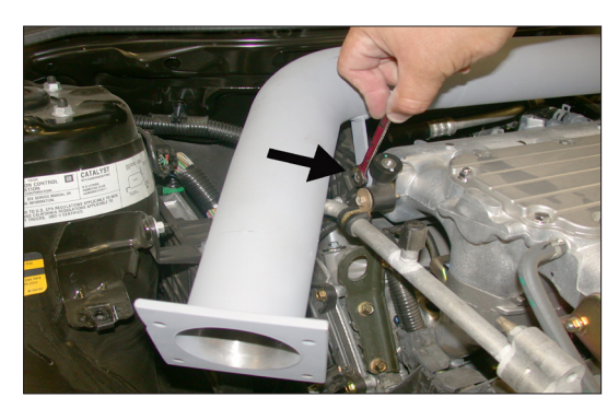
15. Secure the bracket to the stud using the nut removed in step 9 but do not tighten completely at this time