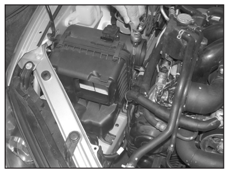
6. Loosen and remove the two hex bolts that secure the air cleaner to the inner fender as shown.

5. Loosen the hose clamps at the air cleaner and at the turbo inlet tube, then, unclip the coolants hoses from the stock intake hose and remove the stock intake hose as shown.