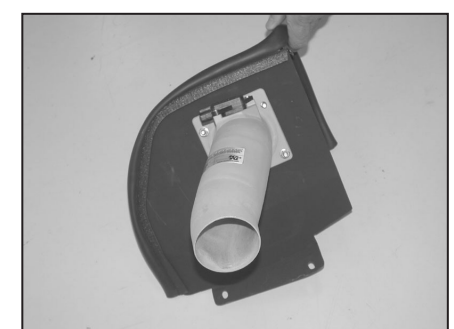
15. Install the intake tube onto the studs and secure with two of the provided nylock nuts and flat washers as shown in the orientaion.