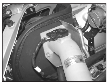
23. Reconnect the mass air sensor electrical connection as shown.