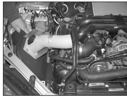
20. Install the complete assembly into the vehicle as shown.