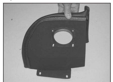
14. Install the adapter onto the heat shield and apply the remaining gasket onto the heat shield as shown.