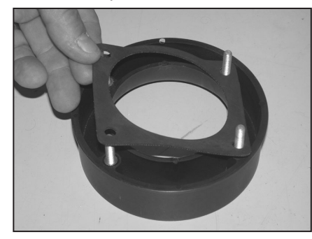
13. Apply one of the provided gaskets onto the adapter as shown.