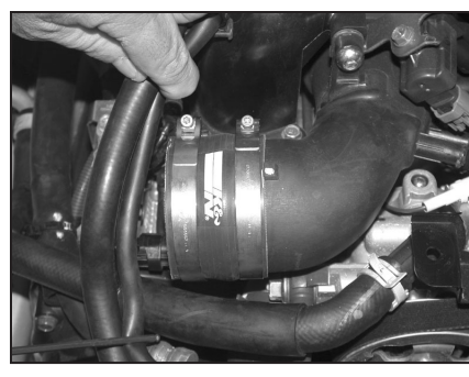
17. Install the provided silicone hose and hose clamps onto the turbo inlet tube as shown.