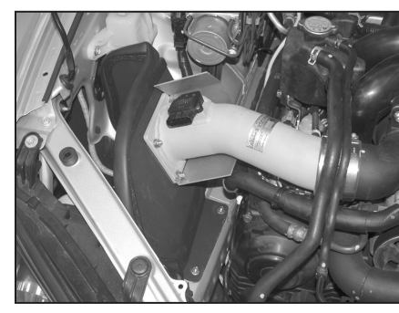
21. Line up the heat shield with the rubber mounted studs and secure with the provided nylock nuts, then, slide the intake tube into the silicone hose and secure as shown.