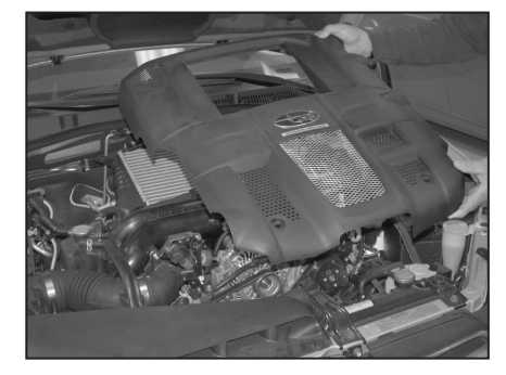
2. Remove the engine cover, which is secured by four plastic rivets.

NOTE: Disconnecting the negative battery cable erases pre-programmed electronic memories. Write down all memory settings before disconnecting the negative battery cable. Some radios will require an anti-theft code to be entered after the battery is reconnected. The anti-theft code is typically supplied with your owner's manual. In the event your vehicles' anti-theft code cannot be recovered, contact an authorized dealership to obtain your vehicles anti-theft code.