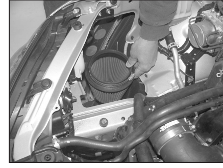
19. Place the K&N ^{\ensuremath{\circledast}} air filter into the cavity in the inner fender as shown.