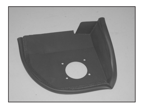
11. Install the trim seal onto the heat shield and trim to fit if necessary.