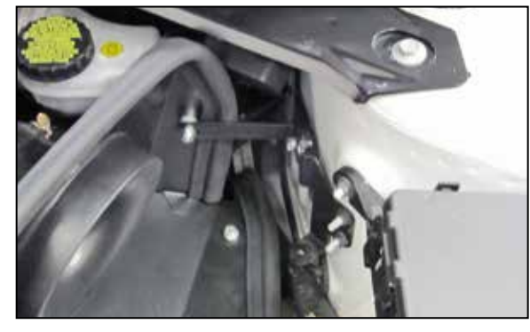
20. Secure the heat shield mounting bracket to the air box bracket on the strut tower with the provided hardware.

NOTE: On Nissan Pathfinder and Infiniti JX35 vehicles, the mounting bracket will be secured to the rubber mounted stud installed during step #9.