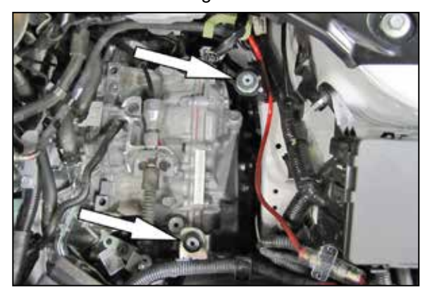
8. Install the two provided rubber mounting studs onto the air box mounting brackets as shown. NOTE: The forward rubber mounted stud should be a 1" tall, male/ female; the rear rubber mounted stud should be a ½" tall male/ female. Be sure to use two fender washers and one rubber washer on each rubber mounted stud. The fender washers will be on each side of the bracket with the rubber washer sandwiched between.