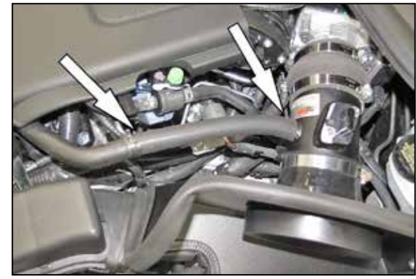
22. Install the crank case vent hose onto the fitting on the K&N<sup>®</sup> intake tube and the install the hose mender into the factory crank case vent hose and secure with the factory spring clamp.