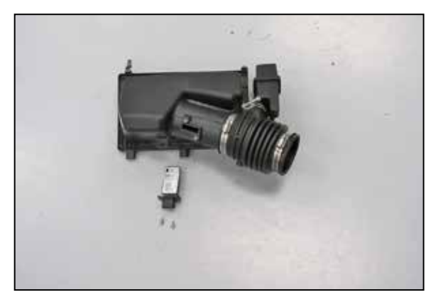
17. Remove the mass air sensor from factory air box.