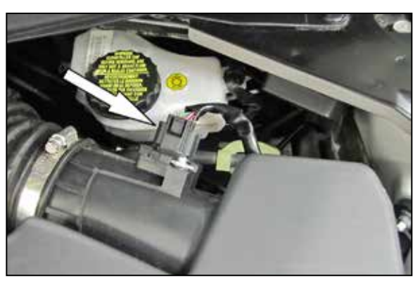
2. Disconnect the mass air sensor electrical connection and unhook the wiring harness from the air box.

NOTE: Disconnecting the negative battery cable erases pre-programmed electronic memories. Write down all memory settings before disconnecting the negative battery cable. Some radios will require an anti-theft code to be entered after the battery is reconnected. The anti-theft code is typically supplied with your owner's manual. In the event your vehicles anti-theft code cannot be recovered, contact an authorized dealership to obtain your vehicles anti-theft code.