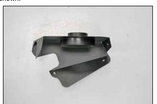
10. Install the filter adapter into the heat shield and secure with the provided hardware.

Install the remaining 1" tall, male/female rubber mounted stud onto the air box mounting bracket as shown.