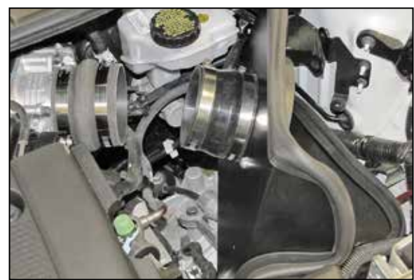
16. Install the provided coupling hose (08051) onto the filter adapter and secure with the provided hose clamp.