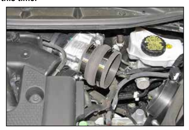
15. Install the provided hump hose (08171) onto the throttle body and secure with provided hose clamp.

NOTE: Do not secure the mounting bracket at this time.