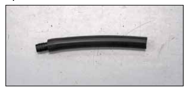
21. Install the hose mender into the provided crank case vent hose as shown.

NOTE: On Nissan Pathfinder and Infiniti JX35 vehicles, the mounting bracket will be secured to the rubber mounted stud installed during step #9.