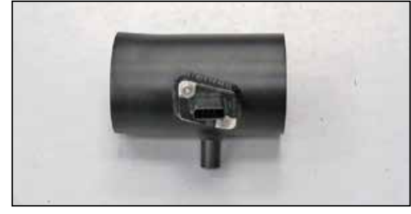
18. Install the mass air sensor into the K&N<sup>®</sup> intake tube and secure with the provided hose clamp.