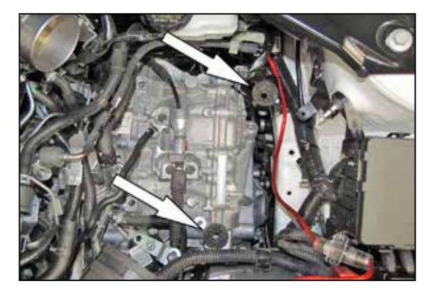
7. Remove the two air box mounting grommets shown from the mounting brackets.