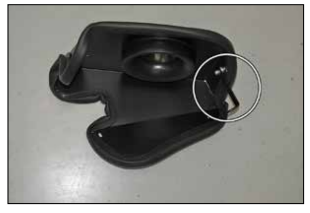
12. THIS STEP IS FOR THE NISSAN ALTIMA, FOR NISSAN PATHFINDER AND INFINITI JX35 VEHICLES, SKIP TO STEP #13.

NOTE: Some trimming of the edge trim will be necessary.