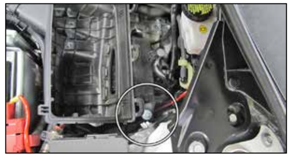
6. Remove the bolt which secures the lower air box to the mounting bracket. Remove the lower air box from the vehicle.

NOTE: It will be necessary to unhook the transmission vent line from the air box as it is being lifted out.