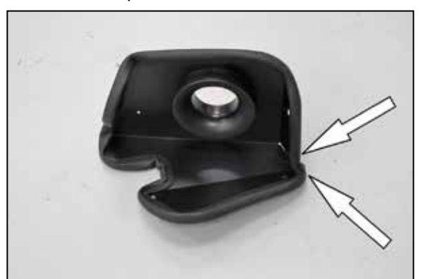
11. Install the provided edge trim on to the heat shield as shown.

NOTE: Some trimming of the edge trim will be necessary.