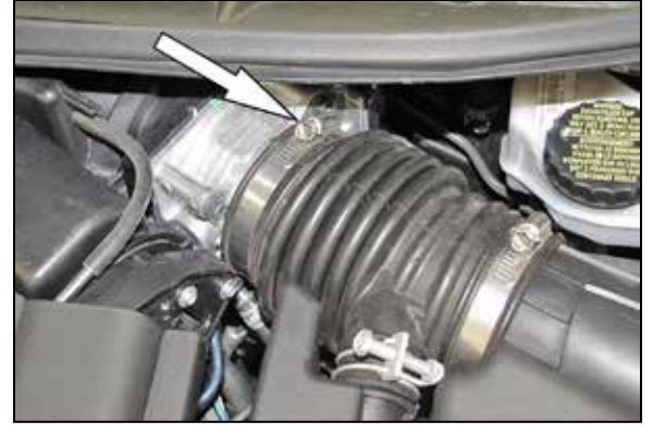
3. Loosen the hose clamp which secures the intake hose to the throttle body.