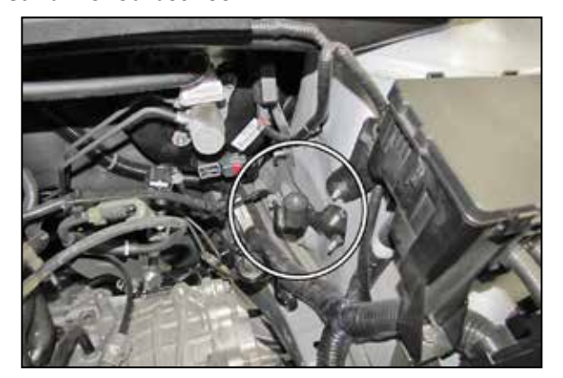
9. THIS STEP IS FOR THE NISSAN PATHFINDER AND INFINTI JX35 VEHICLES ONLY.

Install the remaining 1" tall, male/female rubber mounted stud onto the air box mounting bracket as shown.