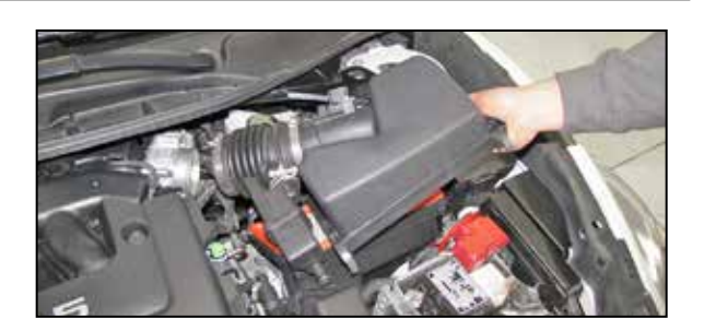
5. Release the two upper air box retaining clips and then remove the upper air box assembly.