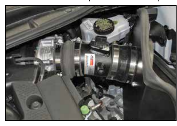
19. Install the K&N® intake tube into the hump hose, Pull the heat shield forward and install the intake tube into the hose at the filter adapter. Adjust the tube for best fit and then secure the tube with the provided hose clamps.