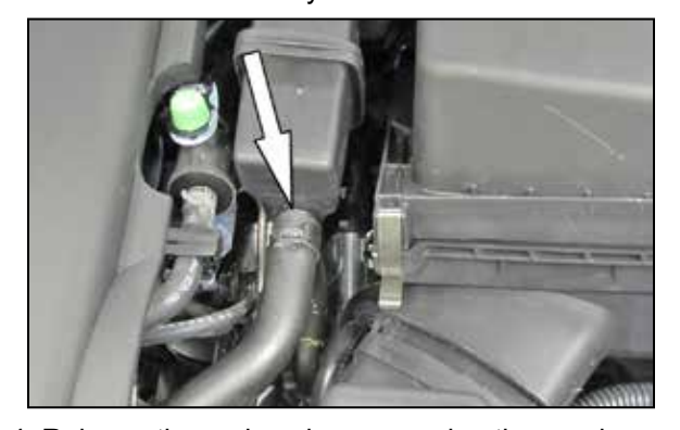
4. Release the spring clamp securing the crank case vent hose to the intake plenum and then disconnect the crank case vent hose.