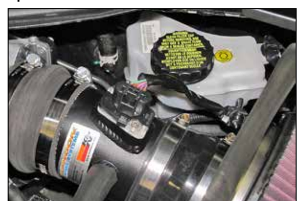
24. Reconnect the mass air sensor electrical connection.