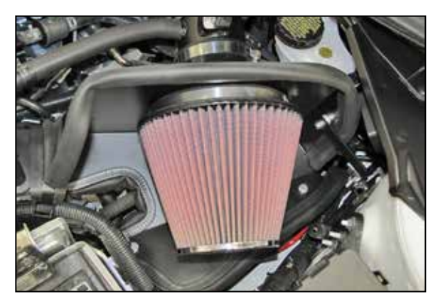
23. Install the K&N® air filter onto the filter adapter and secure with the provided hose clamp. NOTE: Drycharger® air filter wrap; part # RF-1048DK is available to purchase separately. To learn more about Drycharger® filter wraps or look up color availability please visit http://www.knfilters.com®.