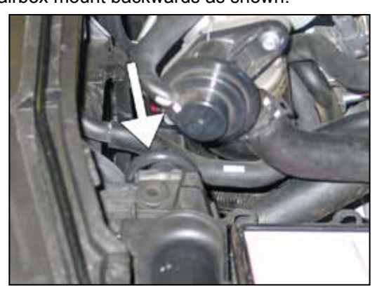
10. Unhook the rubber band that secures the airbox as shown.