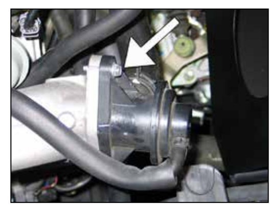
23. Remove the solenoid valve mounting bolt shown.