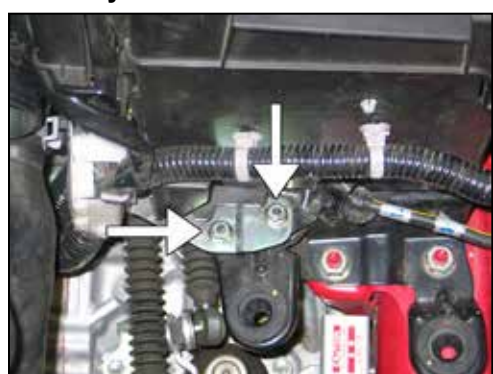
14. Remove the two nuts that secure the wiring harness loom as shown.

NOTE: Some trimming of the edge trim may be necessary.