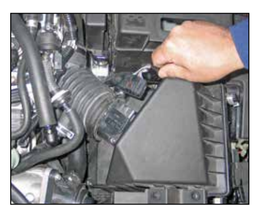
3. Disconnect the mass air sensor electrical connection as shown.