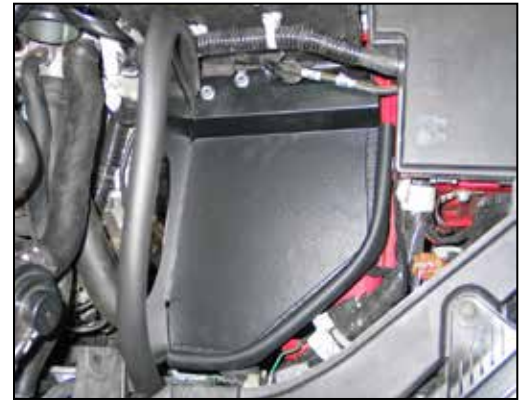
16. Install the heat shield onto the wiring loom mounting studs, then secure with the nuts removed in step #14.