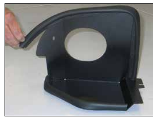
13. Install the long edge trim onto the heat shield as shown.

NOTE: Some trimming of the edge trim may be necessary.