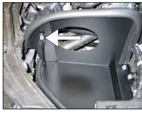
17. Install the heat shield mounting bracket (07945) onto the heat shield with the provided hardware. NOTE: Do not tighten the mounting bracket at this time.