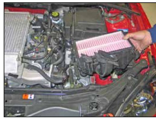
11. Lift upwards to dislodge the lower airbox from the mounting grommets. Remove the lower airbox from the vehicle as shown.

NOTE: K&N Engineering, Inc., recommends that customers do not discard factory air intake.