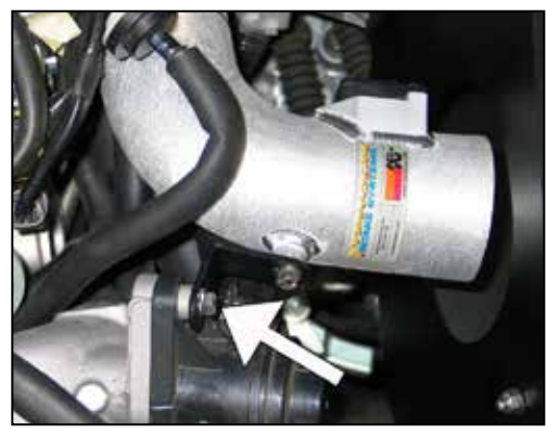
25. Align the intake tube mounting bracket with the solenoid valve, install the provided spacer under the mounting bracket, and secure with the provided hardware. Tighten the hose clamps at the turbo inlet.