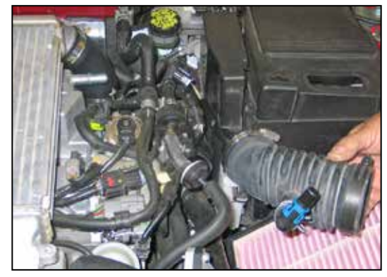
8. Loosen the hose clamp that secures the intake tube to the turbo inlet, then remove the intake tube as shown.