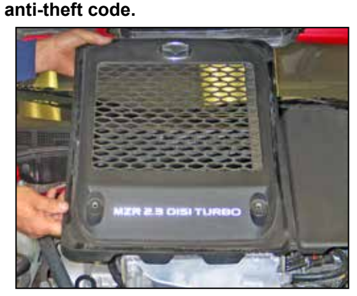
2. Remove the two bolts that secure the intercooler cover, then remove the intercooler cover as shown.

NOTE: Disconnecting the negative battery cable erases pre-programmed electronic memories. Write down all memory settings before disconnecting the negative battery cable. Some radios will require an anti-theft code to be entered after the battery is reconnected. The anti-theft code is typically supplied with your owner's manual. In the event your vehicles' anti-theft code cannot be recovered, contact an authorized dealership to obtain your vehicles