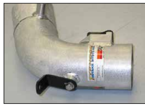
21. Install the tube mounting bracket (#07804) onto the K\&N^{\circledR} intake tube with the provided hardware as shown.