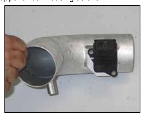
20. Install the mass air sensor into the K&N<sup>®</sup> intake tube with the provided hardware as shown.