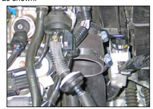
22. Install the provided silicone hose (#084016) onto the turbo inlet with the provided hose clamp as shown.