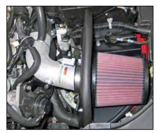
27. Install the K&N® air filter onto the intake tube and secure with the provided hose clamp.