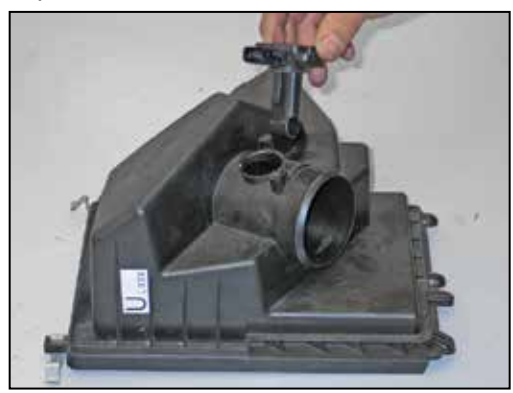
19. Remove the mass air sensor from the stock upper airbox housing as shown.