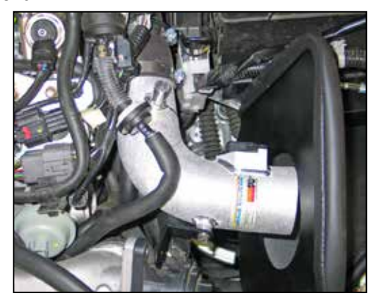
24. Install the K&N® intake tube into the silicone hose at the turbo inlet.