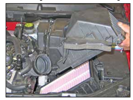
6. Remove the upper airbox housing from the vehicle as shown.