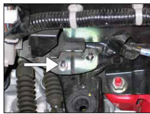
15. Install the provided spacer onto the inner wiring loom stud as shown.

NOTE: The two nuts will be reused in a later step.