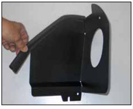
12. Install the short edge trim onto the heat shield as shown.

NOTE: K&N Engineering, Inc., recommends that customers do not discard factory air intake.