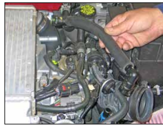
7. Unclip the crankcase vent hose. Remove the complete vent hose as shown.