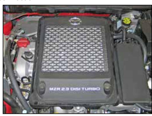
29. Reinstall the engine cover and secure with the factory bolts (removed in step #2).