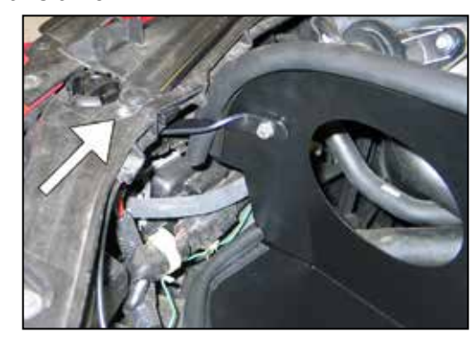
18. Swing the heat shield bracket up under the core support, then mount to the core support using the provided hardware as shown.