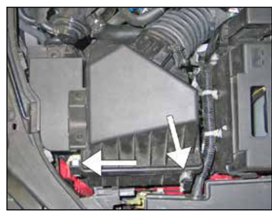
5. Release the two clips that secure the upper airbox housing to the lower airbox housing.