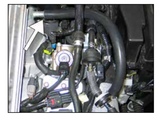
26. Install the provided crankcase vent hose onto the intake tube. Connect the open end to the crankcase vent port (on the engine) as shown.