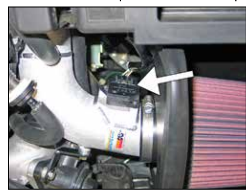
28. Re-connect the mass air sensor electrical connection.