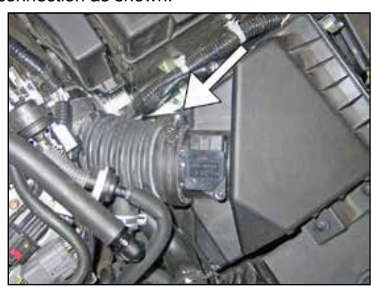
4. Loosen the hose clamp that secures the intake tube to the upper airbox housing.