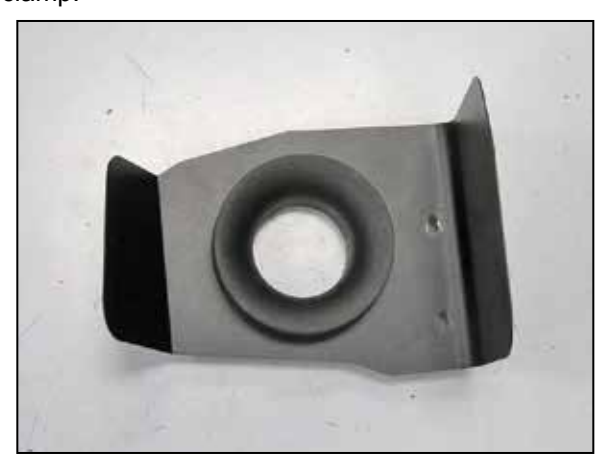
8. Install the provided filter adapter into the heat shield and secure with the provided hardware.