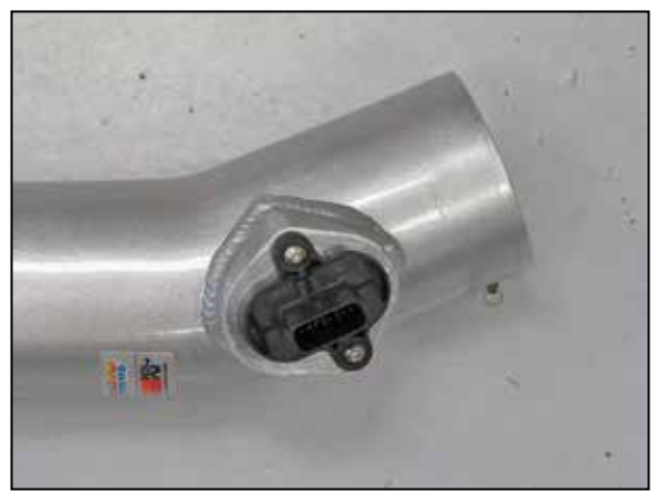
15. Install the mass air sensor into the K&N® intake tube and secure with the provided hardware.