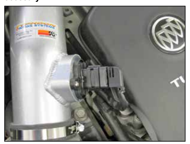
20. Reconnect the mass air sensor electrica connection.