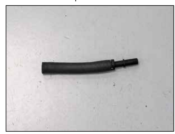
18. Install the provided quick disconnect union into the provided crank case breather hose.