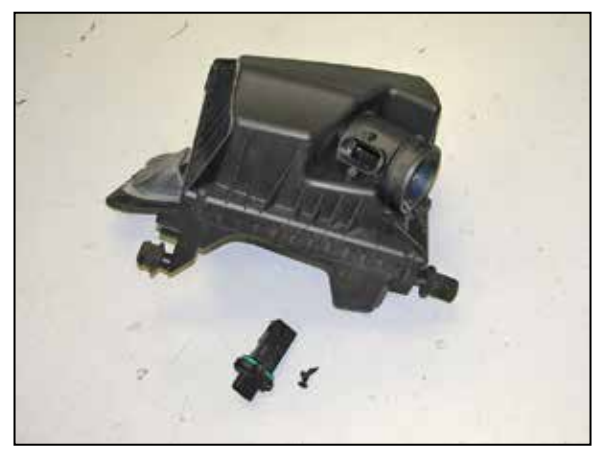
14. Remove the mass air sensor from the factory air filter housing.