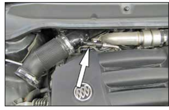
6. Disconnect the crank case vent quick disconnect fitting and then loosen the hose clamp that secures the intake tube to the turbo inlet. Remove the intake hose assembly.

NOTE: K&N Engineering, Inc., recommends that customers do not discard factory air intake.