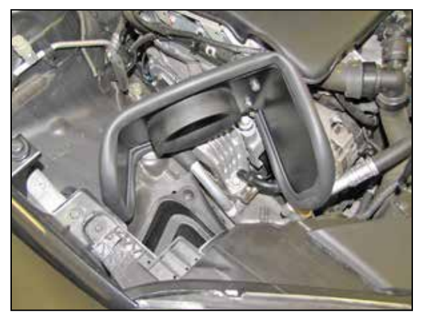
12. Using the factory bolt from the previous step, install the heat shield and spacer onto the motor mount as shown.

NOTE: Do not completely tighten at this time. The spacer is to be placed between the bracket and motor mount. Do not completely tighten the bolt at this time.