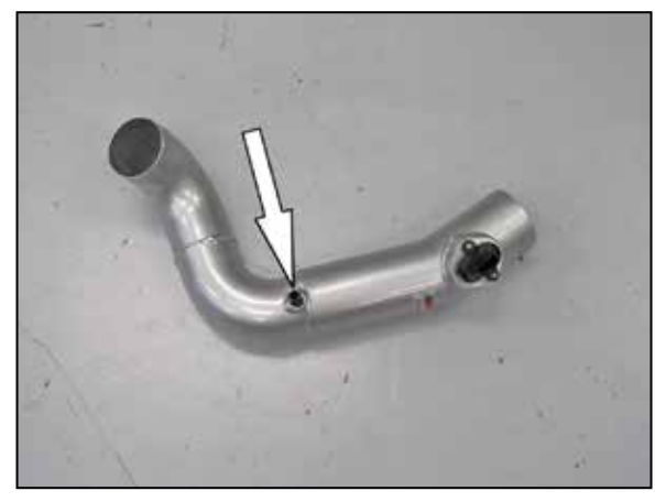
16. Install the provided vent fitting into the K&N® intake tube as shown.

NOTE: Plastic NPT fittings are easy to cross thread. Install the vent fitting "hand" tight, then turn it two complete turns with a wrench.