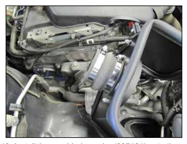
13. Install the provided coupler (087121) onto the filter adapter and secure with the provided hose clamp.

NOTE: Do not completely tighten at this time. The spacer is to be placed between the bracket and motor mount. Do not completely tighten the bolt at this time.