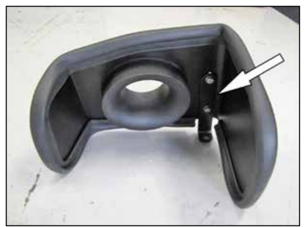
10. Install the provided heat shield mounting bracket (064344) onto the heat shield using the provided hardware.