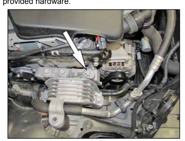
11. Remove the front motor mount bolt shown. NOTE: This bolt will be reused in the next step.