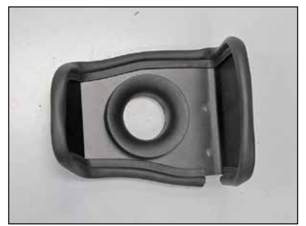
9. Install the provided edge trim onto the heat shield as shown.