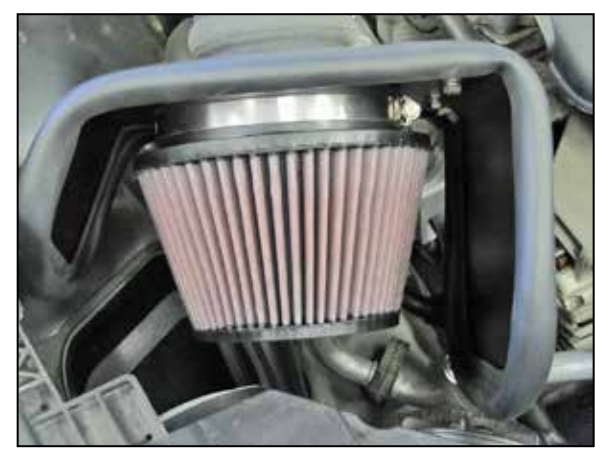
21. Install the K&N® air filter and secure with the provided hose clamp.

NOTE: Drycharger® air filter wrap; part # RU-5163DK is available to purchase separately. To learn more about Drycharger® filter wraps or look up color availability please visit http://www.knfilters.com®.