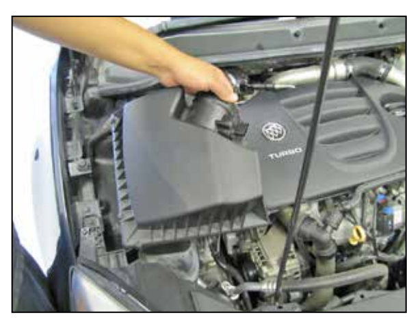
5. Lift up the air filter housing to dislodge it from the mounting grommets and then remove it from the vehicle.