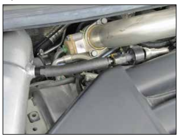
19. Install the crank case breather assembly into the factory quick disconnect fitting and then onto the vent fitting installed into the K&N® intake tube. NOTE: Some trimming of the vent hose may be necessary.