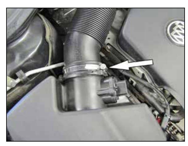
3. Loosen the hose clamp that secures the intake hose to the air filter housing.