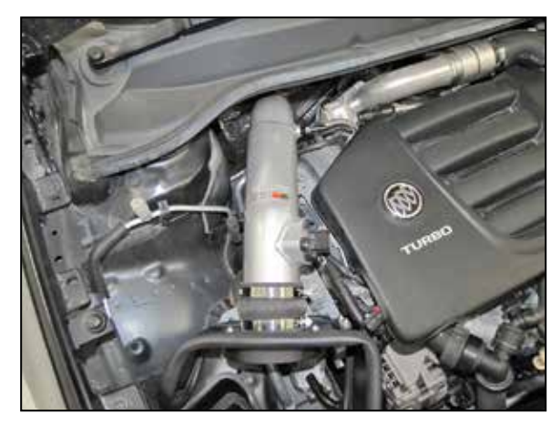
17. Install the K&N® intake tube into the turbo coupler and then into the filter adapter coupler. Adjust the tube and heat shield for best fit and then secure the hose clamps and heat shield hardware.

NOTE: Plastic NPT fittings are easy to cross thread. Install the vent fitting "hand" tight, then turn it two complete turns with a wrench.