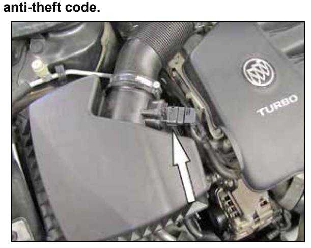
2. Disconnect the mass air sensor electrical connection.

NOTE: Disconnecting the negative battery cable erases pre-programmed electronic memories. Write down all memory settings before disconnecting the negative battery cable. Some radios will require an anti-theft code to be entered after the battery is reconnected. The anti-theft code is typically supplied with your owner's manual. In the event your vehicles anti-theft code cannot be recovered, contact an authorized dealership to obtain your vehicles