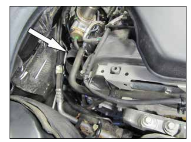
7. Install the provided coupling hose (084016) onto the turbo inlet and secure with the provided hose clamp.